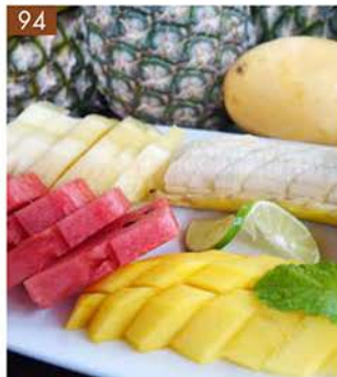
SEASONAL FRESH FRUIT PLATE ผลไม้ตามฤดูกาล