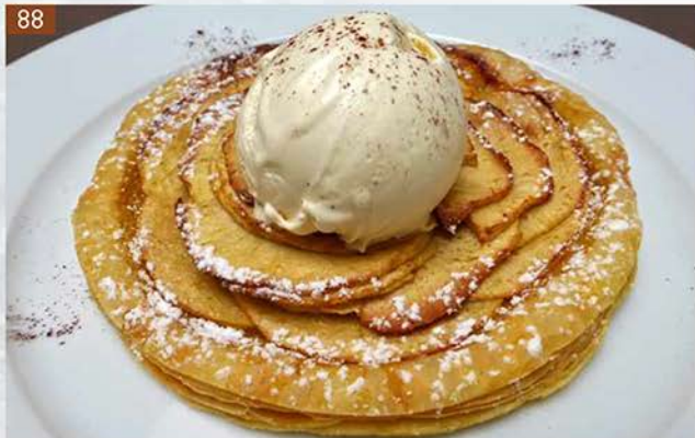
CRISPY APPLE TART with salted caramel ice cream ทาร์ทแอปเปิ้ล