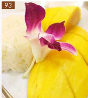
MANGO STICKY RICE with coconut milk ข้าวเหนียวมะม่วง