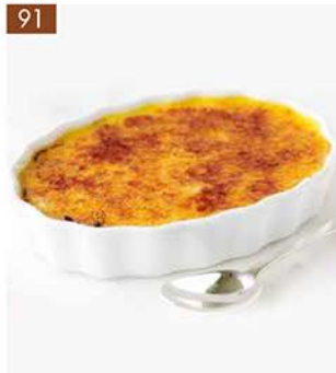
CREME BRULEE ครีม บรูเล่