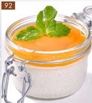
MANGO PANACOTTA พานาคอตต้ามะม่วง