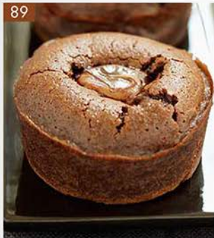
CHOCOLATE CAKE with vanilla ice cream เค้กช็อกโกแลต