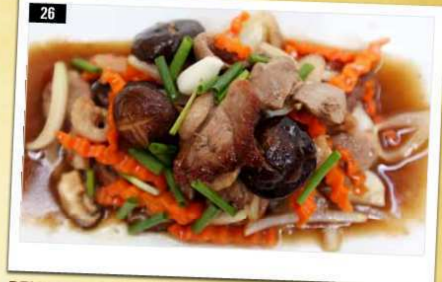
26 PEKING DUCK WITH OYSTER SAUCE AND GINGER Served with jasmine rice เป็ดปักกิ่งผัดซิง 190 THB