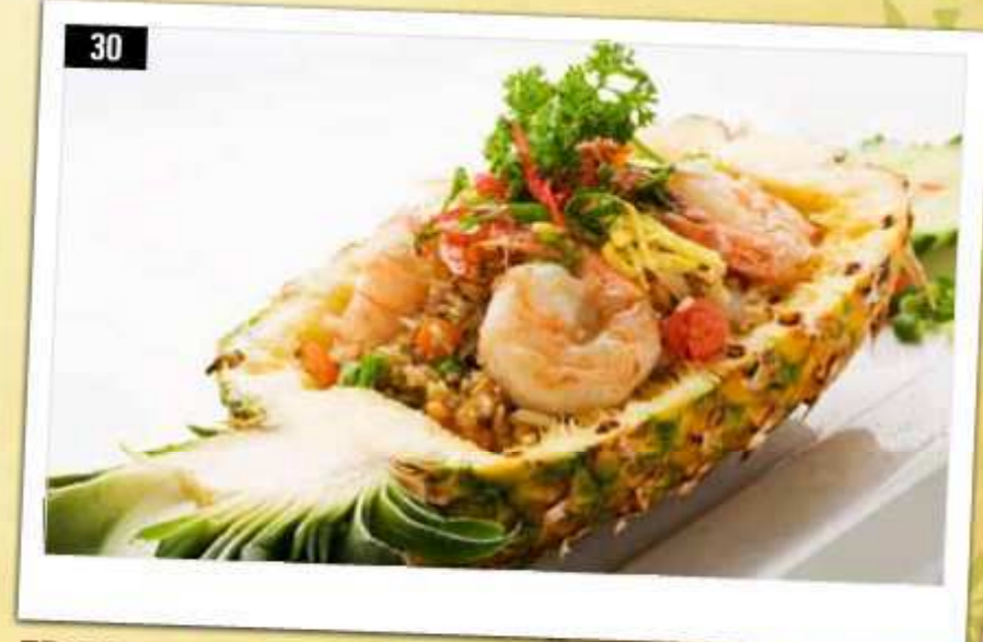
30 FRIED RICE IN PINEAPPLE KAO OB SAPAROT ข้าวผัดสับปะรด 220 THB