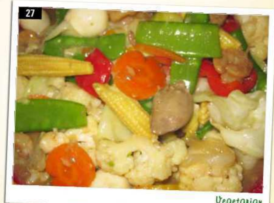
27 SAUTEED VEGETABLES WITH OYSTER SAUCE Sautéed vegetables with oyster sauce ผัดผักรวมน้ำมันหอย 160 THB Vegetarian