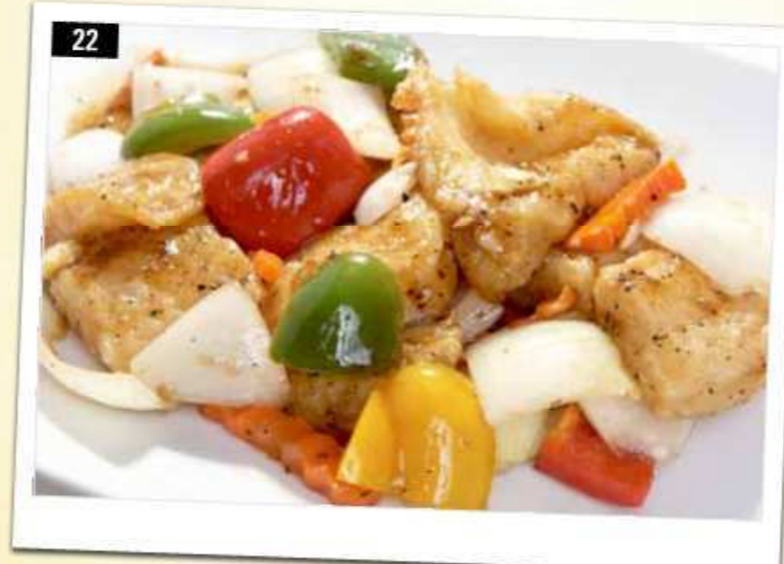
22 STIR FRIED SEA BASS WITH BLACK PEPPER SAUCE Served with jasmine rice ปลากระพงขาวผัดพริกไทยดำ 170 THB