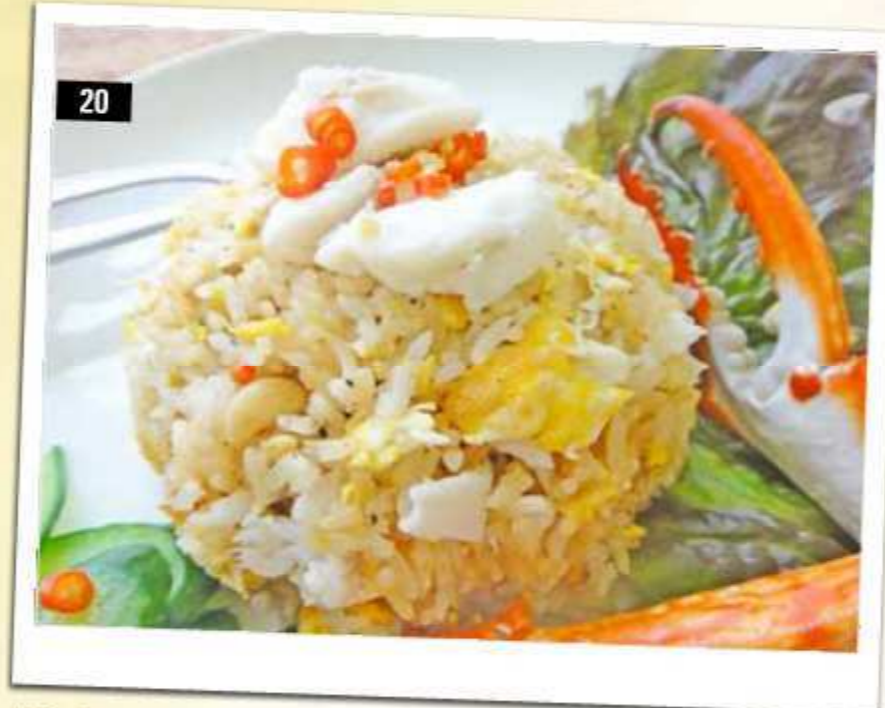
20 KAO PAD POO Fried rice with crab ข้าวผัดปู 190 THB