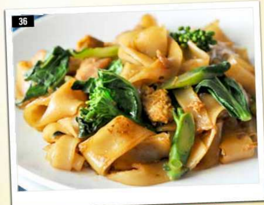
PAD SEE EW KAI OR KHUNG Pan fried flat rice noodle with vegetables, chicken or shrimps ผัดซีอิ้วไก่ หรือกุ้ง