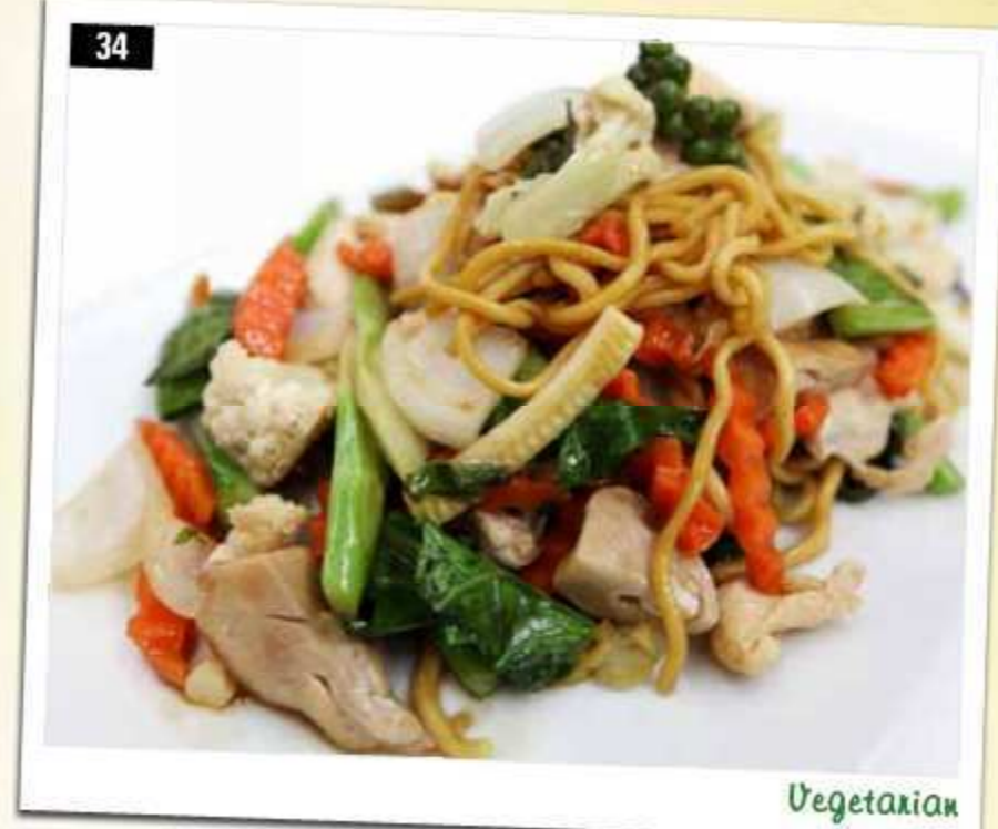
KI MAO VEGETARIAN Sauteed yellow noodle with basil leave and mixed vegetables ผัดซีอิ้วผัก