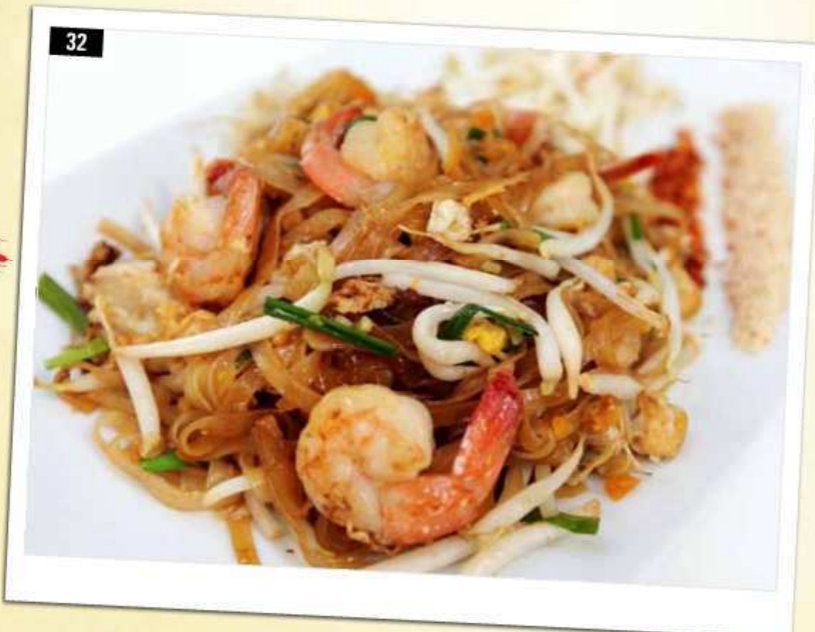
PAD THAI KHUNG Pan fried rice noodles with shrimps, tofu, green onions and egg ผัดไทยกุ้ง