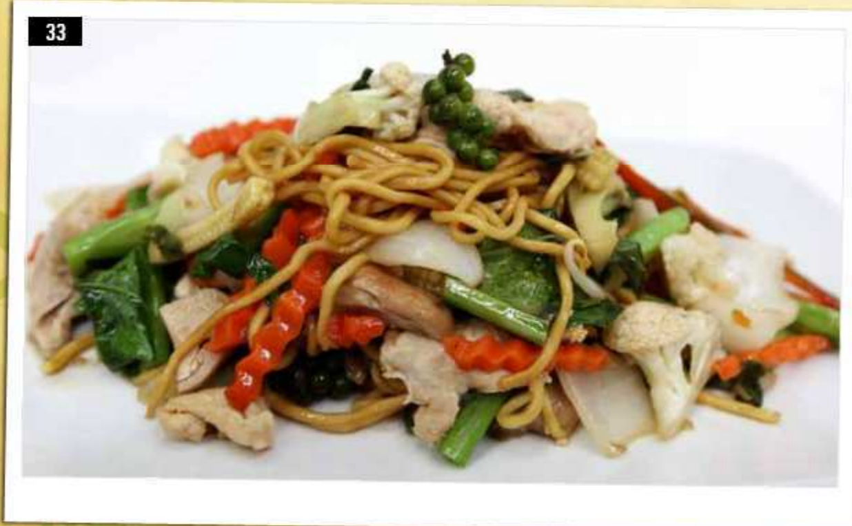
KI MAO KAI Sauteed yellow noodle with chicken, basil leave and mixed vegetable ผัดซีอิ้วไก่