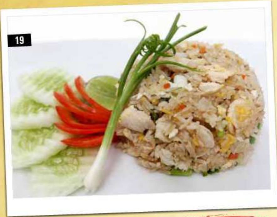
19 KAO PAD KAI OR KHUNG Fried rice with Chicken or Shrimps ข้าวผัดไก่ หรือกุ้ง 160/180 THB

Choice your taste No Spicy Little Spicy Spicy Verry Spicy