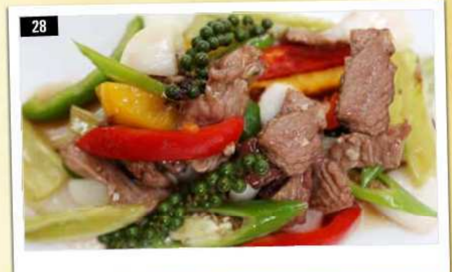
28 BEEF WITH GREEN PEPPER SAUCE Stir fried beef with green pepper sauce เนื้อผัดพริกไทยดำ 190 THB