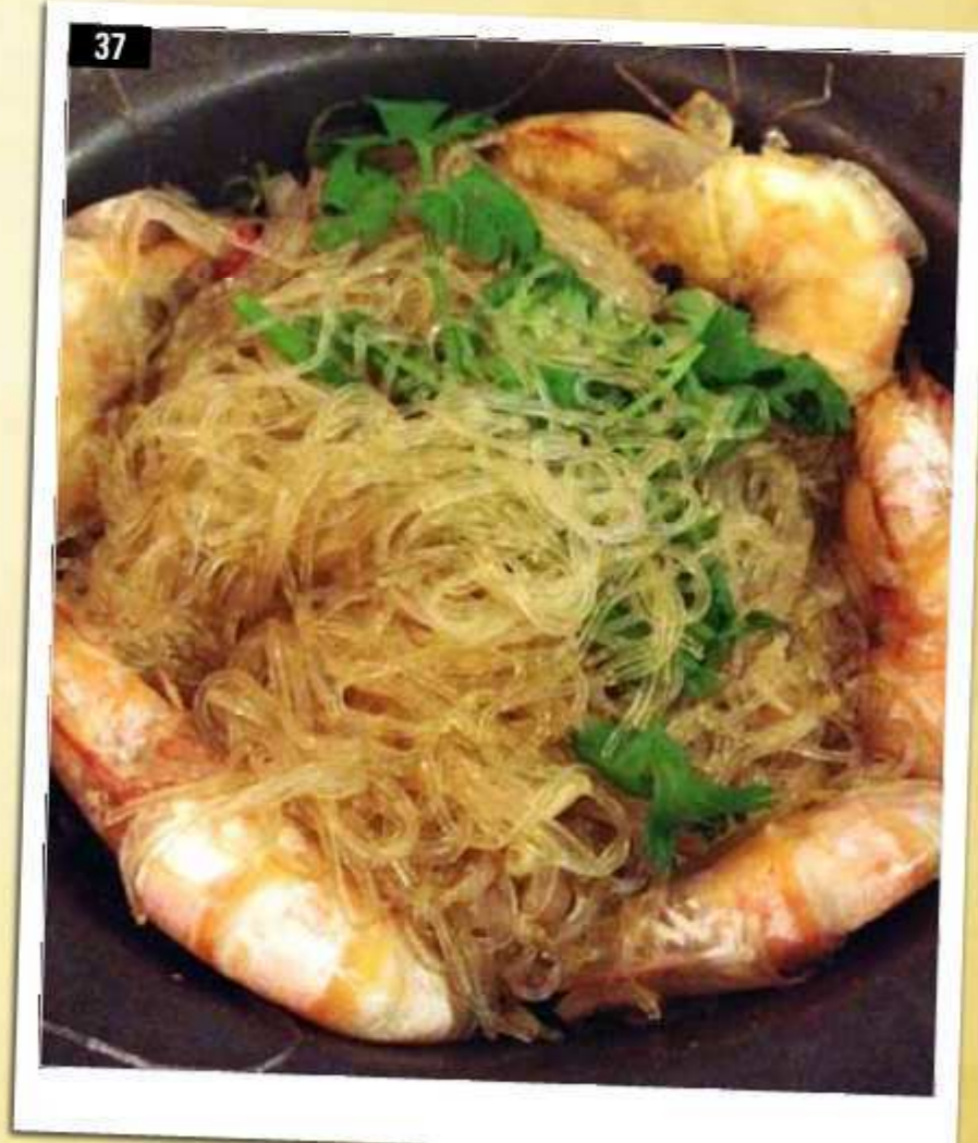
KHUNG OB WOON SEN Glass Noodle in clay pot with shrimps ก๊วยฮุ้นวุ้นเส้น