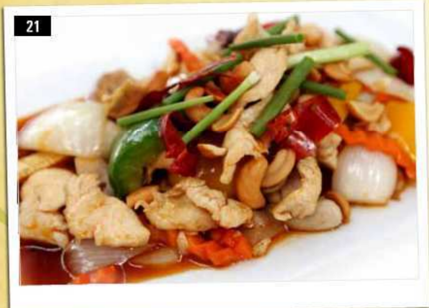
21 CHICKEN CASHEW NUTS Served with jasmine rice ไก่ผัดเม็ดมะม่วง 170 THB