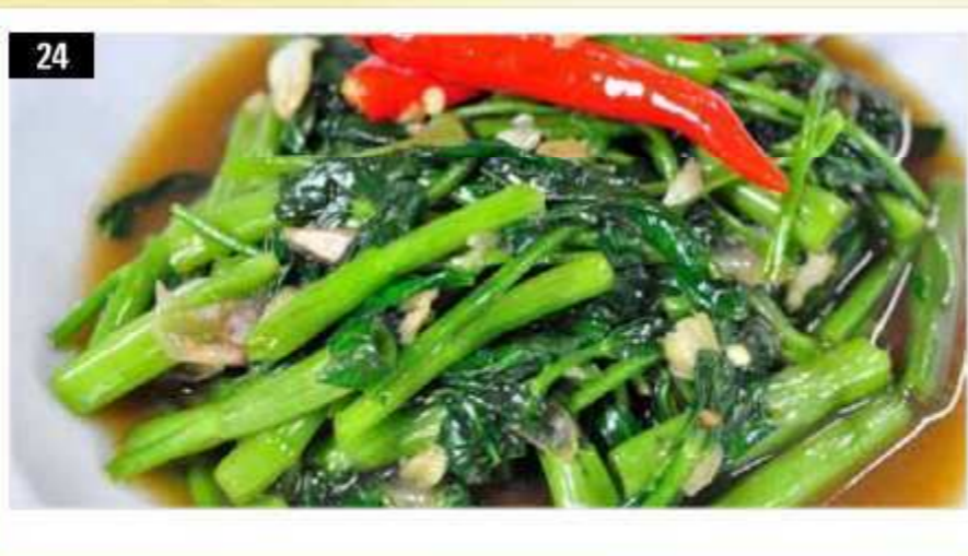
24 STIR FRIED MORNING GLORY ผัดผักบุ้ง 130 THB