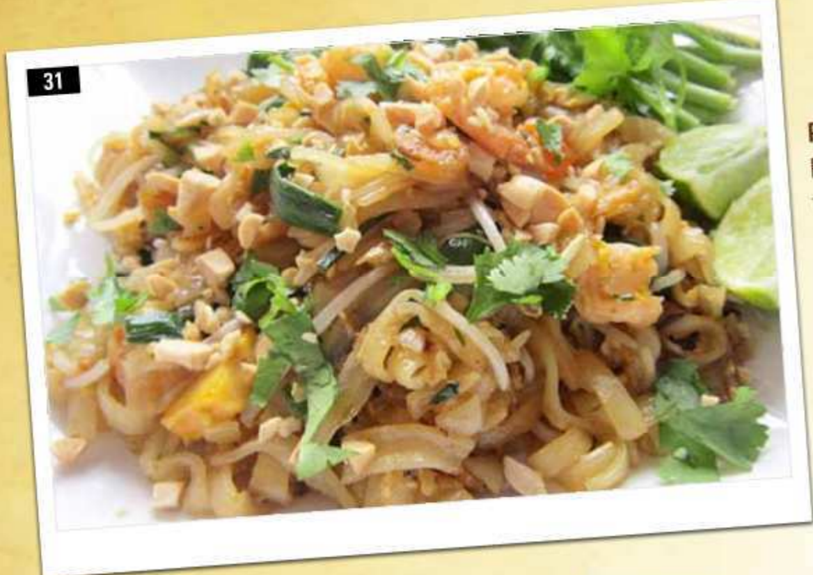
PAD THAI KAI Pan fried rice noodles with chicken, tofu, green onions and egg ผัดไทยไก่