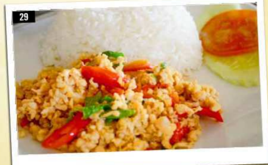
29 PAD KRA PAO KAI OR NEUA Pan fried Chicken or Beef with Thai basil and oyster sauce ผัดกะเพราไก่ หรือเนื้อ 170/190 THB