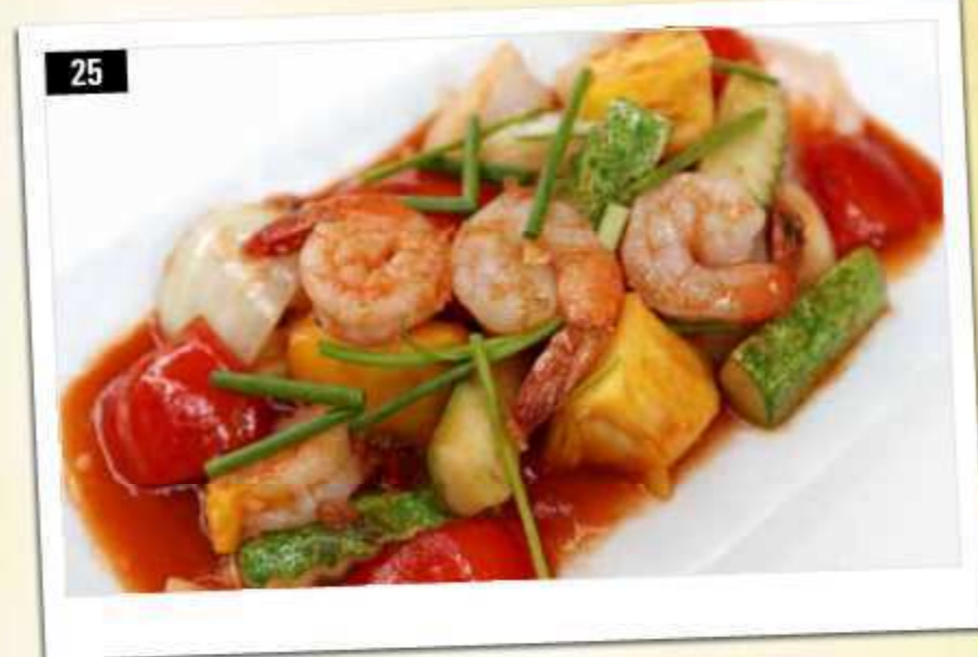
25 SWEET AND SOUR SHRIMP PINEAPPLE Served with jasmine rice ผัดเปรี้ยวหวานกุ้ง 190 THB

Choice your taste No Spicy Little Spicy Spicy Verry Spicy