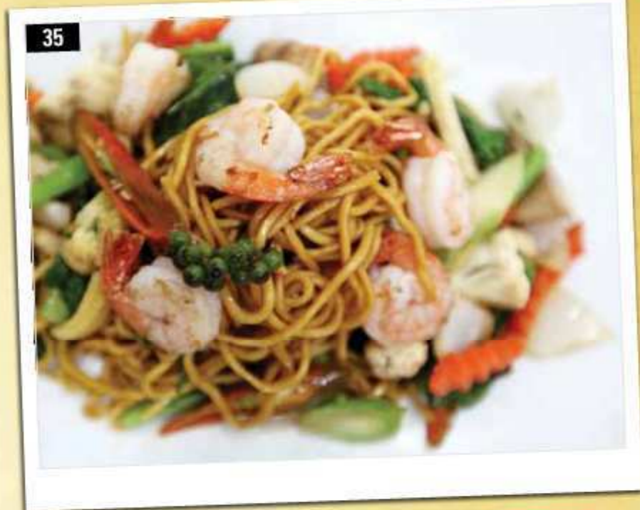
KI MAO KHUNG Sauteed yellow noodle with shrimps, basil leave and mixed vegetable ผัดซีอิ้วกุ้ง