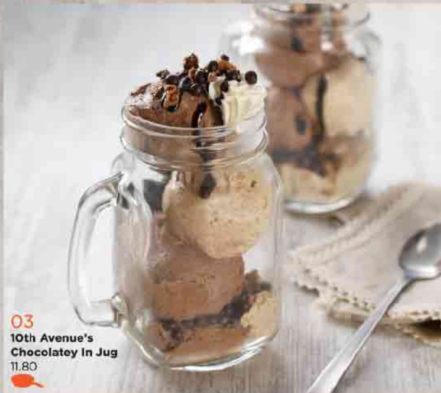
03 10th Avenue's Chocolatey In Jug 11.80