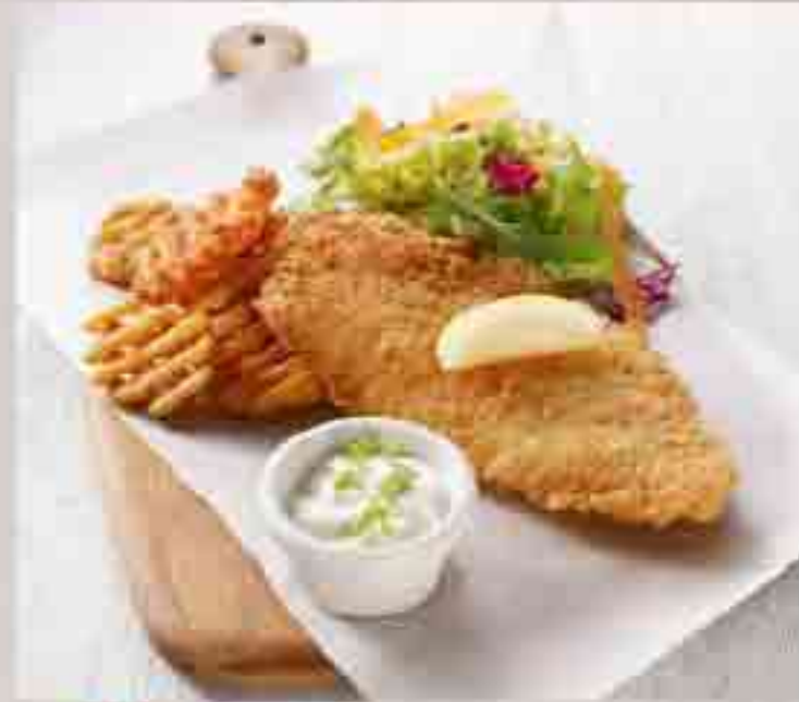
50 Fish & Chips 13.50