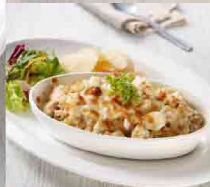
47 Chicken & Slipper Lobster Baked Rice 13.50