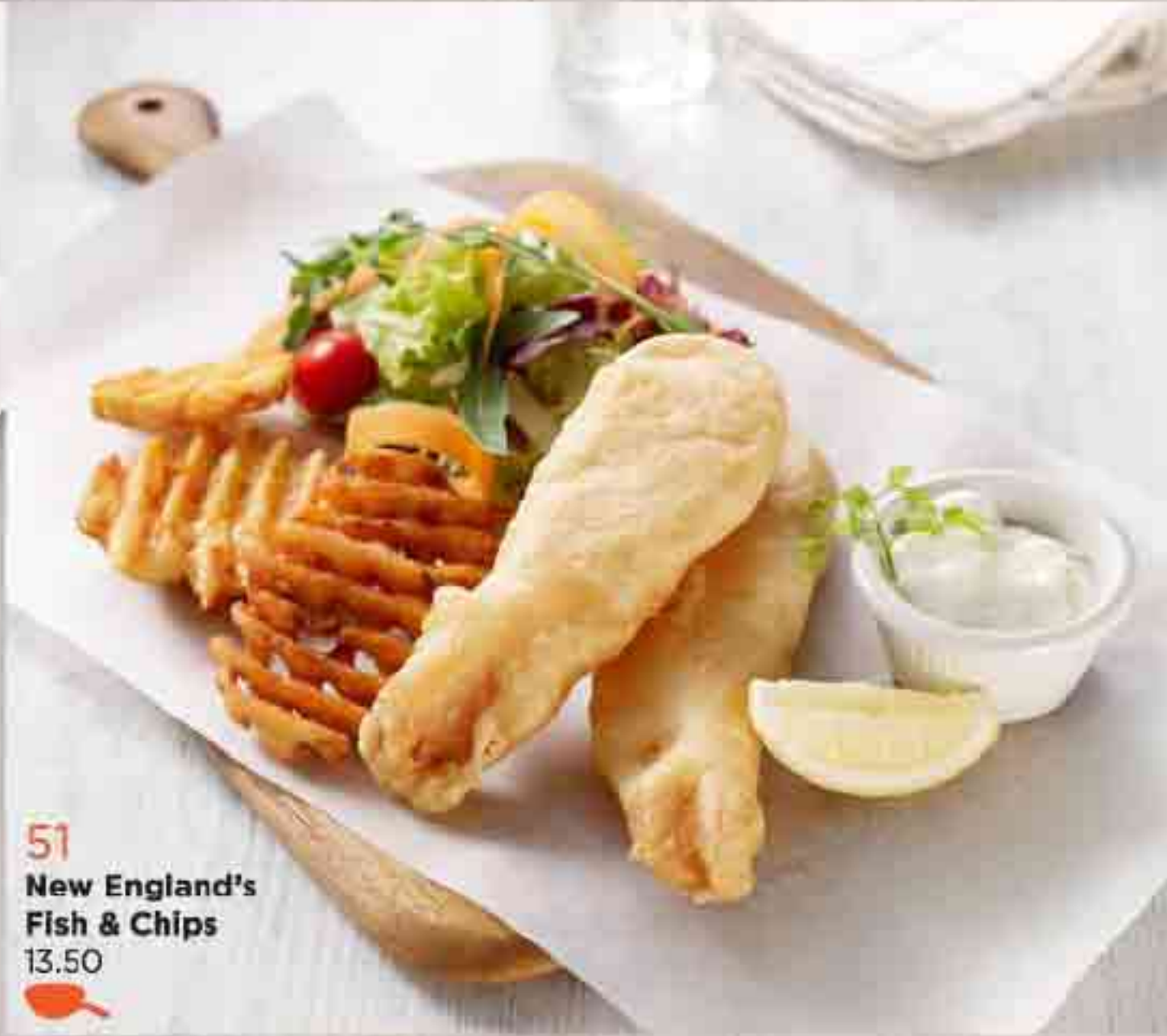
51 New England's Fish & Chips 13.50