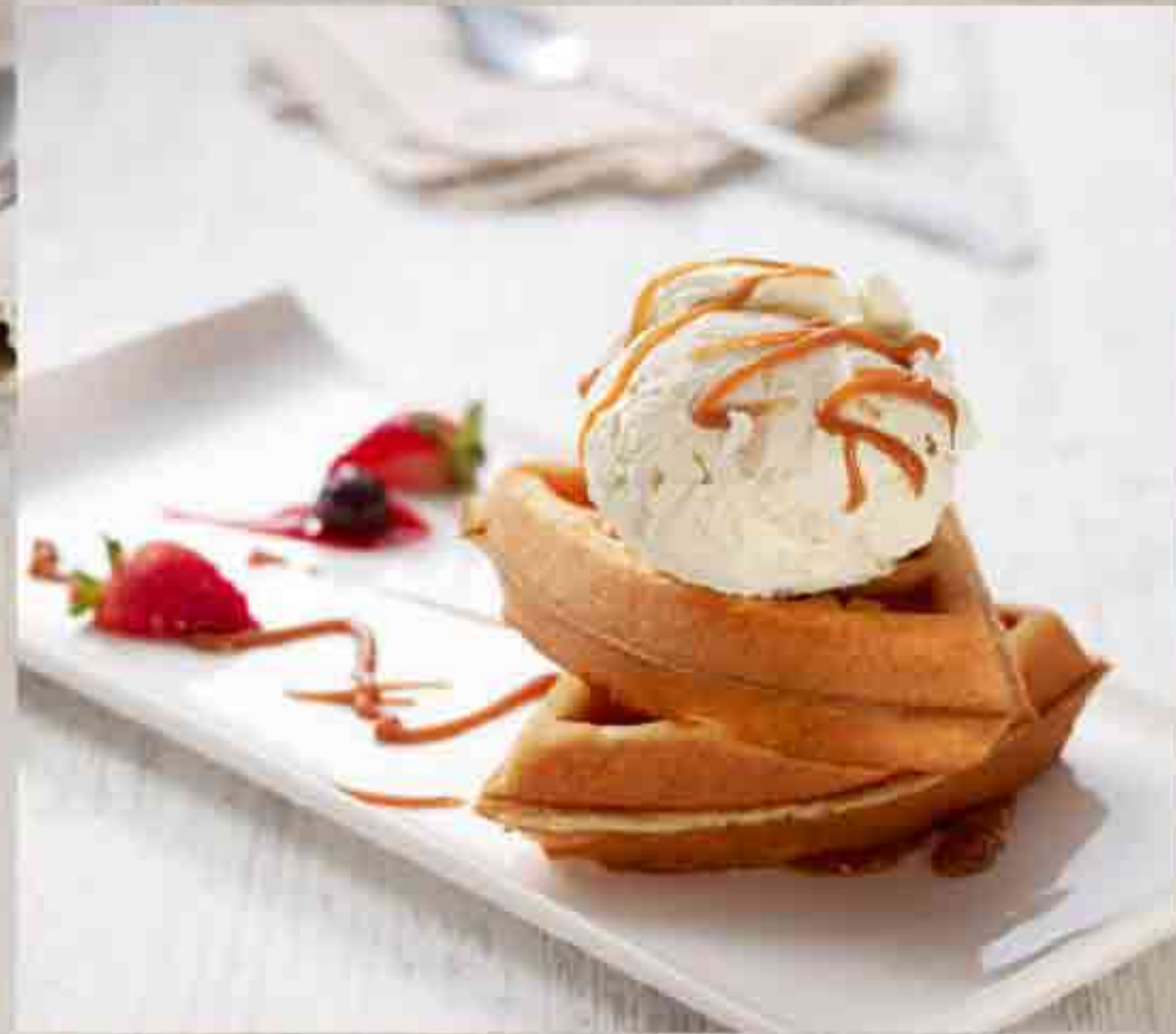
04 Eatzi's Waffle Classic Macadamia Nuts Ice Cream 7.80

Now available at all Eatzi Gourmet Bistro.