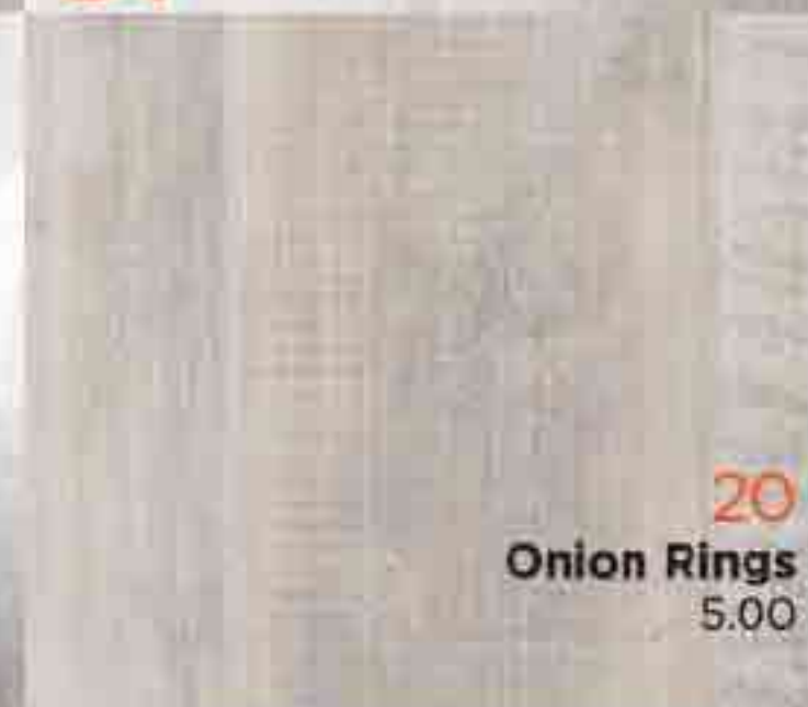
20 Onion Rings 5.00