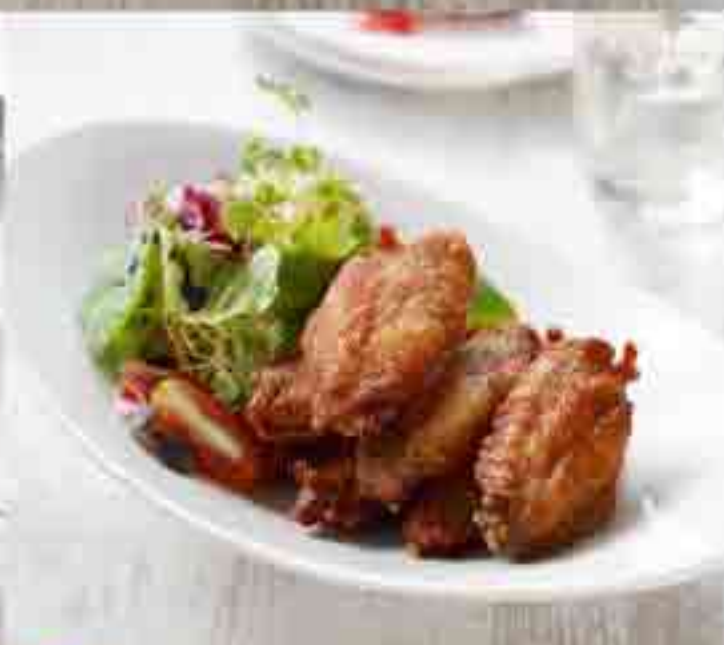
15 Golden Chicken Wings (half dozen) 8.50