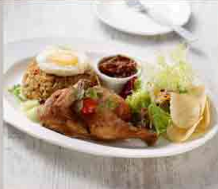
46 Nasi Goreng With Half Spring Chicken 13.80