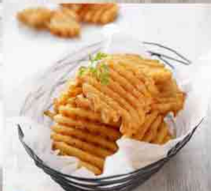
18 Waffle Fries 5.00