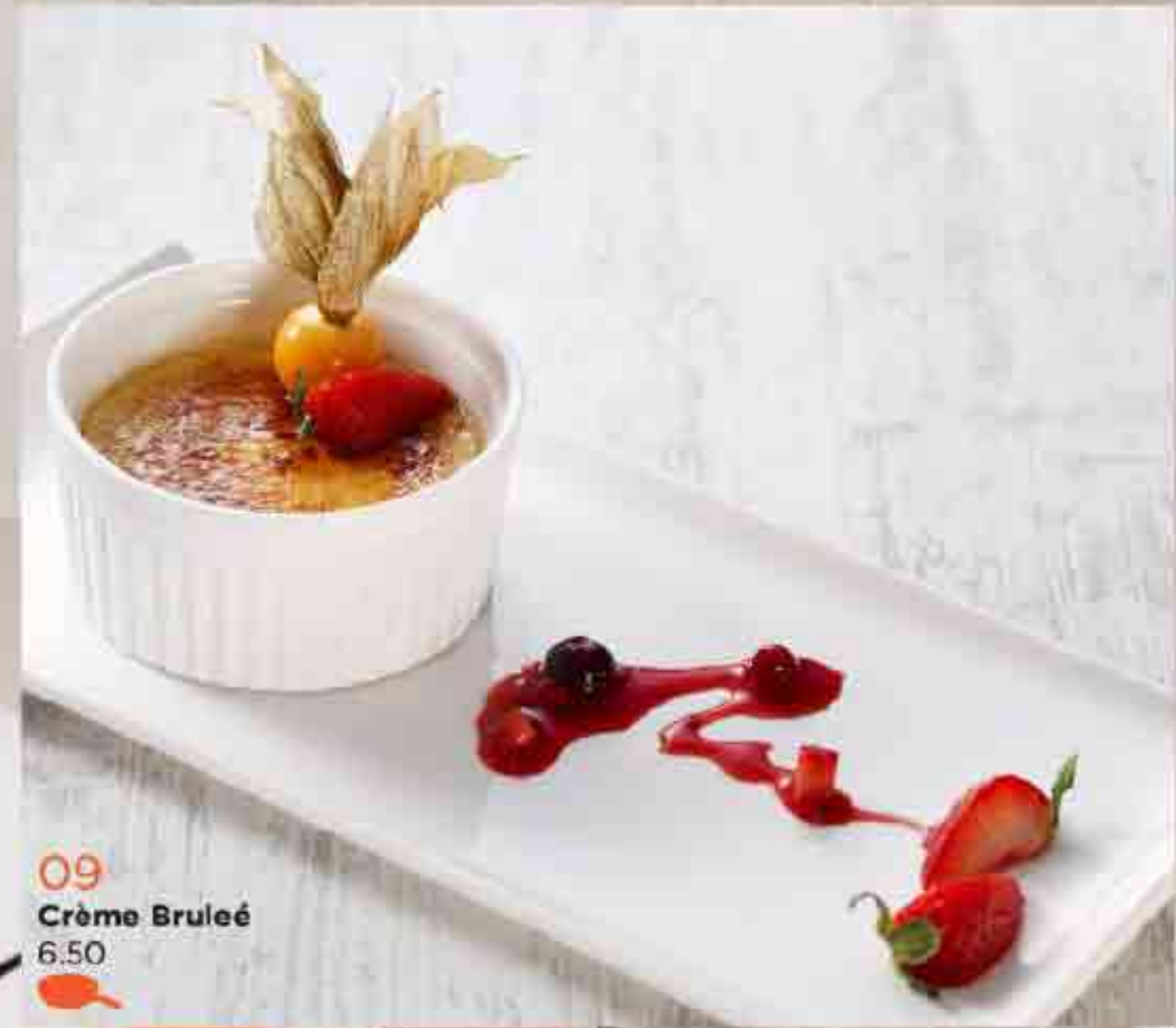
09 Crème Bruleé 6.50