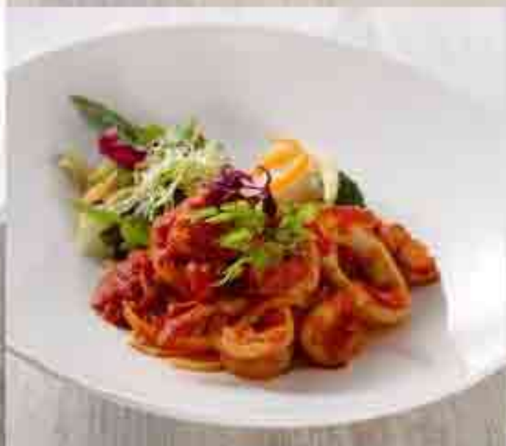
42 Seafood Spaghetti Marinara 15.00