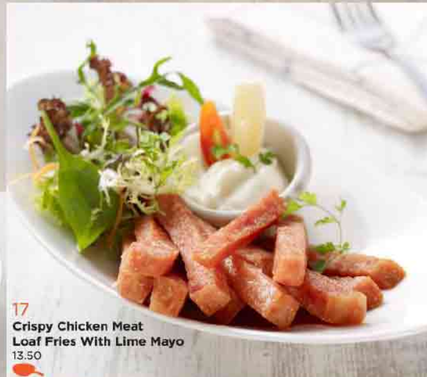
17 Crispy Chicken Meat Loaf Fries With Lime Mayo 13.50