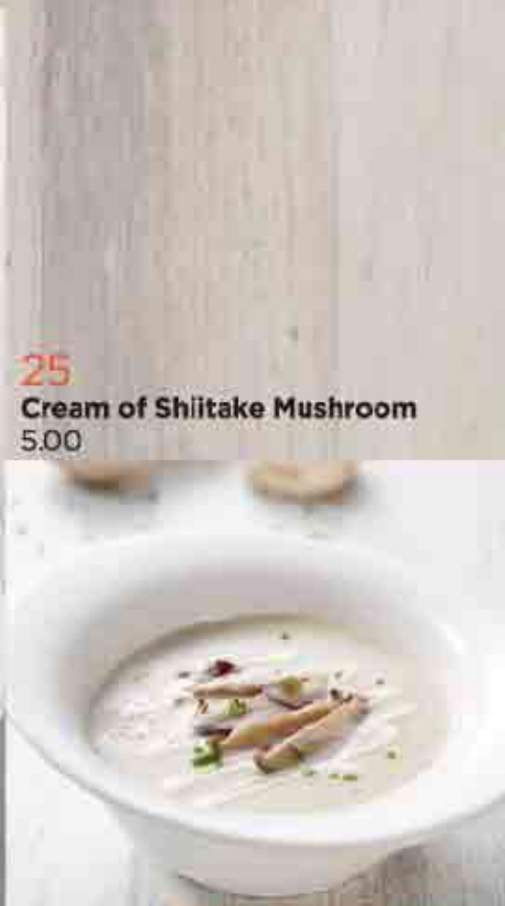
25 Cream of Shiitake Mushroom 5.00