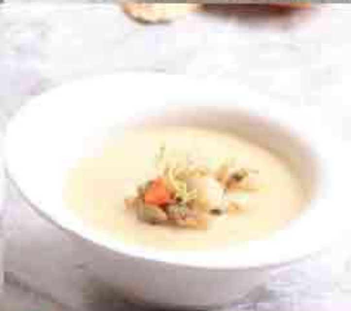
26 Soup of the Day (Please check with our server for today's soup) 4.50