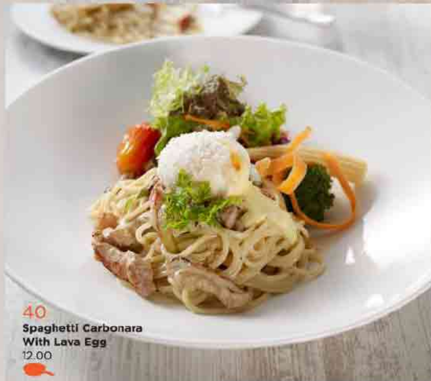
40 Spaghetti Carbonara With Lava Egg 12.00