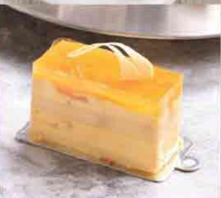
11 Cake Selection (per slice) Choice of our house specials • mango mousse cake, • chocolate mousse cake, • American cheesecake, • black forest cake) or simply select from our extensive range at the cake counter from 4.60