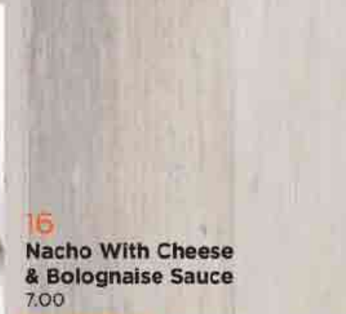
16 Nacho With Cheese & Bolognese Sauce 7.00