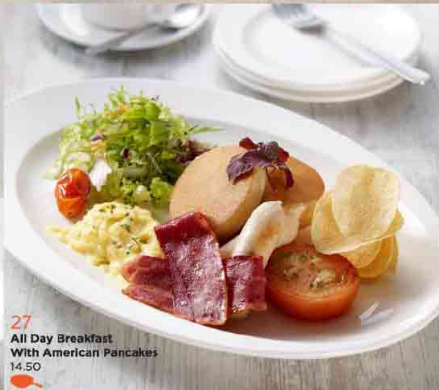
27 All Day Breakfast With American Pancakes 14.50