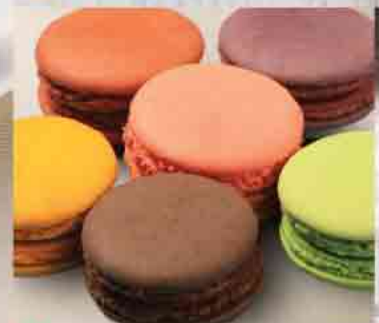
10 Macaron (per pc) 6 Assorted flavours: • Green Tea • Chocolate • Caramel • Lavender • Lemon • Raspberry 1.68