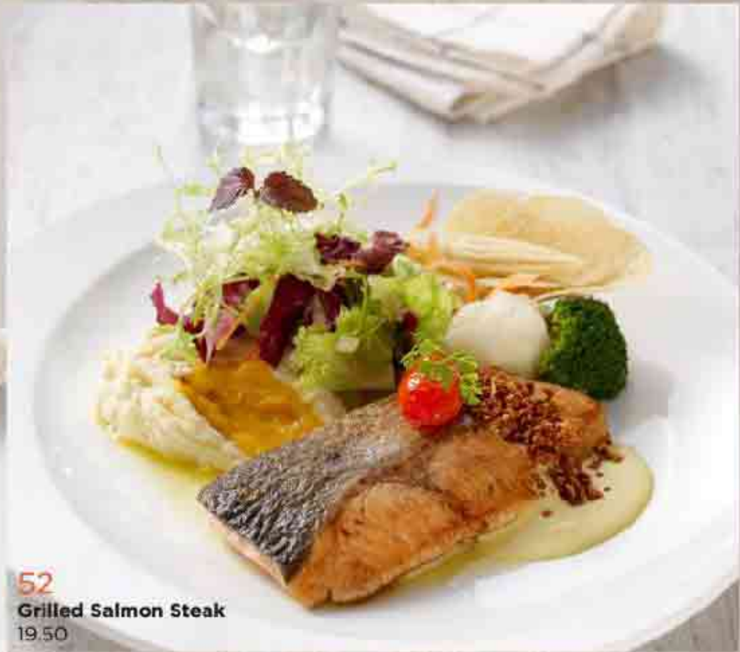
52 Grilled Salmon Steak 19.50