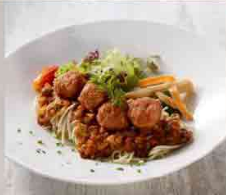
41 Chicken Meat Ball Spaghetti Bolognese 12.80