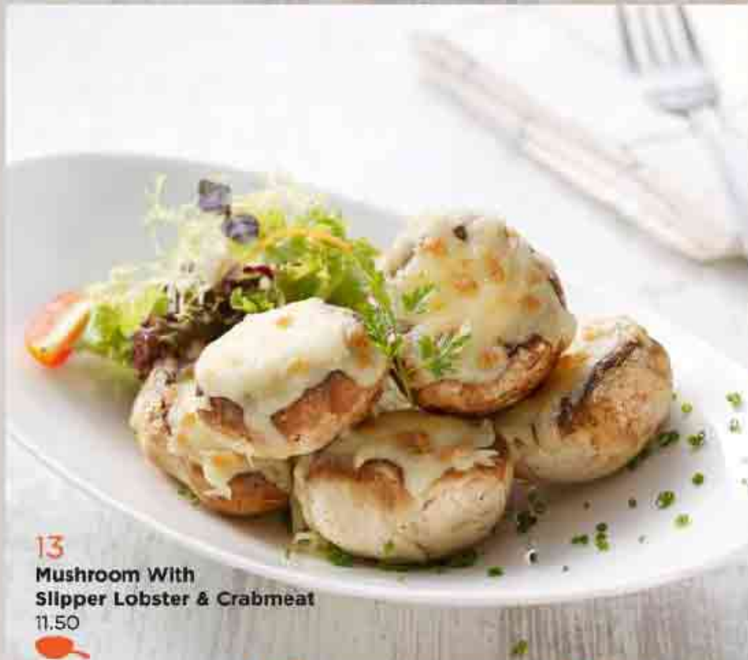
13 Mushroom With Slipper Lobster & Crabmeat 11.50