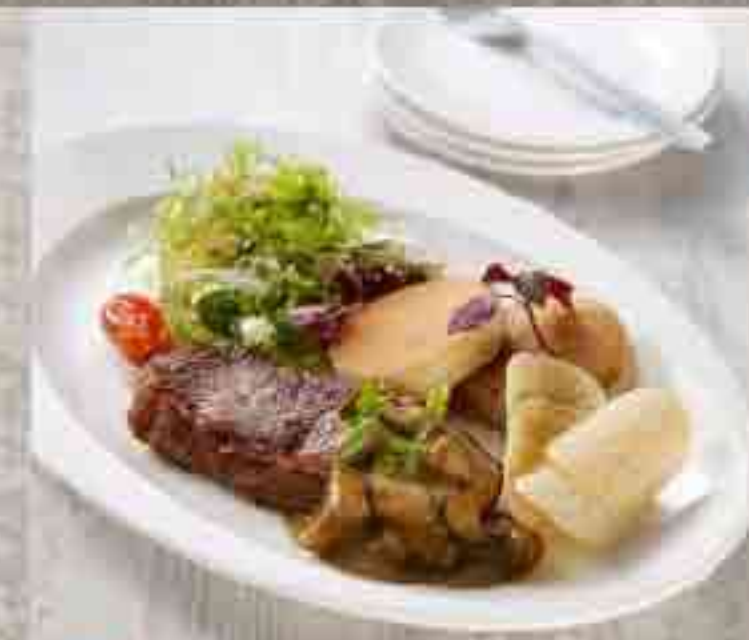
28 American Pancakes With Beef & Mushroom Ragout 15.50

Vegetable selection may change daily. Dish presentation may vary from what is shown