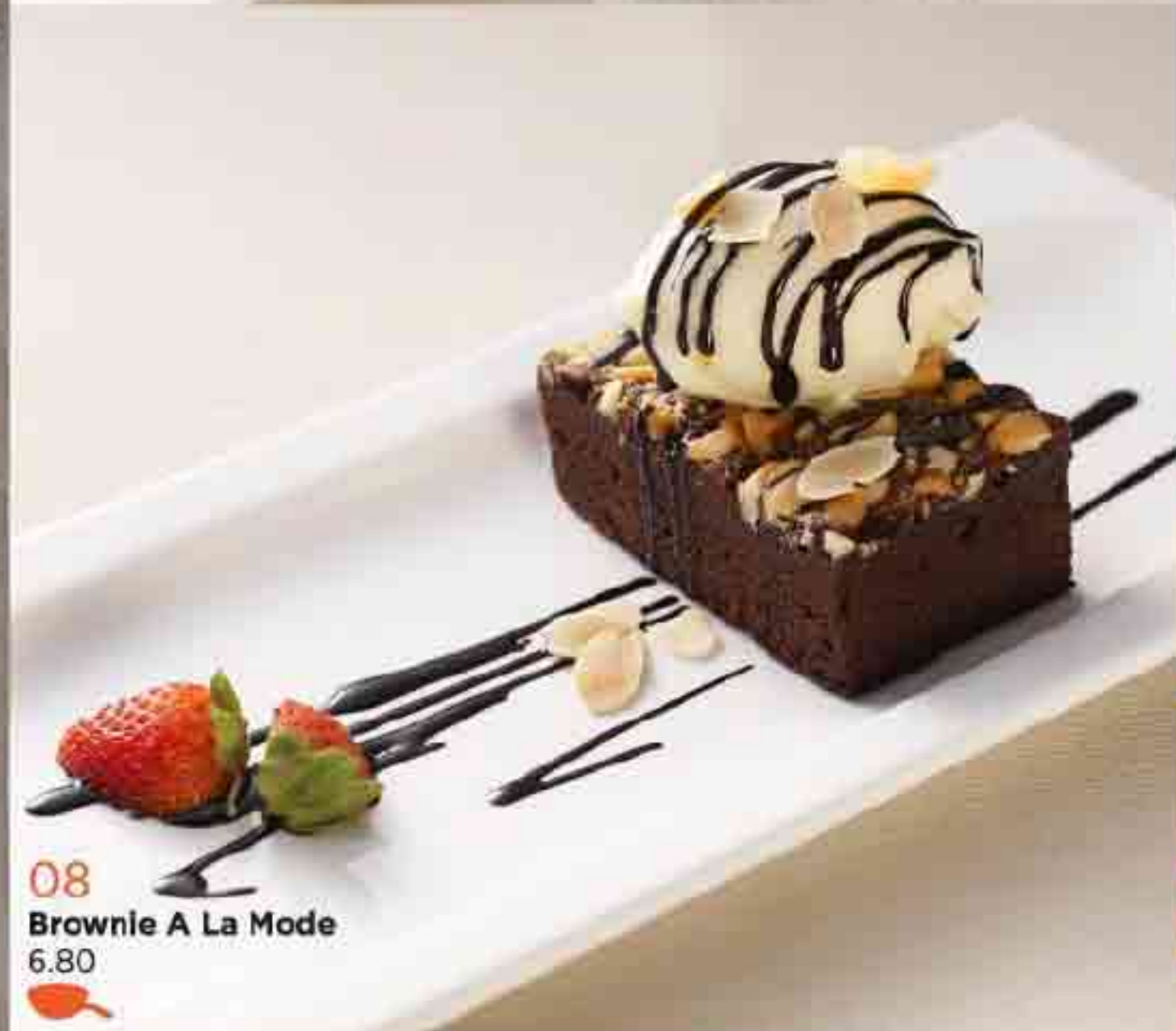
08 Brownie A La Mode 6.80