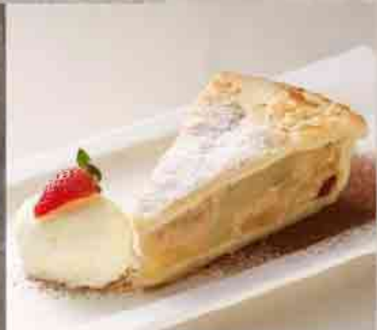
07 Apple Pie A La Mode 6.80