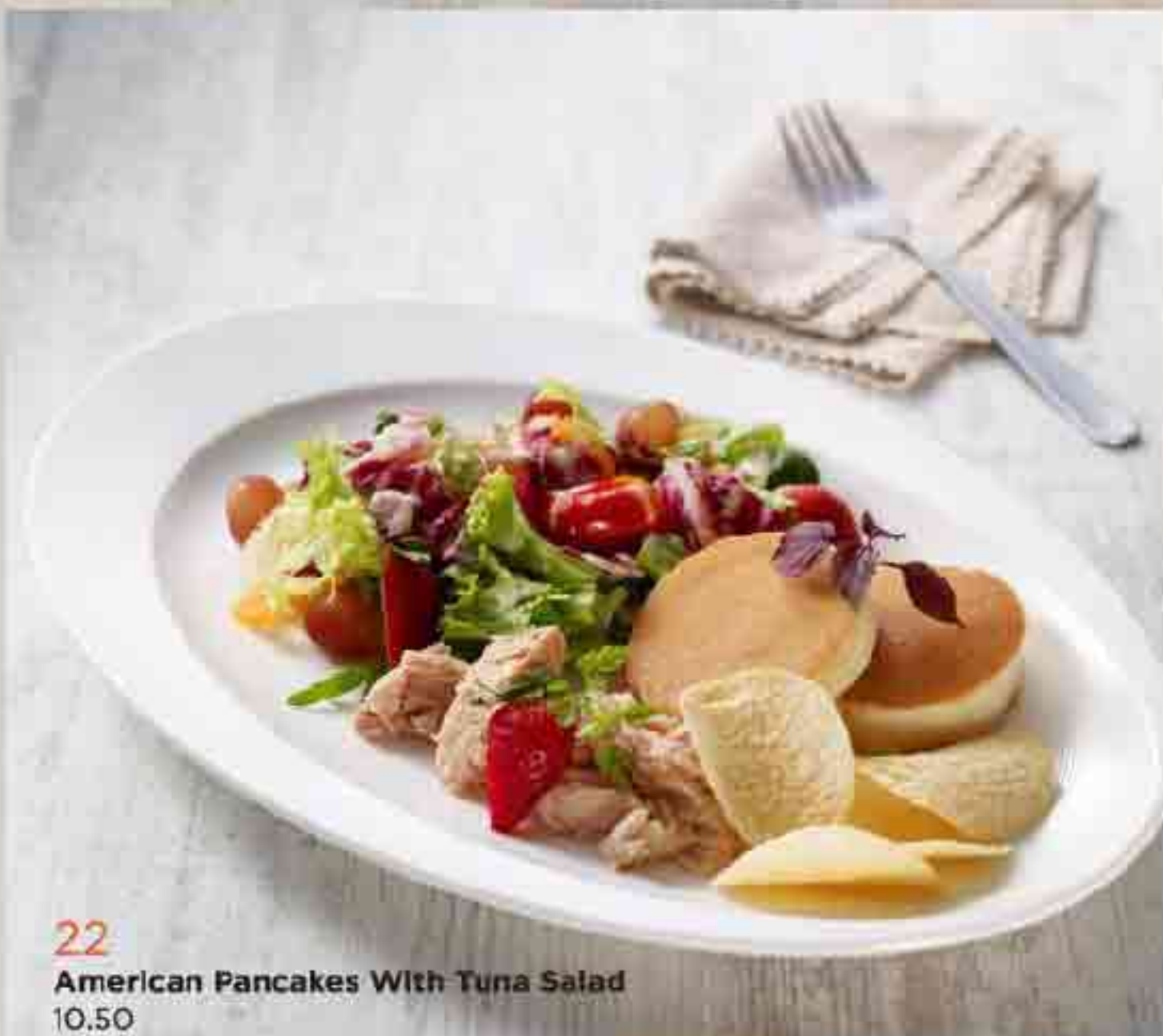
22 American Pancakes With Tuna Salad 10.50