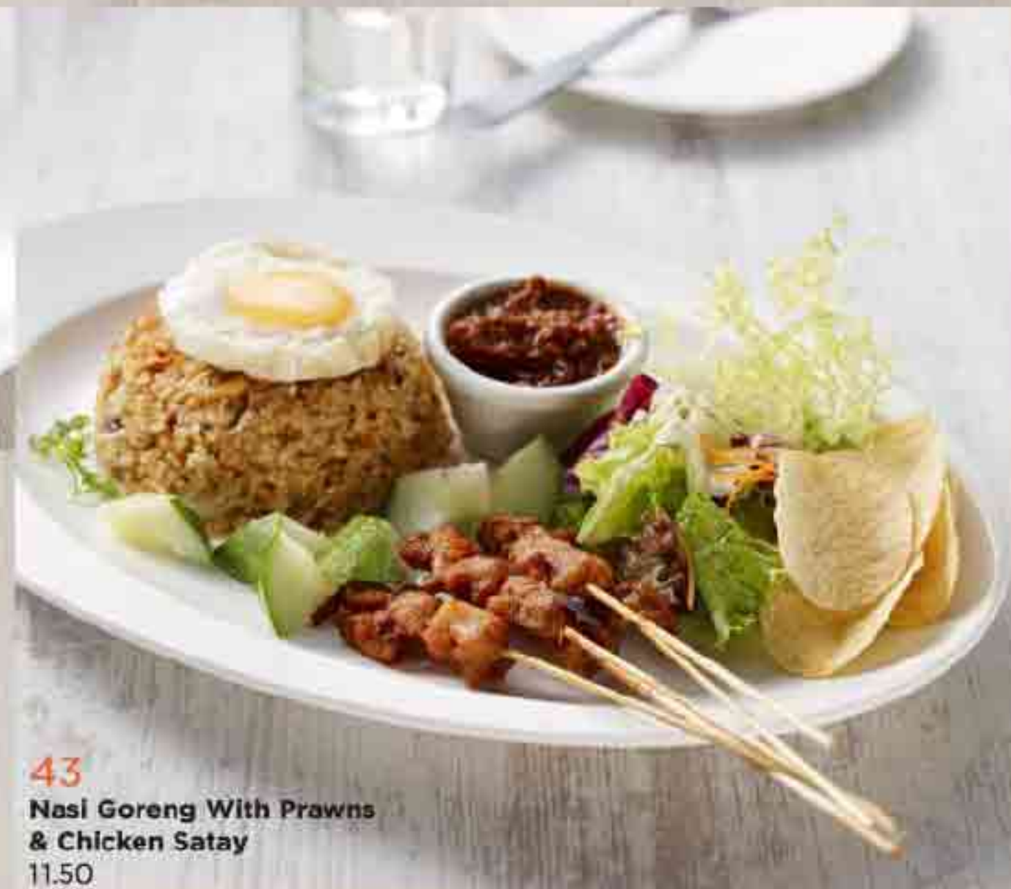
43 Nasi Goreng With Prawns & Chicken Satay 11.50

Vegetable selection may change daily. Dish presentation may vary from what is shown