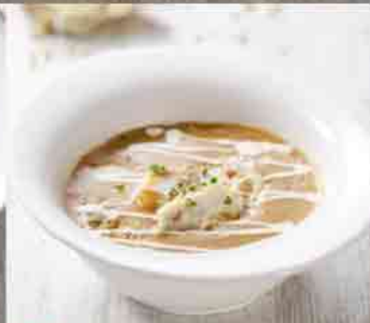
24 Lobster Bisque 6.00