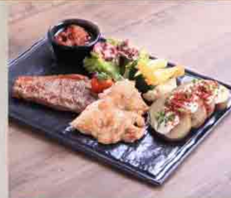
37 Steak & Chicken 21.00

Vegetable selection may change daily. Dish presentation may vary from what is shown