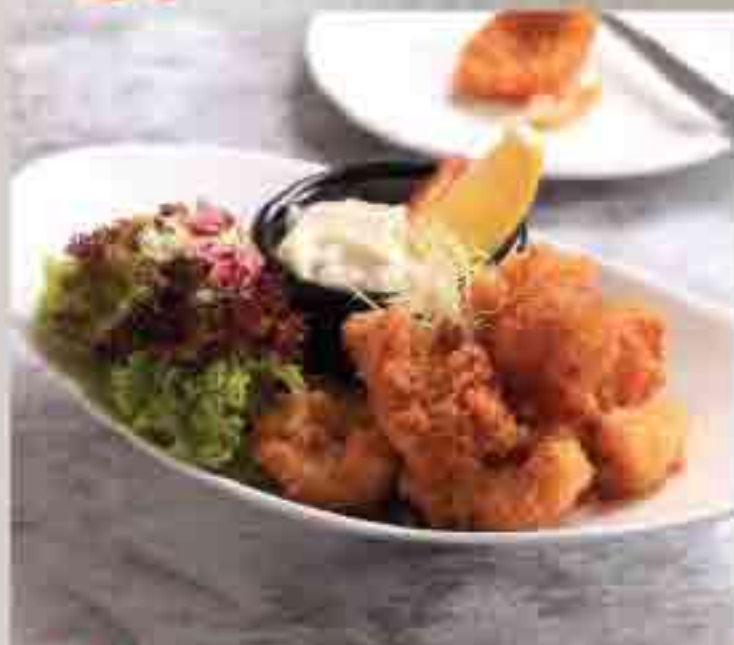
14 Crispy Calamari Bites 8.00