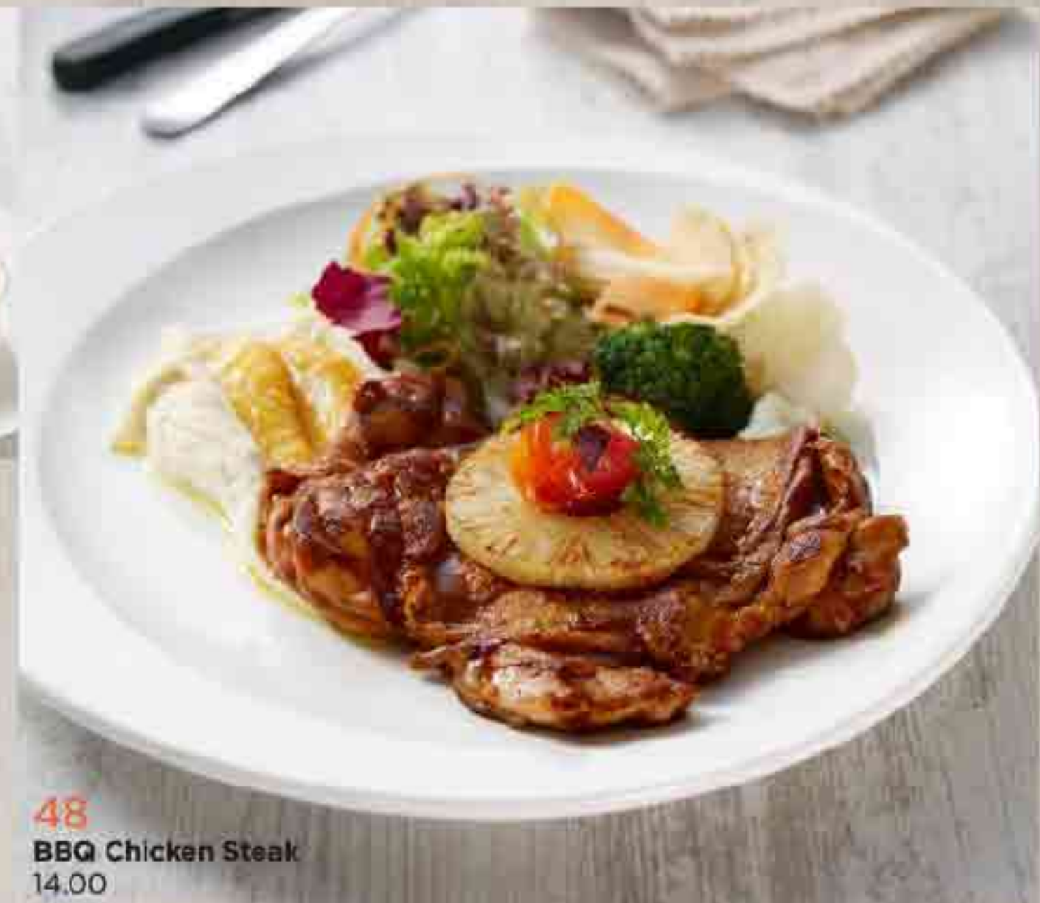
48 BBQ Chicken Steak 14.00