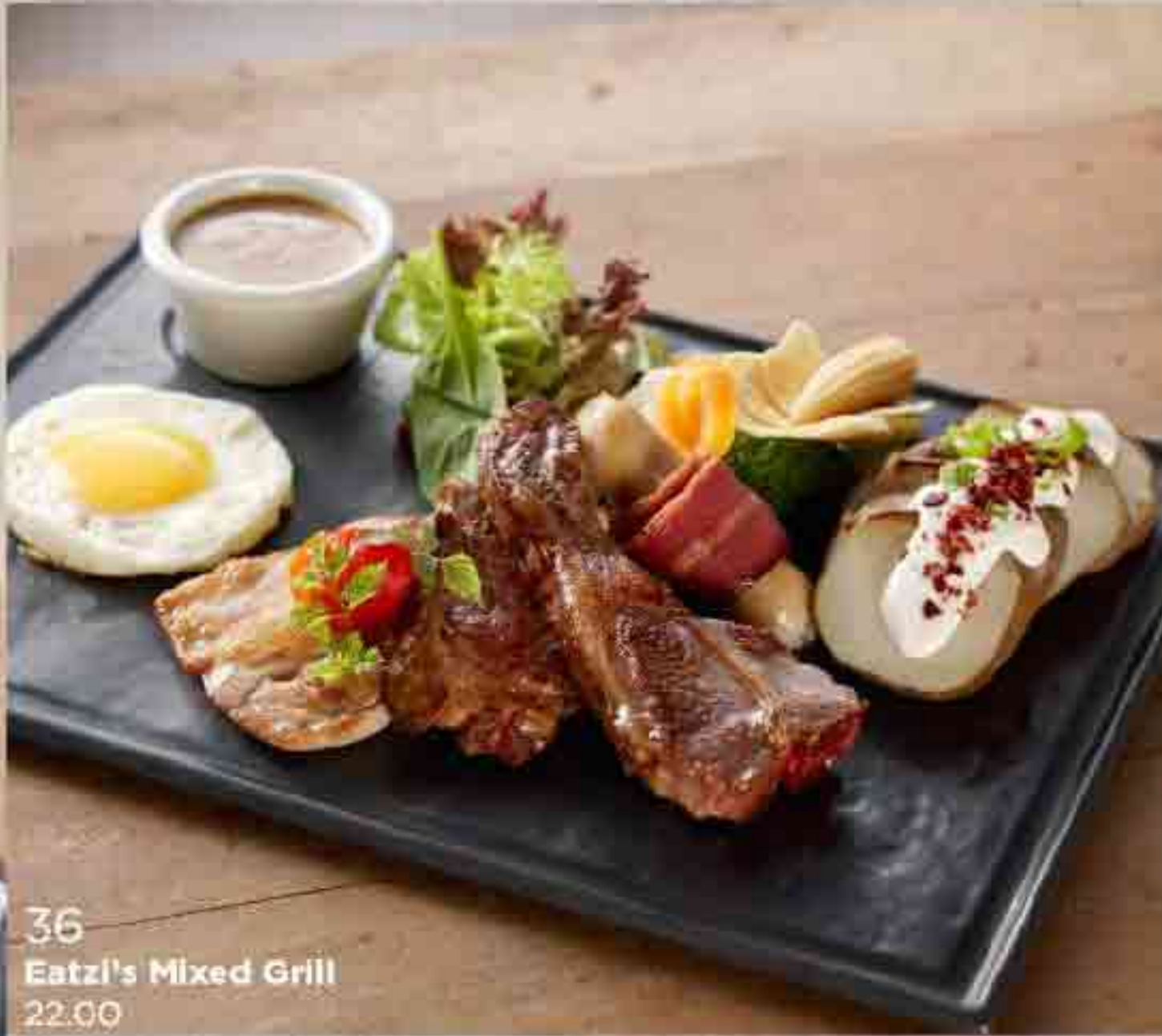
36 Eatzi's Mixed Grill 22.00