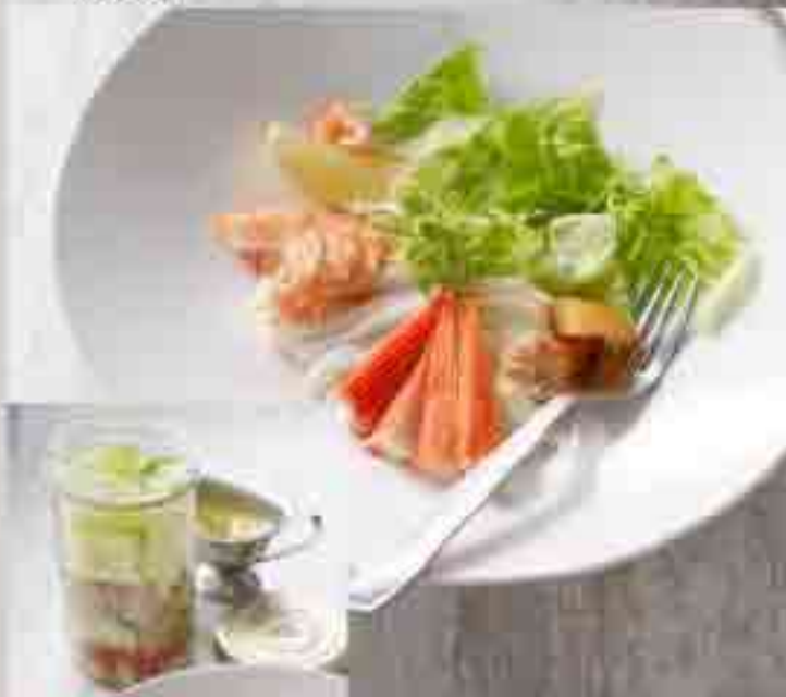
23 Seafood Salad In Jar 12.00