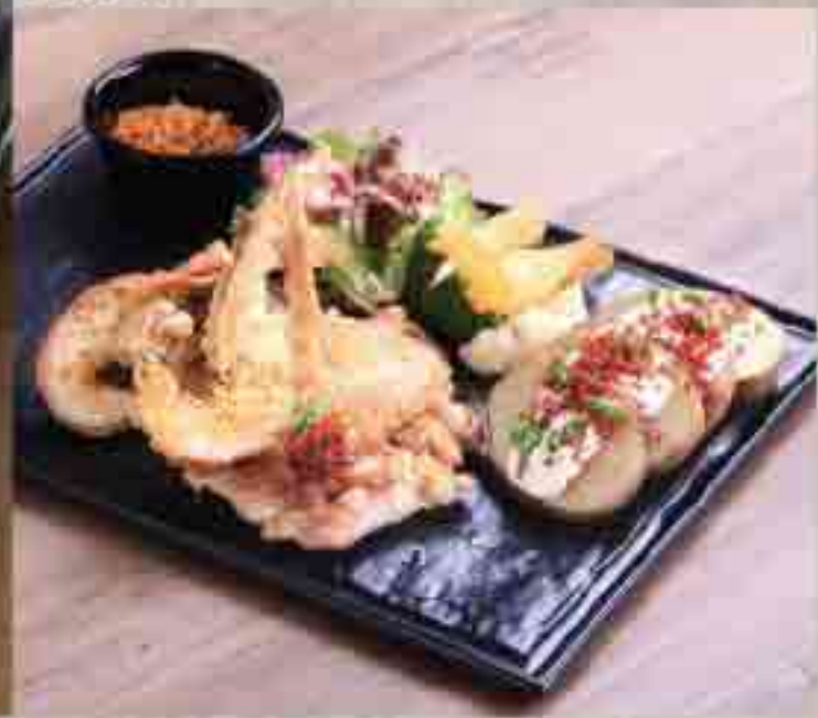
38 Grilled Chicken & Slipper Lobster 21.00