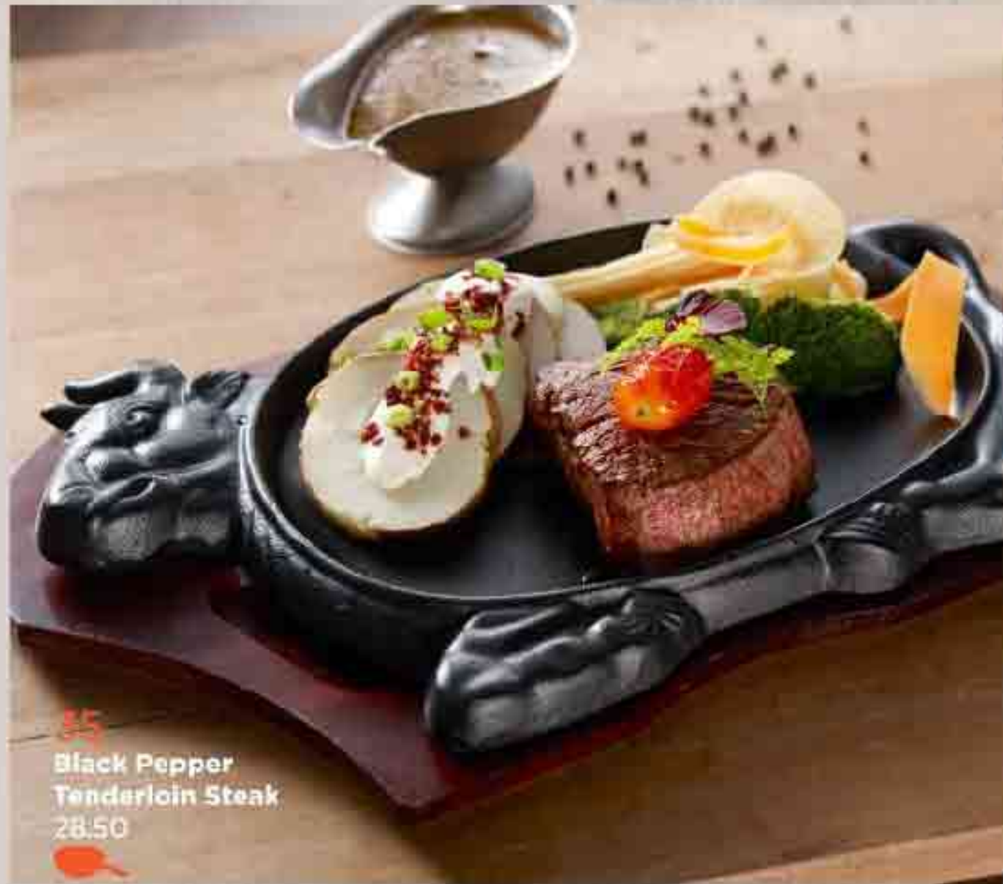
35 Black Pepper Tenderloin Steak 28.50