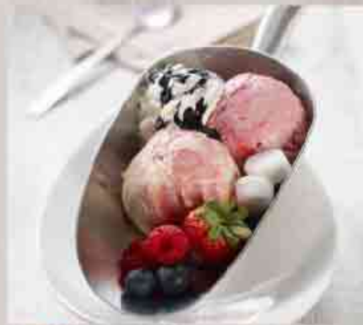
02 Summer Mango & Berries Fruity Ice Cream 10.80