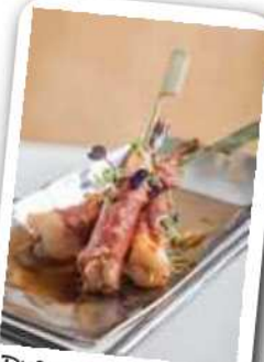
Prawn & Chorizo