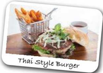
Thai Style Burger