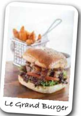
Le Grand Burger

Prices are inclusive of tax and service charge.