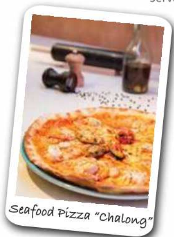
Seafood Pizza "Chalong"