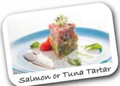
Salmon or Tuna Tartar