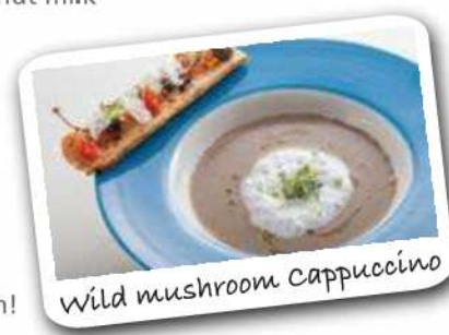
Wild mushroom Cappuccino