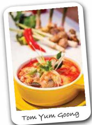
Tom Yum Goong