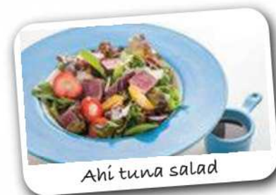
Ahi tuna salad