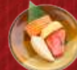
Fruit plate or ice cream