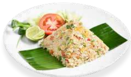
ข้าวผัดไก่ / กุ้ง