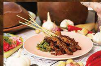
Sate Babi WAHAHA (6 tusuk) 48 Sweet, tender and juicy grilled pork skewers marinated in Balinese spices.