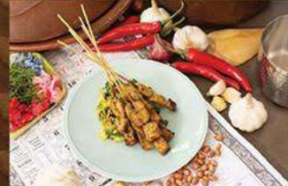
Sate Ayam Bumbu Kacang (6 tusuk) 38 Indonesian style grilled chicken skewers in peanut sauce.