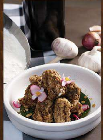
Crispy Ribs 38 Crispy and juicy small ribs pork ribs glazed with sweet and tangy sauce.