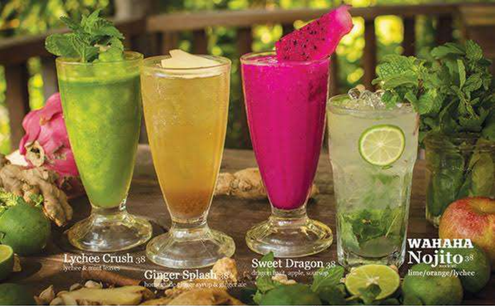
Lychee Crush 38 lychee & mint leaves