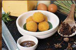
Chicken Croquettes 38 Creamy chicken croquettes, served with brown sugar vinegar dip.