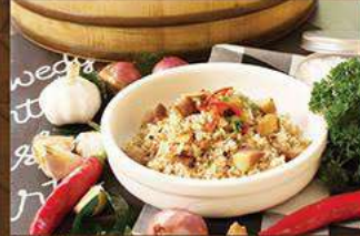
Pork Rice 22 Aromatic fried rice with pork belly.