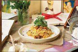
Spaghetti Aglio Olio 50 / with Pork Belly 65 Spaghetti with garlic confit, chilli oil and pan-fried pork belly.