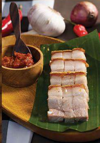
Roast Pork Belly 68 Premium roast pork belly, tender, juicy and crispy skin.