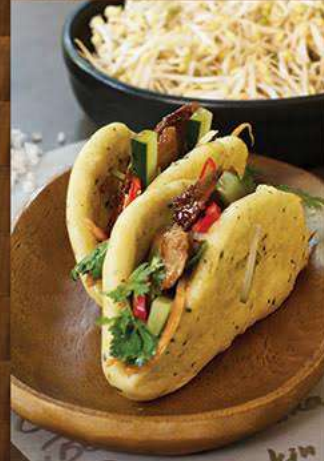
Grilled sweet pork in soya pao 68 Soya Vite pork, carrot, pickle, coriander, radish with sweet sauce.