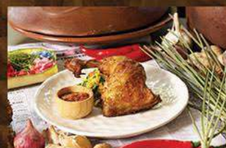
Ayam Goreng/Bakar 38 Sauce-Vide for 6 hours in Balinese spices, deep-fried or grilled to perfection.