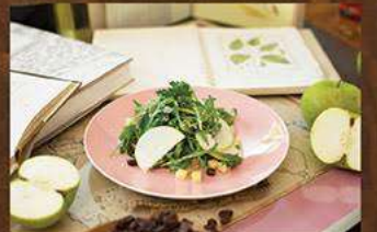
Apple Salad 48 / with Roast Pork Belly 75 Ricotta, Italian parsley, green apple, cheddar, raisins, apple cider dressing.