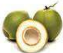
fresh coconut 28