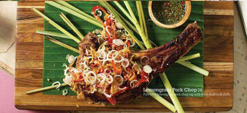
Lemongrass Pork Chop 78 Pan-fried lemongrass pork chop top with fried shallots & chili.