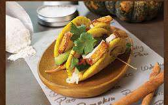
Roast Pork Belly in pumpkin pao 68 Roast pork belly, carrot, pickle, coriander, radish with sweet sauce.