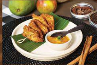
Mini Pork/Chicken Fillet 38 Thin sliced pork/chicken fillet, breaded, deep fried, served with fruit sauce.