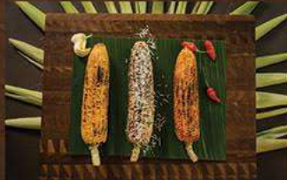
Grilled Corn Butter 20 / Creamy Cheese 30 / Sweet Chilli 25

All prices are in thousand Rupiahs, subject to 10% government tax and 5% service charge.