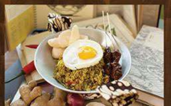
Nasi Goreng WAHAHA (Ayam/Babi) 48 Indonesian style fried rice served with pork, chicken satays, fried egg, and shrimp crackers.

All prices are in thousand Rupiahs, subject to 10% government tax and 5% service charge.