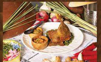
Bebek Goreng 88 Sauce-Vide for 6 hours in Balinese spices served with Balinese vegetables.