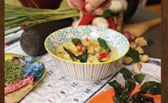
Kare Bongkot 48 / with Pork 68 Balinese style curry, tofu, tempeh, curry leaves.