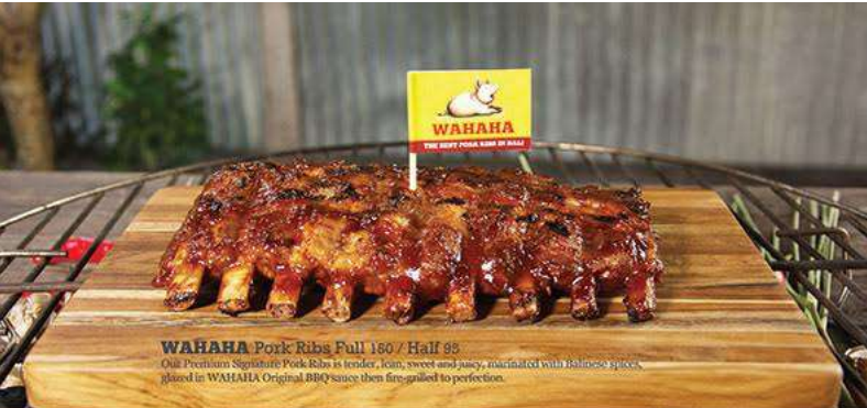
WAHAHA Pork Ribs Full 180 / Half 98 Our Premium Signature Pork Ribs is tender, lean, sweet and juicy, marinated with Balinese spices, glazed in WAHAHA Original BBQ sauce then fire-grilled to perfection.