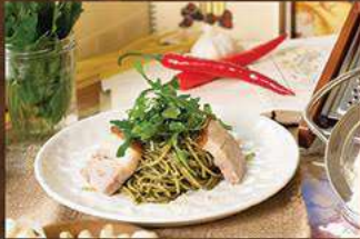
Spaghetti in Pesto Sauce 85 / with Pork Belly 75 Spaghetti with fresh basil leaves, peanuts, cheddar and roast pork belly.