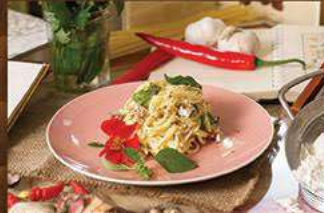
Balinese Carbonara 65 Spaghetti with coconut milk, spicy pepper, pan-fried pork belly.