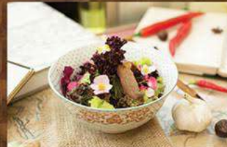
Grilled Sweet Pork Salad 48 Fresh mixed salad, mint leaves, glass noodle, sweet-sour dressing.