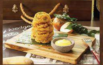
Onion Rings 38 Thin hand-cut onions, breaded, deep fried served with Balinese Mayo.