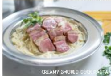
CREAMY SMOKED DUCK PASTA