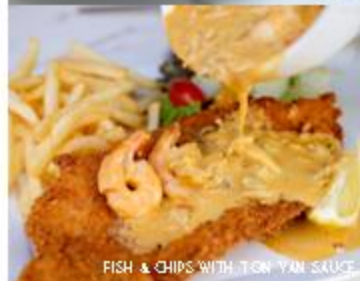
FISH & CHIPS WITH TOM YAM SAUCE