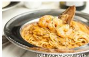
TOM YAM SEAFOOD PASTA