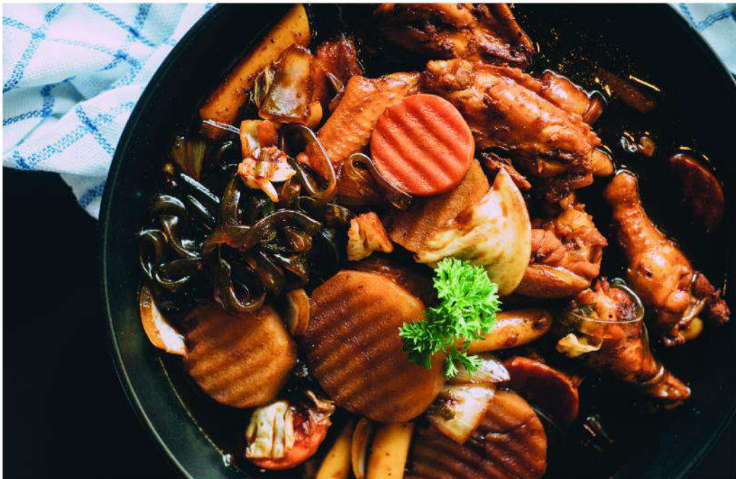
BLACK JJIMDAK 블랙짬닭 ( Price 420 : for 2-3 persons) choose : normal/ spicy/ extra spicy

The Slow-Braised Chicken with Vegetables in our spicy sauce, where spiciness is from red chili peppers. ไก่ตุ๋นในซอสเผ็ดสูตรพิเศษของทางร้าน