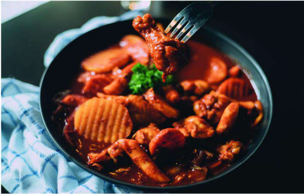
RED JJIMDAK 레드짬닭 ( Price 420 : for 2-3 persons) choose : normal/ spicy/ extra spicy

The Slow-Braised Chicken with Vegetables in our spicy sauce, where spiciness is from red chili peppers. ไก่ตุ๋นในซอสเผ็ดสูตรพิเศษของทางร้าน