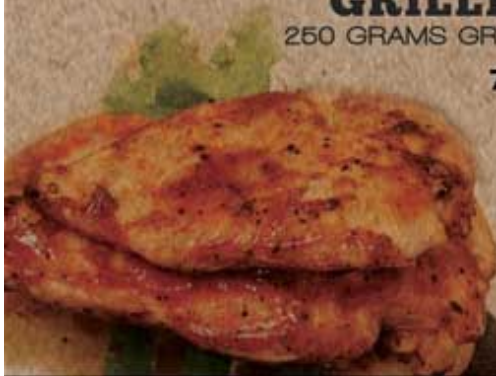
STONE GRILLED CHICKEN