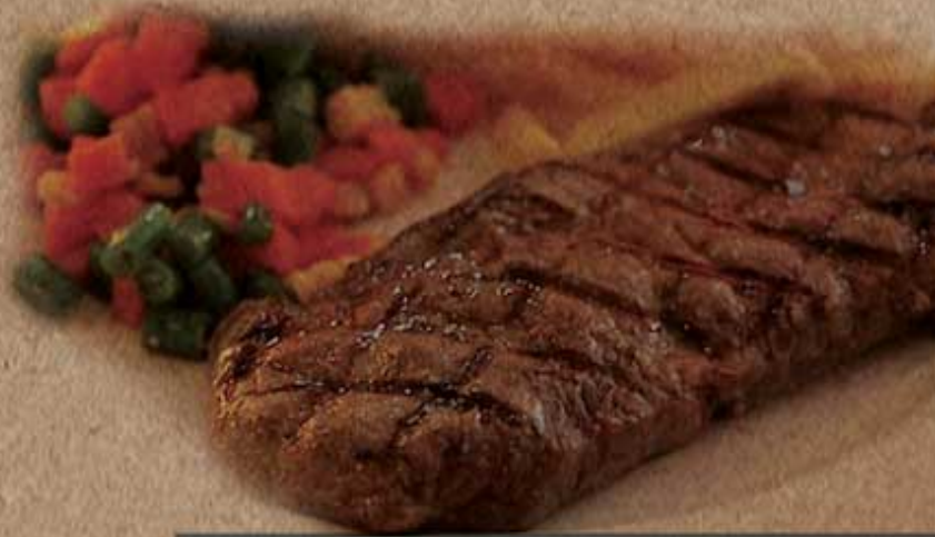
Abbey Road Steak