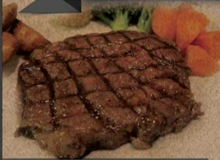
Hollywood Walk Steak