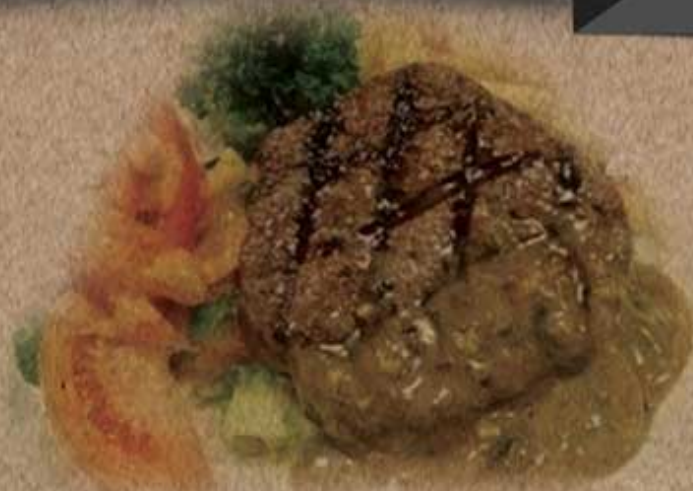
Shibuya Street Steak