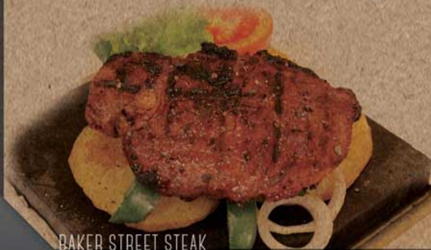
BAKER STREET STEAK

SELECTION OF SAUCES (BBQ / MUSHROOM / BLACK PEPPER)