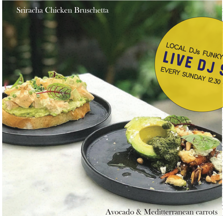
Avocado & Mediterranean carrots

LOCAL DJ's FUNKY TUNES LIVE DJ SET EVERY SUNDAY 12.30 - 16.30