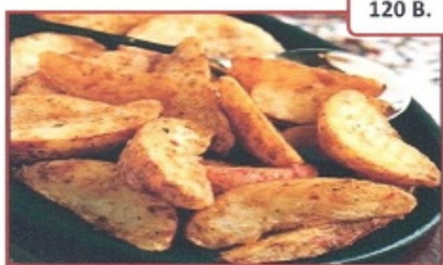
Potato wedge / French fries

Keep calm and drink wine, prices are Net