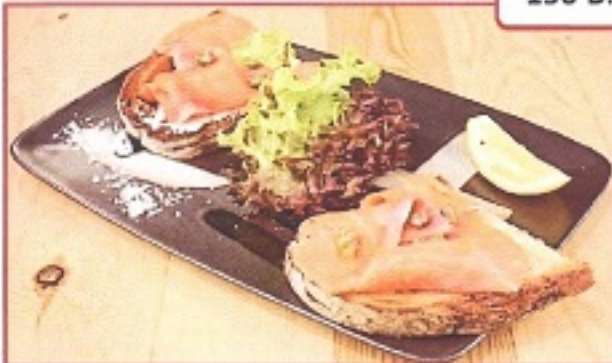
Alaska Tartines 2 bread slices with cream cheese and smoke salmon, lime & capers