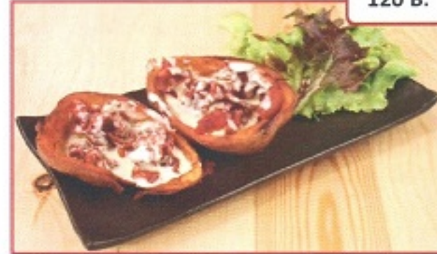
Potato Blue Cheese Baked potato with bacon and blue cheese sauce