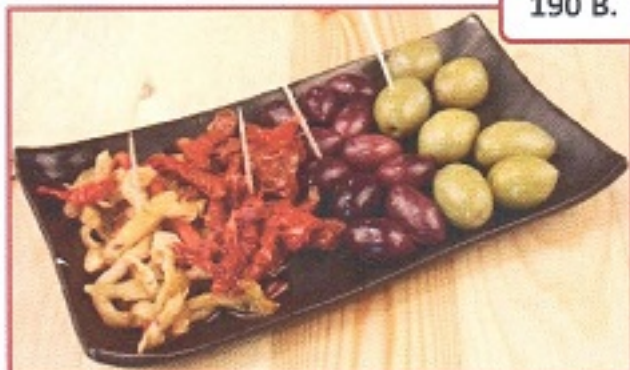
Kalamata Olives & Sundried Tomato Black and green greek olives with sundried tomato, green peppers