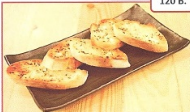
Garlic Bread Slices french baguette with butter and garlic