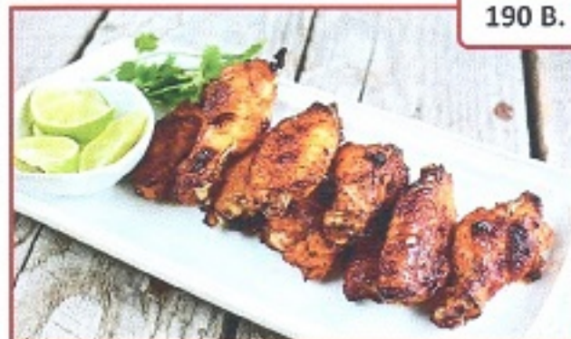
8 Chicken wings Served with BBQ, Tamarin sauces