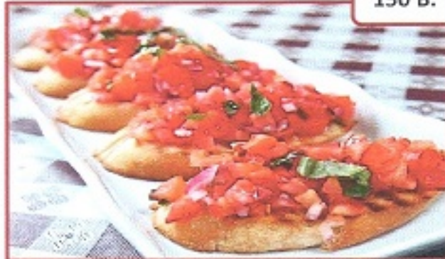
Bruschetta Depot 5 mini baguette bread with chopped tomato, olive oil