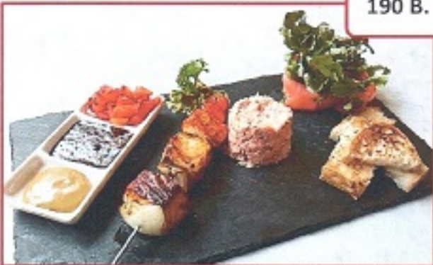
Trio Salmon Salmon terrine, salmon BBQ and smoke salmon salad