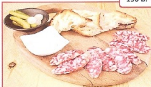
"Saucisson platter" French dry sausage with bread gerkins & pearl onions