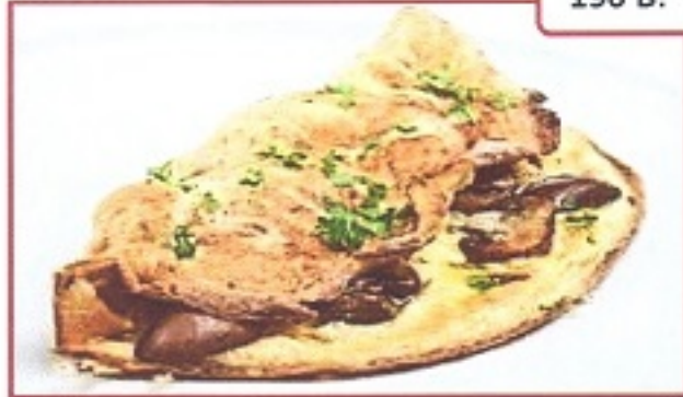
Omelette with Ceps Mushrooms