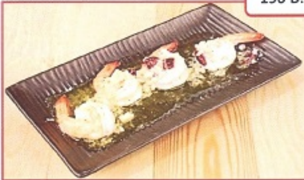
Sauteed Prawns in Garlic & wine Fresh prawns cooking in white wine sauce, garlic & chilli