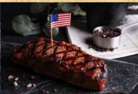
400-gram New York Strip (USDA Choice)