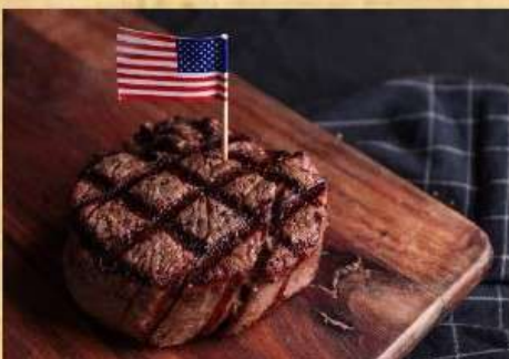
240-gram filet (USDA Prime)