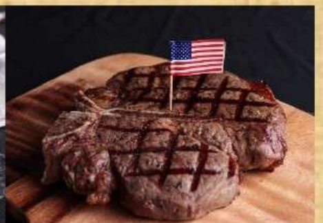
600-gram T-bone (USDA Prime)