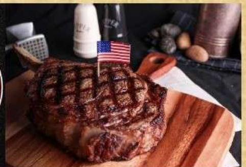
1,000-gram tomahawk (USDA Prime)