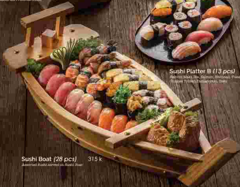
Sushi Boat (28 pcs) 315 k Assorted Sushi served in Special Boat