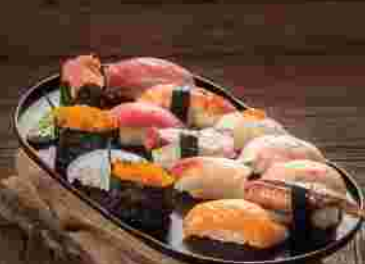
Special Nigiri Sushi (13 pcs) 188 k Assorted Premium Sushi