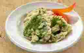
Obha Tempura (3 pcs) 8 k Deep Fried Obha Leaves