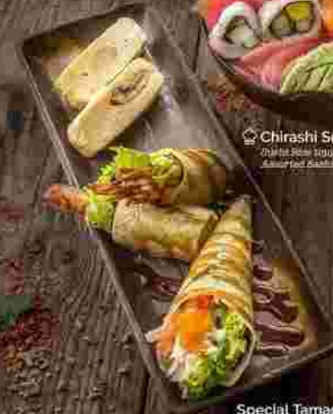
Special Tamago 55 k Fried Tamago, Ebi Fried Tamago, Unagi Tamago, Kani Tamago