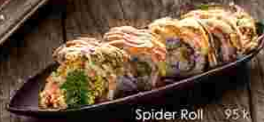
Spider Roll 95 k Fried Soft Shell Crab, Prawn, Cucumber, Mito