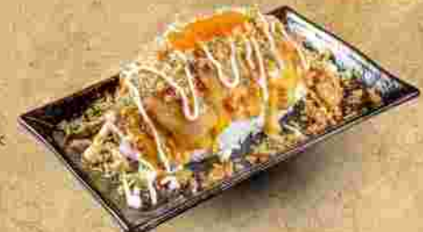
Volcano Sushi with Cheese 75 k Salmon, Shrimp, Salmon with Cheese on Top