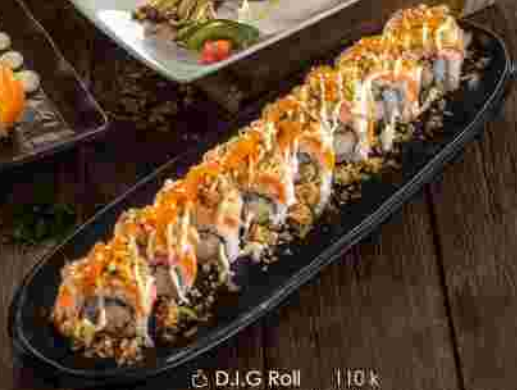
D.J.G Roll 110 k Crab, Shrimp, Mackerel, Salmon, Crispy Potato, Tuna