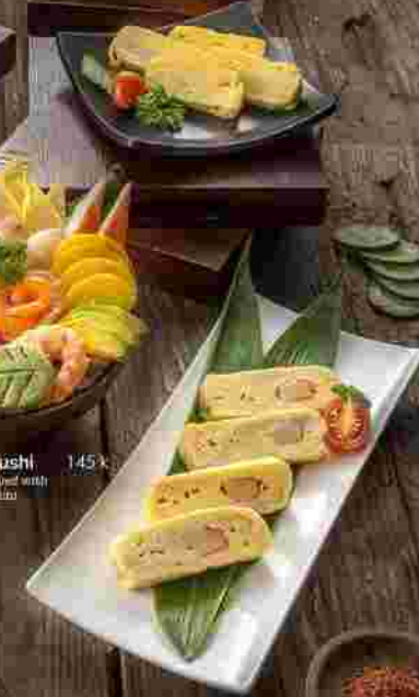
Kani Tamago 35 k Tamagoyaki with Kani Sashimi