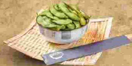
Edamame 25 k Boiled Soybean