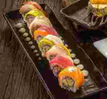
Rainbow Roll 100 k Crab, Shrimp, Mackerel, Salmon, Mackerel, Tuna, Eel, Tuna