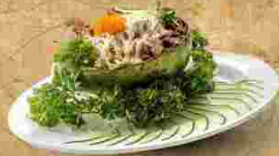
Salmon Avocado Salad 40 k Salmon and Avocado with Mignonette