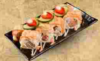
Salmon Cheese Roll 88 k Salmon, Avocado Roll with Mornay Cheese on Top