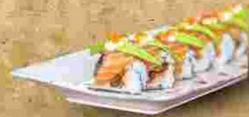
Salmon Avocado with Unagi 128 k Grilled Unagi, Cucumber, Crab Stick, Salmon, Avocado, Tobiko

👤 favourite: 🍴 chef recommendation 🌶️ spicy