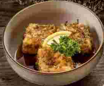
Tossa Tofu 28 k Deep Fried Tofu wrapped with bonito shavings and sauce