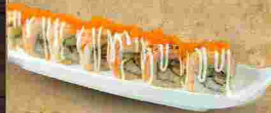
Tom & Jerry Roll 100 k Grilled Tuna, Crispy Potato, Salmon, Cheese, Tuna