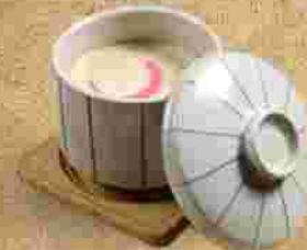
Chawan Mushi 25 k Steamed Egg Custard Soup