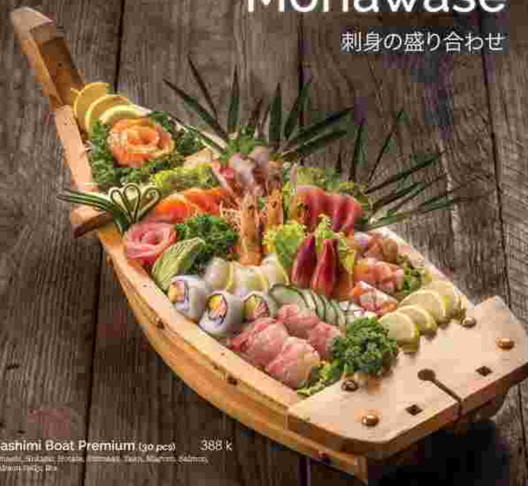
Sashimi Boat Premium (30 pcs) 388 k Amaebi, Hokigai, Hotate, Shimaaji, Tako, Maguro, Salmon, Salmon Belly, Ika