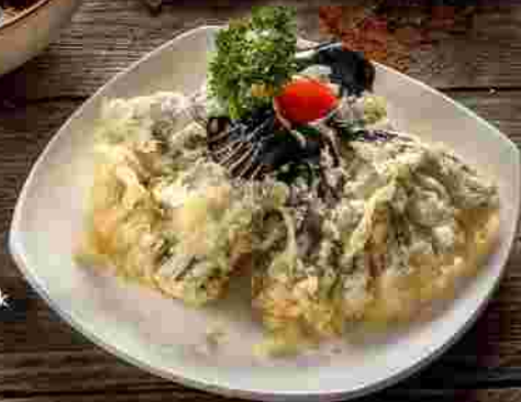
Nasu Tempura 20 k Deep Fried Eggplant