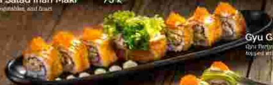
Tuna Salad Inari Maki 75 k Tuna, vegetables, and inari