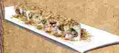
Two Three Quarters 125 k Salmon Belly, Asahi with Miso Sauce