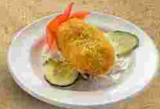
Korokke 25 k Potato Croquette