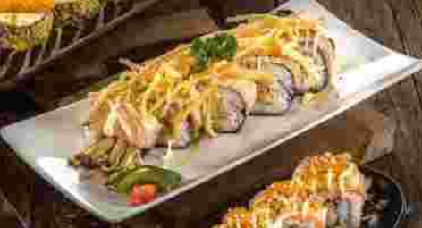
Sasuki Maki 78 k Shrimp, Salmon, and Mackerel