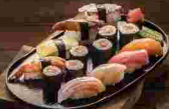
Sushi Platter A (14 pcs) 165 k Salmon Maki, Tuna, Firmago, Nabuto, Sea Bream, Ebi, Tamagoyaki, Onigiri