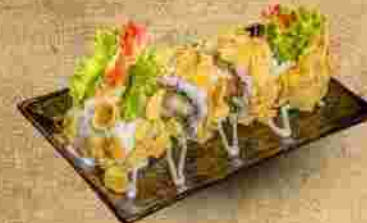
Crunchy Roll 65 k Shrimp, Tuna, Salmon, Crispy Potato, Crispy Potato, Tuna