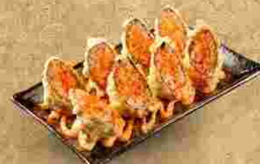
Spicy Salmon Fried 60 k Fried Crispy Salmon topped with Spicy Mayo