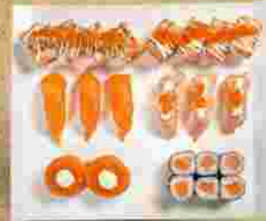
Salmon Lover 198 k Assort of Salmon, Kani