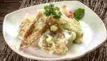
Unagi Tempura 48 k Deep Fried Eel