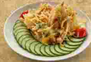
Kakiage Tempura (2 pcs) 12 k Deep Fried Squid and Octopus