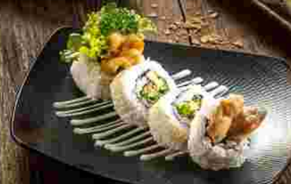
Chicken Teriyaki Roll 48 k Chicken Teriyaki, Sesame, Dashi, and Sesame