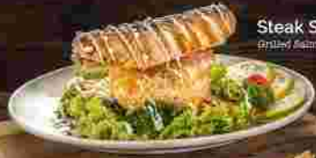
Steak Salmon Sushi 105 k Grilled Salmon with Beefsteak