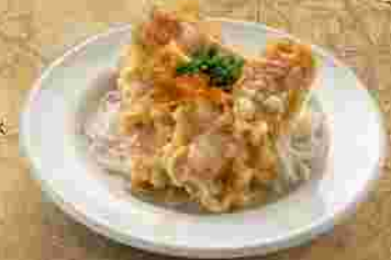
Kani Tempura (3 pcs) 25 k Deep Fried Crab Meat