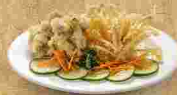
Mushroom Fritto 35 k Deep Fried Mushrooms and Shampi Mushrooms