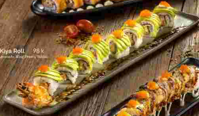
Kiya Roll 98 k Avocado, King Prawn, Tofu