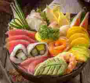
Chirashi Sushi 145 k Chirashi Sashimi topped with Assorted Sashimi