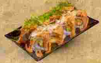
Salmon Spicy Cheese 88 k Spicy Salmon with Mornay Cheese