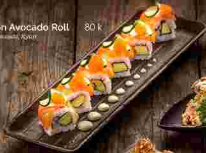
Salmon Avocado Roll 80 k Salmon, Avocado, Kani