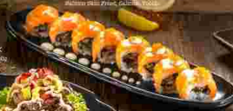
Uramaki 98 k Salmon, Shrimp, Avocado, Cream Cheese, and Sesame