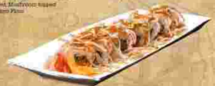
Wagyu Roll 135 k Thinly Sliced Wagyu Beef topped with Caviar Sauce