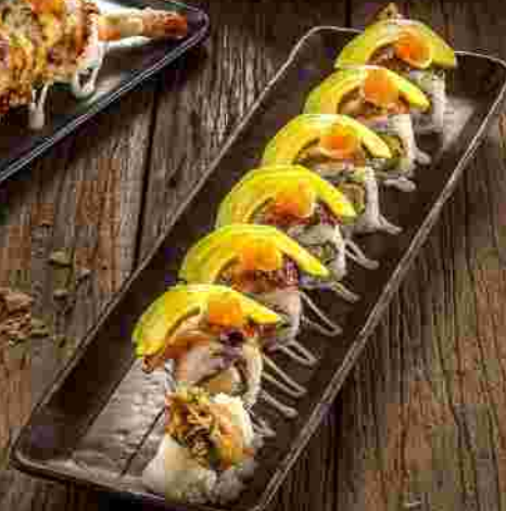
King Prawn Roll 128 k Onion, King Prawn, Tofu, and Avocado