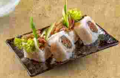
Beef Teriyaki Roll 55 k Beef Teriyaki, Salmon, Crispy Potato