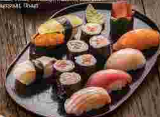
Sushi Platter B (13 pcs) 160 k Salmon Maki, Tuna, Salmon, Shrimp, Tuna, Onigiri, Ebi, Tamagoyaki, Onigiri