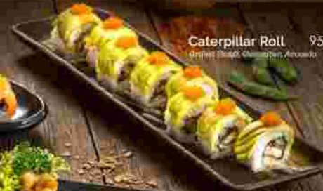
Caterpillar Roll 95 k Onion, Shrimp, Churimori, Avocado