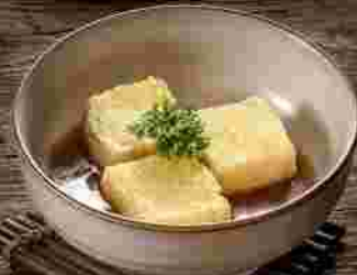
Agedashi Tofu 25 k Deep Fried Tofu served with Tempura sauce and Bonito Shave on top