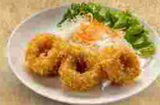
Calamari (3 pcs) 30 k Deep Fried Squid Rings