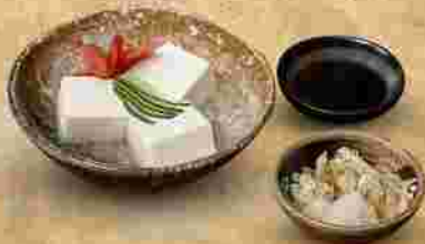
Hiyayako 30 k Cold Hotpot with Protein Sauce