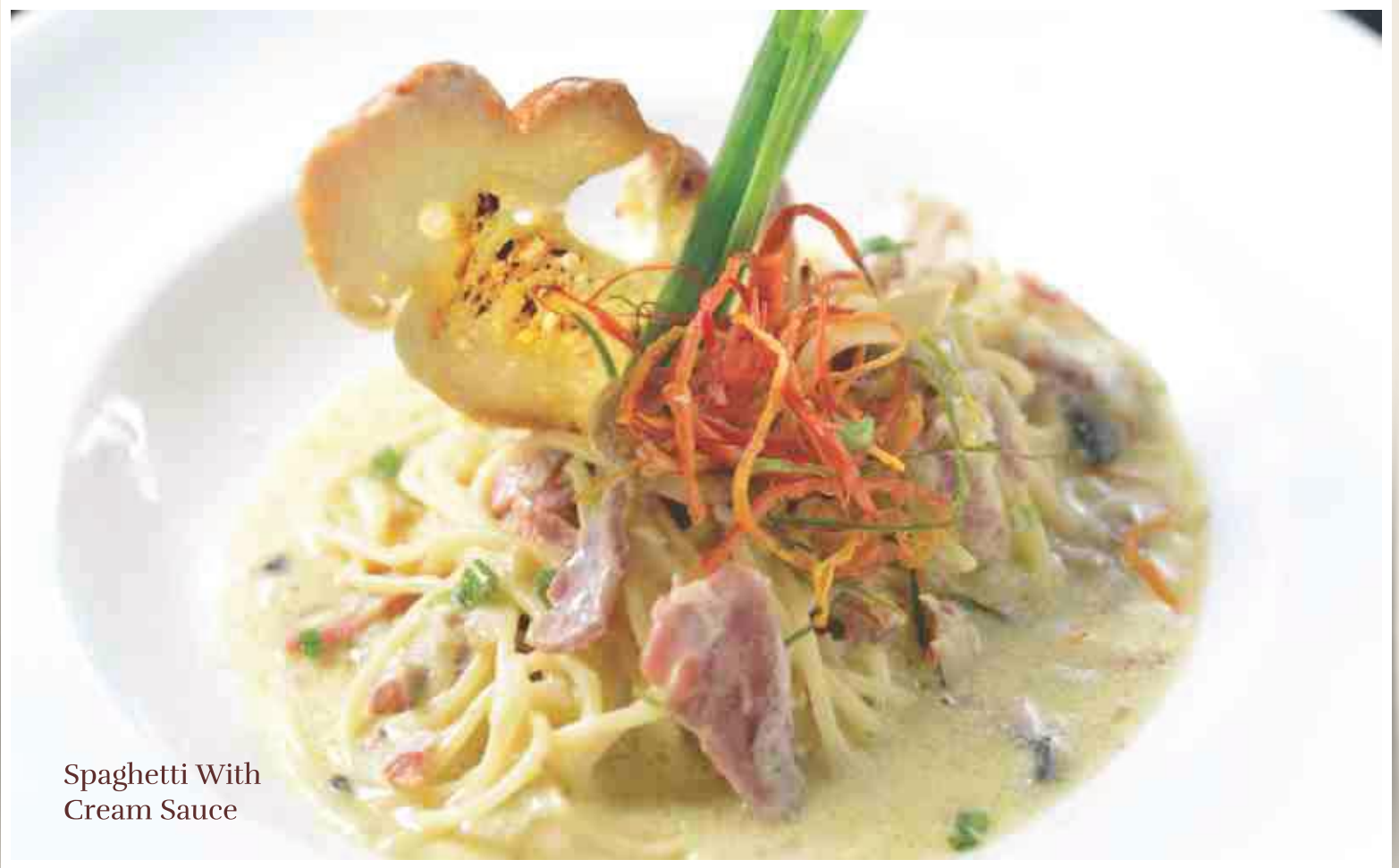
Spaghetti With Cream Sauce