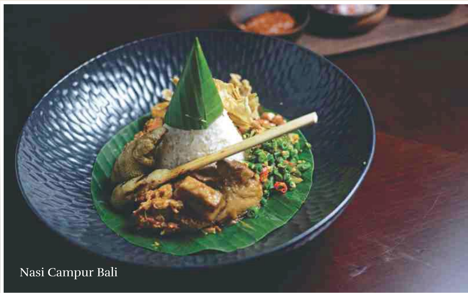
Nasi Campur Bali