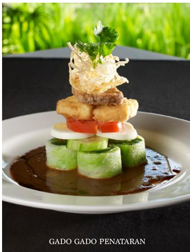
GADO GADO PENATARAN

Vegetarian fried rice with vegetable, crispy bean cake, proteina sate, fried tofu with red spicy and bean crackers.