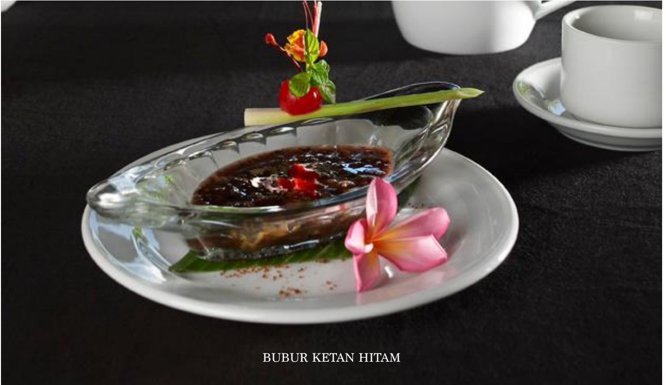
BUBUR KETAN HITAM