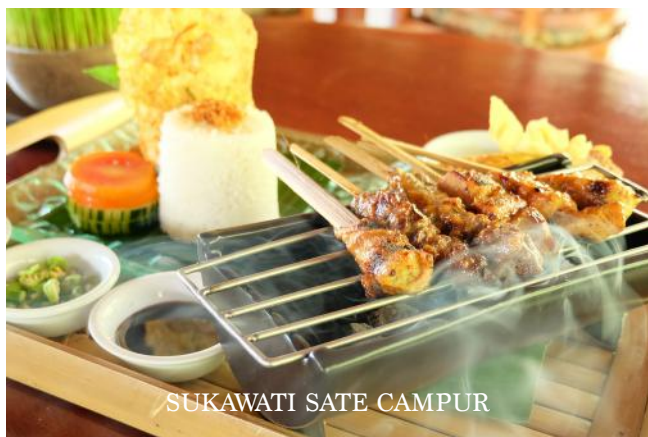
SUKAWATI SATE CAMPUR