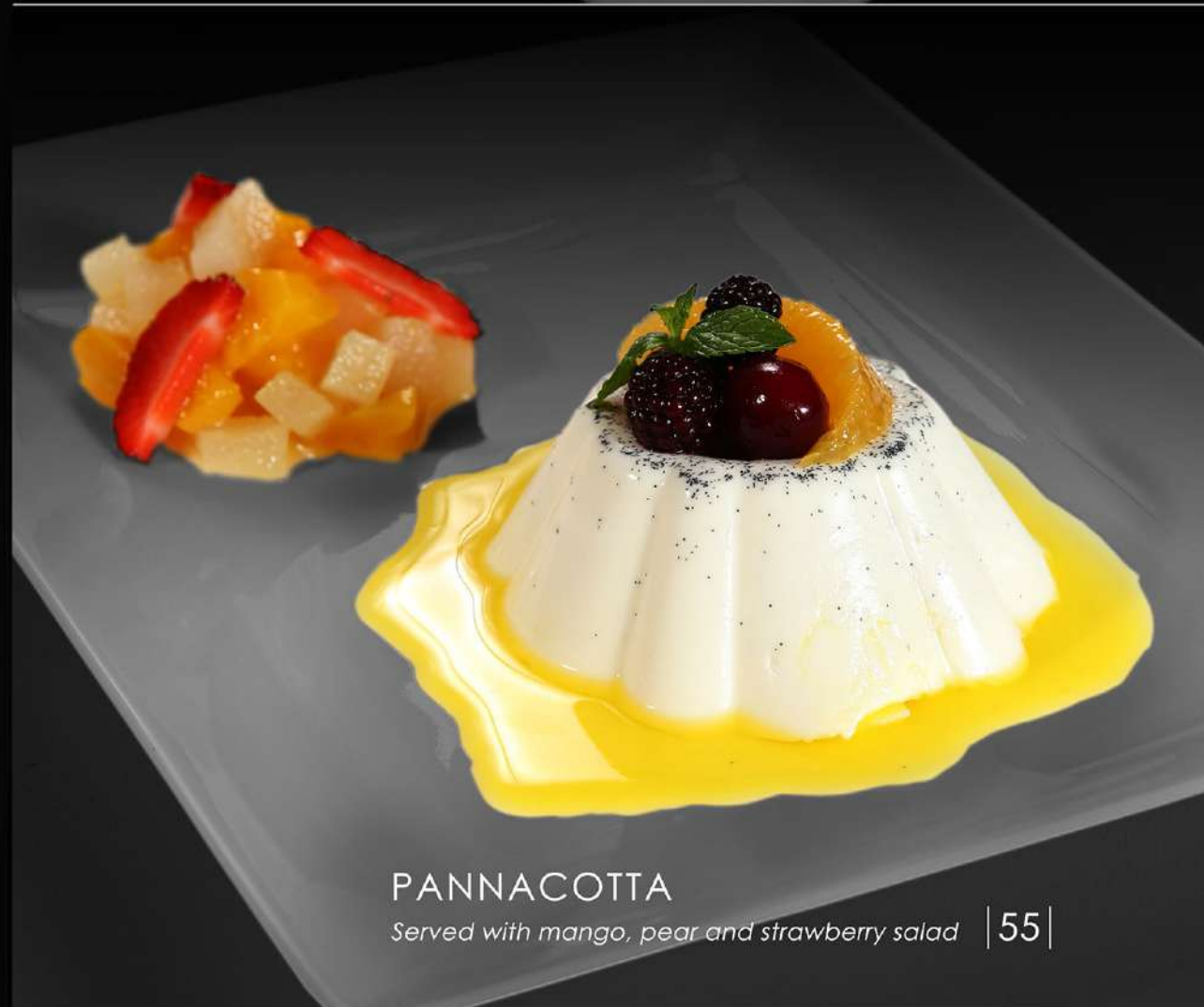
PANNACOTTA Served with mango, pear and strawberry salad | 55 |

All prices are quoted in thousand Indonesian rupiah and are subject to 15,5% government tax and service charge