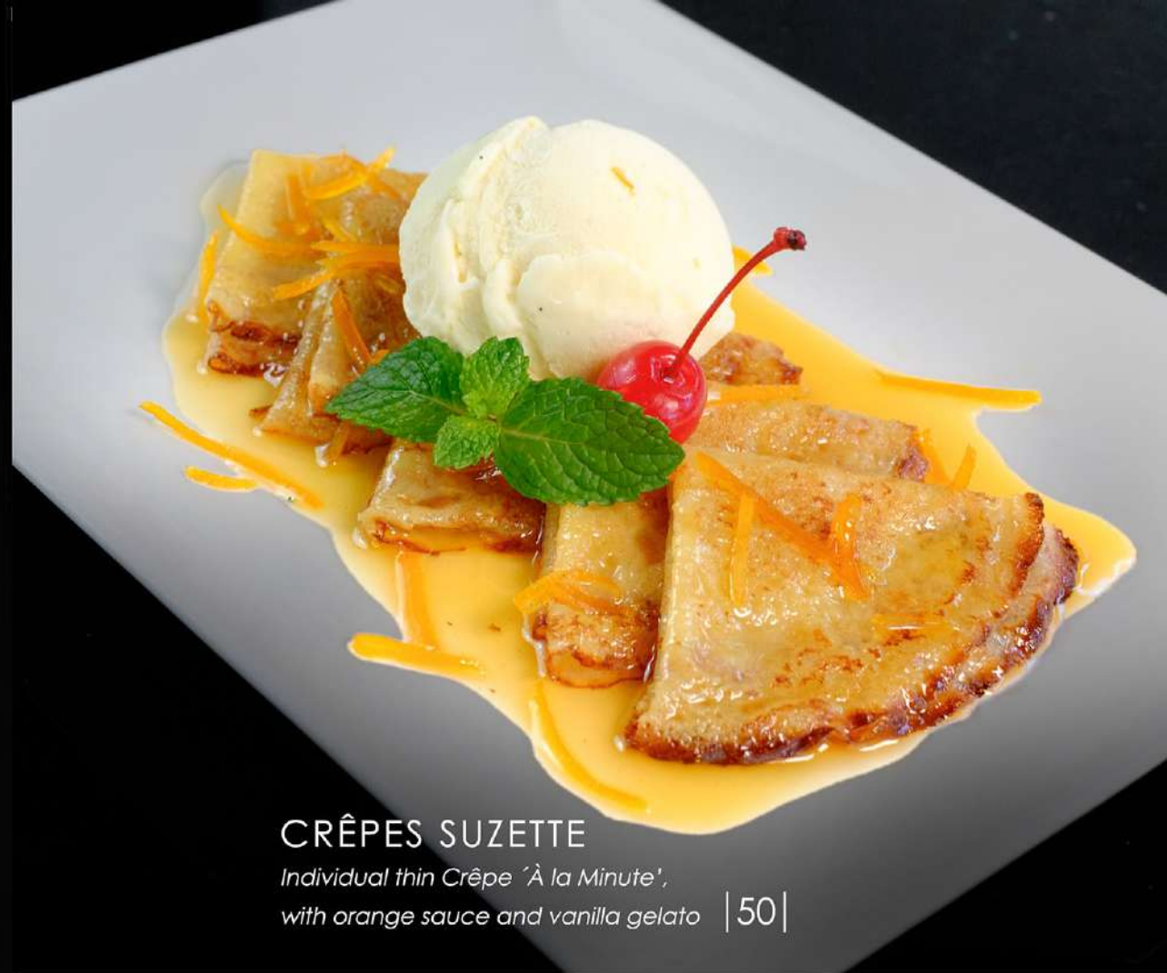
CRÊPES SUZETTE Individual thin Crêpe 'À la Minute', with orange sauce and vanilla gelato | 50 |