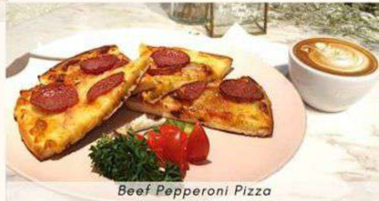
Beef Pepperoni Pizza