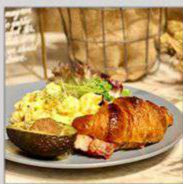
Lazy Brunch 15.8