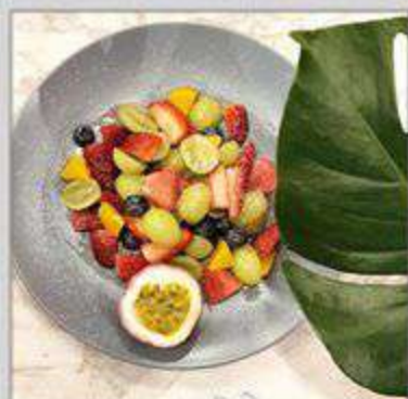
Mixed Fruits Salad 13.8