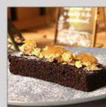
Hot Brownie 9.8