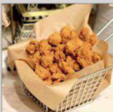
Popcorn Chicken 8.8