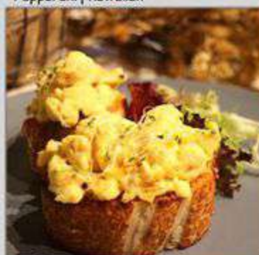
Egg Toast 9.8