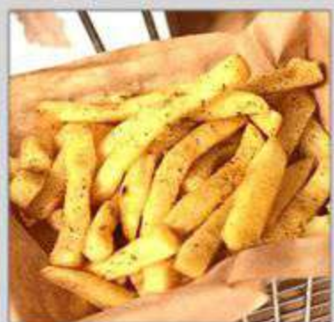
Seaweed | Wasabi | Chili 8.8