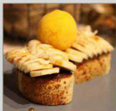
Banana Toast 9.8