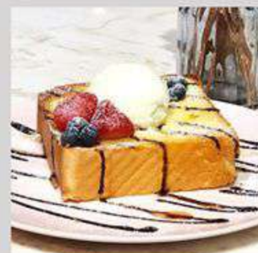
Golden Honey Toast 9.8 with ice-cream