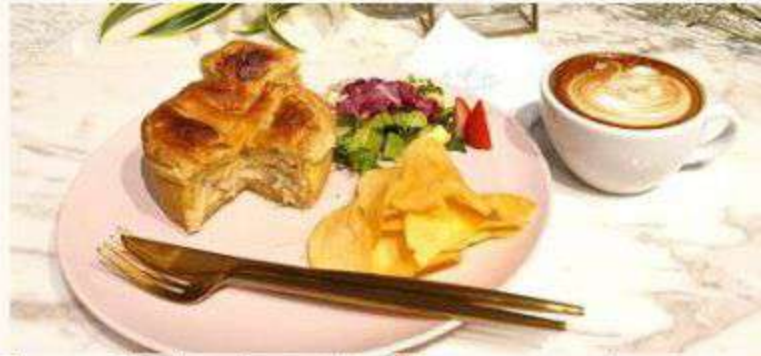
Chicken Pie with add-on potato chips