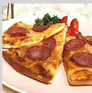
Pizza (half of 9.5") 9.8 Pepperoni | Hawaiian