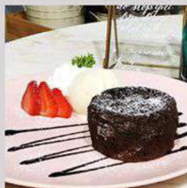
Lava Cake 10.8 with ice-cream