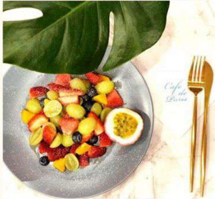
Mixed Fruits Salad