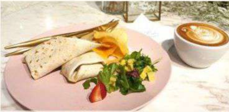
Wrap with add-on potato chips