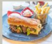
Steak Sandwich 350

Grilled ham & cheese sandwich with vegetables 烤火腿和奶酪三明治配蔬菜