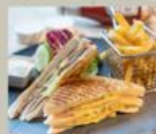
Ham & Cheese Sandwich 250

Ham, egg, roast beef, chicken and tomato 三层三明治—火腿, 鸡蛋, 熟牛肉, 鸡肉和番茄