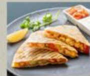
Chicken Quesadilla 260

With spicy Thai herb dipping sauce 香炸鸡翅配香辣泰式蘸料