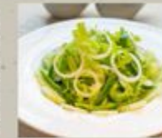
Green Salad 190

Tuna, boiled egg, kalamata olives, French beans, cucumber, boiled potato, cherry tomatoes and red onion 尼斯沙拉一金枪鱼、煮鸡蛋、卡拉玛塔橄榄、四季豆、黄瓜、熟土豆、小番茄和红酒洋葱配油和红酒