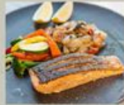
Herb Crusted Baked Salmon Fillet 420

Baked potato with cheese and sautéed mixed vegetables served with pepper or mushroom sauce 烤里脊肉配芝士焗土豆和黄油炒时蔬搭配黑胡椒汁或蘑菇汁