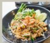
Kao Pad 220 Seafood 250

Thai fried rice with choice of chicken, pork, beef or seafood and vegetables 泰式炒饭—有鸡肉/猪肉/牛肉或者蔬菜可供选择