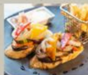
Grilled Vegetable Sandwich 220

(Served with French fries and coleslaw) (所有三明治都配有薯条和凉拌卷心菜)