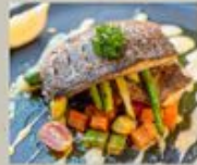
Grilled Sea Bass 380

Tomato and basil salsa, virgin olive oil and balsamic vinegar 香烤三文鱼片一配有番茄、罗勒叶调味汁、橄榄油和香醋