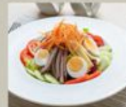
Chef's Salad 300