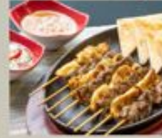
Beef and Chicken Mixed Satay (6 pcs) 225

Deep-fried breaded chicken breast and chipotle mayonnaise 酥炸鸡柳 鸡胸肉和墨西哥辣椒蛋黄酱