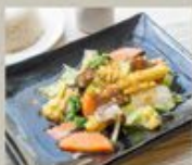
Stir-fried Vegetables 180

Stir-fried chicken with cashew nuts and chilies 泰式腰果辣炒鸡肉配白米饭