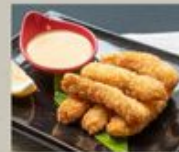
Chicken Fingers (6 pcs) 195

Deep-fried breaded chicken breast and chipotle mayonnaise 酥炸鸡柳 鸡胸肉和墨西哥辣椒蛋黄酱