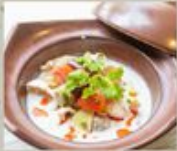
Tom Kha Gai 220

Thick red curry with choice of chicken, pork or beef with kaffir lime leaves 泰式香浓红咖喱—鸡肉/猪肉/牛肉可供选择, 并配有卡菲尔酸橙和白米饭