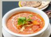
Paneer Butter Masala 250

A delicious savory rice dish that's loaded with spicy marinated chicken 印度辣味鸡肉香饭