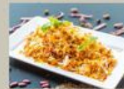
Basmati Chicken Biryani 300

Whole black lentils and red kidney beans soaked overnight, cooked in a clay oven with tomato butter and cream 奶香余豆一土灶烹饪黑扁豆、红芸豆配辅料番茄、黄油和奶油