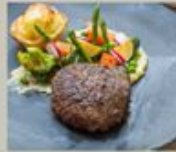
Grilled Tenderloin 650

Baked potato with cheese and sautéed mixed vegetables served with pepper or mushroom sauce 烤里脊肉配芝士焗土豆和黄油炒时蔬搭配黑胡椒汁或蘑菇汁