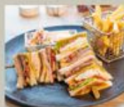
Triple Decker Club Sandwich 280

Grilled Mediterranean vegetables with balsamic dressing on an open faced ciabatta 烤蔬菜三明治—烤蔬菜配香油淋汁在意式面包表面