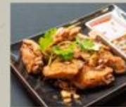
Deep-fried Chicken Wings (7 pcs) 220

Served on a hot sizzling platter with peanut sauce 混合沙爹(牛肉和鸡肉) 用热铁盘盛并配花生酱