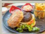
Plain and Simple "Half Pounder" 310

A "half pounder, two cheeses and crispy bacon" 双倍芝士培根汉堡—半磅汉堡, 两份芝士和香脆培根