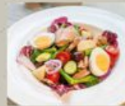
Nicoise Salad 250

Baby romaine tossed with fresh Caesar dressing, quail eggs and anchovies topped with shaved parmesan and crisp croutons served with your choice of char-grilled chicken breast or shrimps 恺撒沙拉一长叶莴苣配新鲜凯撒酱汁、鹌鹑蛋和小鱼、帕尔马干酪脆片和脆面包丁，并配有鸡胸肉或虾