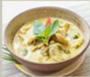
Kiew Wan Gai 210

Green curry with chicken and vegetables 泰式绿咖喱鸡肉配白米饭