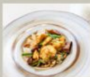
Gai Pad Med Mamuang 265

Choice of stir-fried chicken, pork or beef with hot basil leaves 泰式炒鸡肉, 猪肉或牛肉配热蒂罗勒叶和米饭