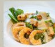
Caesar Salad Chicken 250 Prawn 295

Seabreeze's creation comes with ham, turkey, chicken, roast beef, hard boiled eggs, tomatoes, cucumbers and cheese all placed upon a bed of tossed lettuce or other leaf vegetables 经典美式沙拉火腿、火鸡肉、鸡肉、烤牛肉，配有煮鸡蛋、番茄、黄瓜和芝士，并配有生菜或其他叶类蔬菜