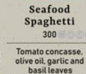
Seafood Spaghetti 300

Beef ragu layered and baked with pasta sheets and cheese, served with warm garlic bread 意式牛肉酱千层面配芝士和蒜蓉面包