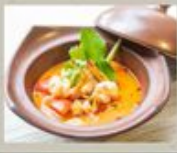
Tom Yam Goong 260

Chicken in coconut cream with Thai herbs 椰奶鸡肉汤配泰式香料