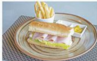
CHARMTHAI SANDWICH BRIE, HAM, TOMATO AND PEAR Toasted French bread with ham, tomato and brie serve with French fries and sauce 魅力三明治 - 法式面包搭配火腿、西红柿和干酪，并配有薯条及酱汁