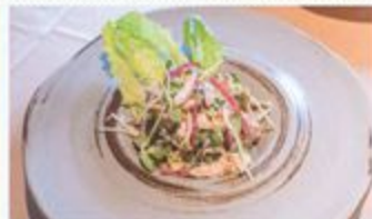
350 INDONESIAN STYLE CHICKEN SALAD 245 Tossed shredded chicken breast with fresh herbs and ginger dressing serve on romaine lettuce 印尼鸡肉沙拉 - 用新鲜的蔬菜叶和姜汁与鸡胸肉凉拌，搭配在生菜上。