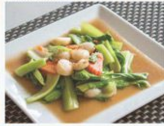
180 PAD PAK CHOI Stir-fried pak choy with scallops 扇贝小炒