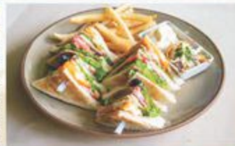
350 CLUB SANDWICH 310 Toasted white bread, sliced chicken, beef, egg, ham, tomato and lettuce serve with French fries 三奶油俱乐部 - 吐司面包、切片鸡肉、烤牛肉、火腿、火腿、芝士片、鸡蛋、西红柿、搭配薯条