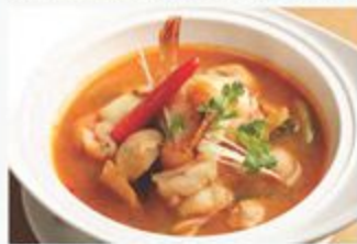
TOM YUM GOONG Classic Thai spicy and sour soup with shrimp served clear or with chili paste 经典泰式虾汤(冬阴功)·有清汤或香辣汤可供选择