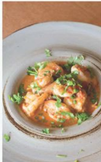
MARIO BATALI'S SPICY SAUTEED SHRIMP White sauteed shrimp with red curry paste, sambol and light coconut milk