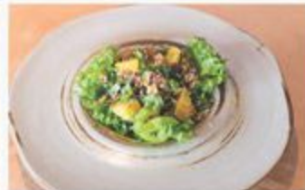
275 RAINBOW OF PAPAYA AND PINEAPPLE SALAD Tossed mix of fresh herbs and ginger dressing served on romaine lettuce 木瓜菠萝七彩沙拉 - 凉拌新鲜蔬菜和姜汁搭配生菜