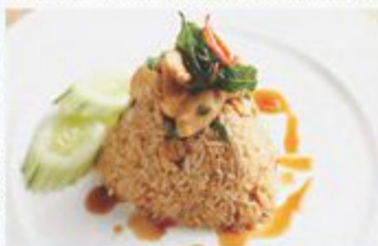
230 KAO PHAD KAPROW Fried rice with basil and chillies with choice of chicken or pork 香辣鸡肉或猪肉炒饭配罗勒叶和辣椒