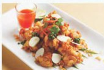
265 MOO/GAJ TOD KRATIEAM Deep-fried pork or chicken with garlic and pepper 酥炸猪肉或鸡肉配大蒜和胡椒