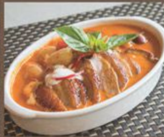
350 MASSAMAN PET YANG Grill duck breast with Massaman curry 香煎鸭胸配马沙文咖喱