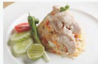
250 KAO PHAD Fried rice with your choice of chicken or pork 鸡肉/猪肉炒饭