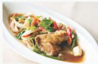
PAD PLA KEUN CHAI Stir-fried fish with Chinese celery 西芹炒鱿鱼