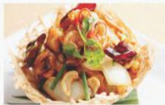
630 GAI PHAD MED MAMUANG Stir-fried chicken with cashew nut and chillies 香辣腰果炒鸡肉