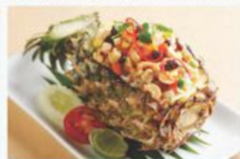
220 KAO PHAD SAPPAROT Pineapple fried rice with chicken and shredded chicken 菠萝炒饭配鸡肉和鸡肉松