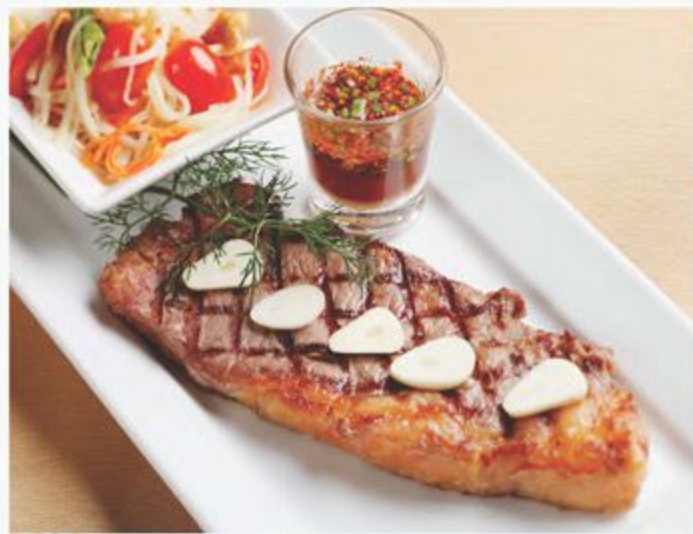
STEAK E SAN NZ sirloin grilled with spicy chilli sauce and papaya salad 煎烤新西兰莎朗牛排配辣酱和青木瓜沙拉