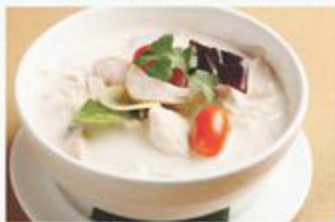
260 TOM KHA GAI Coconut soup with chicken, ginger and lemongrass 椰汁鸡汤配姜片和柠檬草