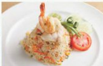
KAO PHAD SEAFOOD Fried rice with seafood 海鲜炒饭