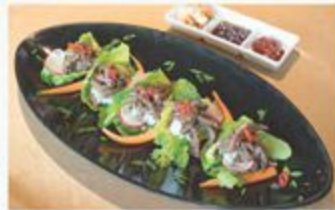
350 KOREAN GRILLED BEEF LETTUCE WRAP Grilled caramelized marinated rib-eye served on lettuce leaves with sushi rice and fresh herbs 韩式牛肉生菜卷 - 生菜和米饭包裹烤焦糖蒜力牛肉