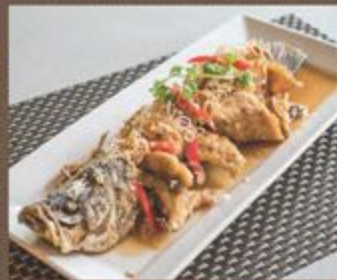
380 PLA JIAN Fried whole snapper with lemongrass, ginger and tamarind sauce 油炸鲷鱼配柠檬草、姜片和酸角酱