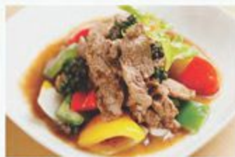
630 NUEA PHAD PRIK THAI NZ beef fillet stir-fried with 3-colour bell pepper 爆炒新西兰牛柳配三种颜色灯笼椒