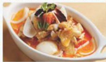
320 MASSAMAN GAI Mild and rich massaman curry with chicken 马沙文咖喱鸡肉