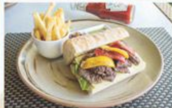
250 STEAK SANDWICH Grilled thin sliced rib-eye steak with mozzarella cheese and tomatoes 牛排三明治 - 香煎薄切牛排切片 - 配马苏里拉奶酪、番茄和熟鸡蛋