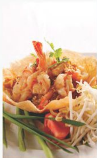
PHAD THAI Stir-fried rice noodles with shrimp and bean sprouts 泰式炒米粉配虾和豆芽菜