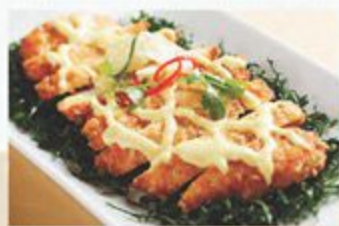
GAJ TOD SAUCE MANAO Crispy fried chicken in lime sauce 酥炸油煎鸡肉配酸橙酱