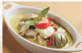
195 GAENG KIAO WAN Green curry with a choice of chicken or pork and herbs 绿咖喱配鸡肉或猪肉和香料