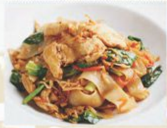
PHAD SI EUW Stir-fried flat noodle with chicken or pork 泰式炒宽面配鸡肉或猪肉