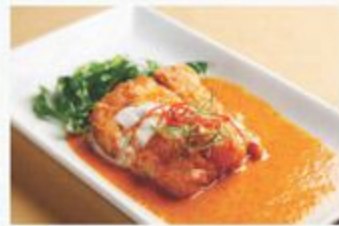
310 CHU CHEE PLA Fish fillet in rich red coconut curry and kaffir lime 椰汁红咖喱鱼柳配卡菲尔酸橙