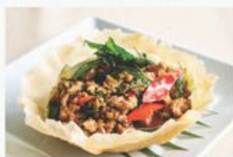
235 PHAD BAI KAPROW Stir-fried basil leaves and chillies with choice of pork or chicken 泰式炒猪肉或鸡肉配辣椒和罗勒叶