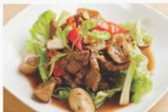
630 NUEA PHAD NAM MANHOY NZ fillet of beef stir-fried with oyster sauce 爆炒新西兰牛柳配蚝油酱