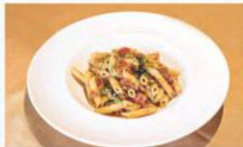
280 PENNE PUTTANESCA Penne with anchovies, black olives, capers 意式香辣橄榄油心粉 - 意式扁豆配凤尾鱼橄榄、酸豆