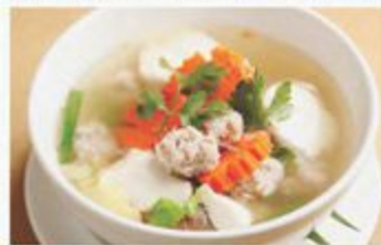
220 GAENG JURU Clear vegetable soup with minced pork and tofu 蔬菜清汤配猪肉丸和豆腐