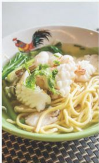
295 NOODLE SOUP Rice noodle, yellow noodle with choice of chicken, pork, beef or seafood 汤面 请从鸡肉、猪肉、牛肉和海鲜中选择一个