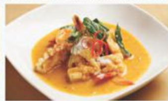
235 PANAENG SEAFOOD Mixed seafood with thick red coconut curry and kaffir lime 混合海鲜配椰汁红咖喱和卡菲尔酸橙