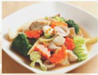
230 PHAD PAK RUAM Stir-fried mixed vegetables 清炒时蔬