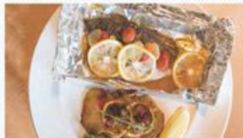
360 BAKED SNAPPER Baked Sea bass fillet in foil with tomatoes, lime garlic and thyme 香烤石斑鱼 - 香烤石斑鱼片搭配西红柿、柠檬大蒜和百里香