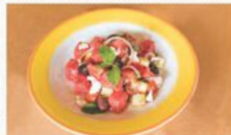
GREEK STYLE WATERMELON SALAD 235 Tossed watermelon cube, tomatoes, cucumber, black olives and crumbled feta cheese 希腊西瓜沙拉 - 凉拌西瓜、西红柿、黄瓜和希腊站碎奶酪