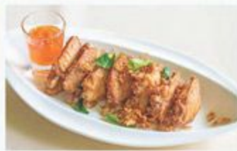
265 PEEK GAI TOD SAMUN PRAI Fried chicken wings with lemongrass and kaffir lime 泰式炸鸡翅