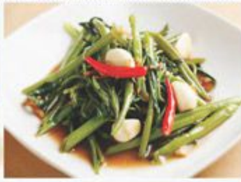
180 PHAD PAK BOONG Stir-fried morning glory and salted beans 清炒空心菜配咸豆