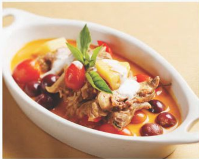
GAENG PHED PED YANG Roasted duck, lychee and pineapple with red curry 红咖喱脆皮油封鸭荔枝·菠萝