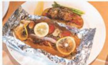
BAKED SALMON Baked salmon fillet in foil with tomatoes, lime garlic and thyme 炉烤三文鱼 - 铁箔三文鱼搭配蒜蓉和百里香