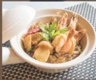
GOONG OB WOONSEN Baked prawns with glassnoodle 泰式粉丝虾煲