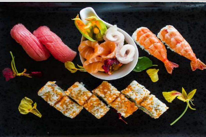
JI RAINBOW with fresh sliced raw fish SUPREME 2 fatty bluefin tuna nigiri, 3 salmon belly sashimi, 2 snapper sashimi, 2 prawn nigiri & california roll