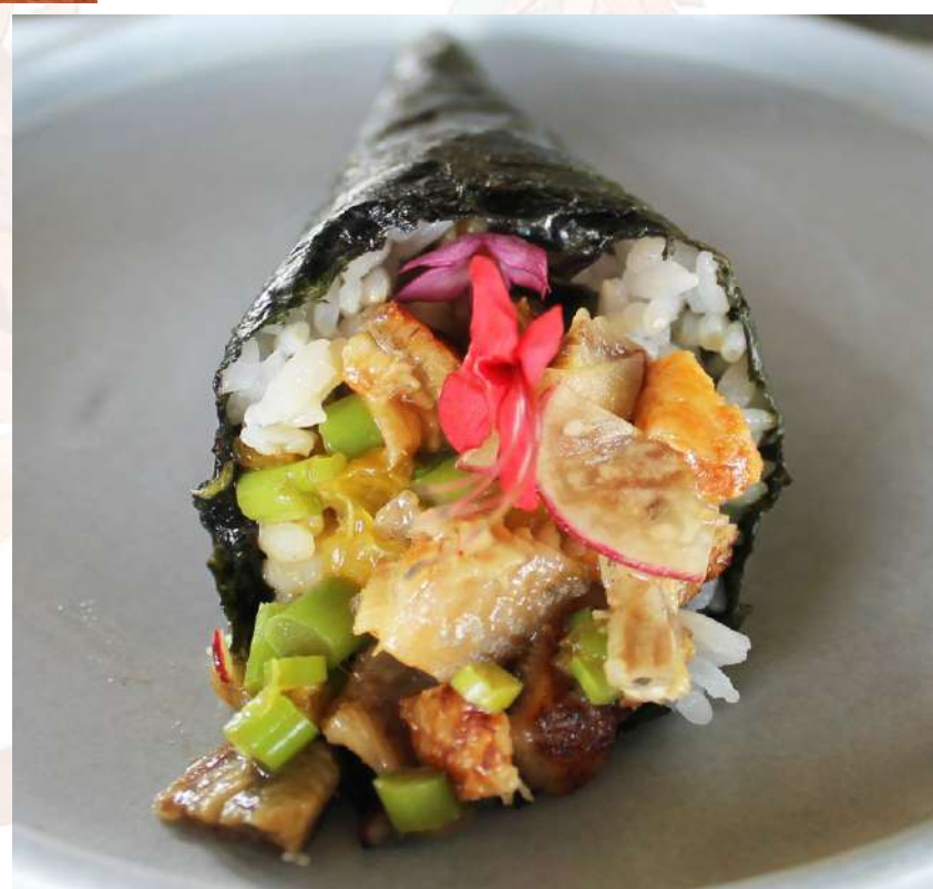
KAGAMI eel, Hung Qu leaf, radish, asparagus