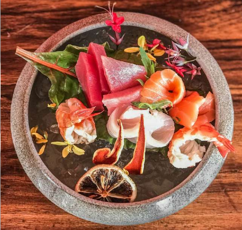
ASSORTED SASHIMI (10pcs)