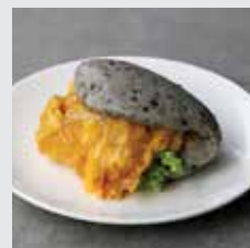
Salted Egg Chicken