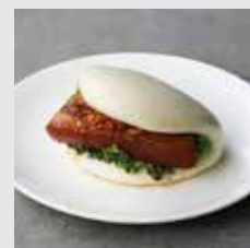
Belly of Pork