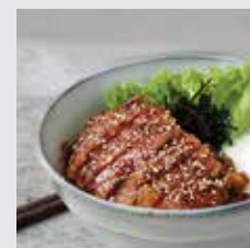
Teriyaki Chicken $13.80

Deep fried chicken cubes, kecap manis marinate, onsen egg