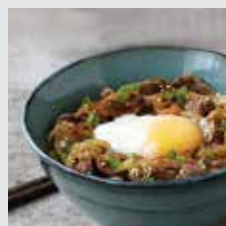
Ginger Beef $17.80

Stir fried beef slice, onions, ginger sauce, onsen egg