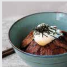
Teriyaki Beef Steak $17.80

Pan fried chicken, house blend teriyaki sauce, onsen egg