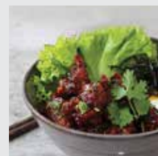
Kecap Manis Chicken $13.80

Salmon with torched cod roe sauce, onsen egg