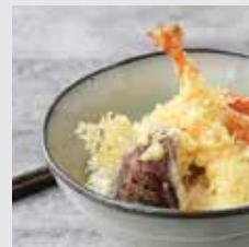
Prawn Tempura & Vegetables $14.80

Pan seared beef steak, house blend teriyaki sauce, onsen egg