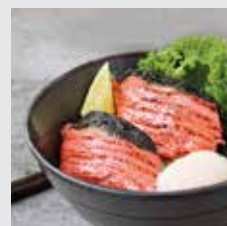
Salmon Mentaiko $14.80

Stir fried beef slice, onions, ginger sauce, onsen egg