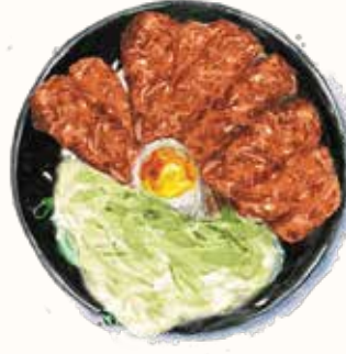
Smoked Pork Katsu 23 black garlic aioli, onsen egg, shredded cabbage, pickles