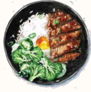
"Anxin" Chicken 21 smoked tare, onsen egg, crispy garlic, shredded crispy potato, seasonal side