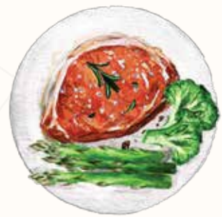
Ribeye Roast 25 black garlic aioli, seasonal salad & side