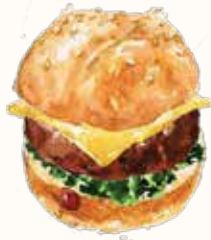
Dry-Aged Wagyu Beef 25 MP sauce, cheddar cheese, shredded cabbage

Swap taro chips with: • House-cut fries +2 • MP salad +2 • Seasonal soup (S) +2