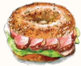
Wagyu Reuben 21 Russian dressing, emmental cheese