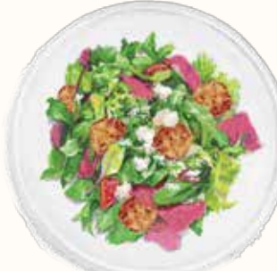
Beetroot & Crispy Cauliflower 19 apple cider vinaigrette, mixed mesclun, quinoa, umami pumpkin seed