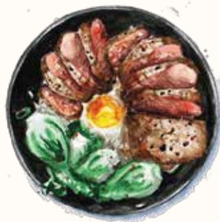
Wagyu Tender 25 horseradish lemon cream, onsen egg, crispy garlic, shredded crispy potato, seasonal side