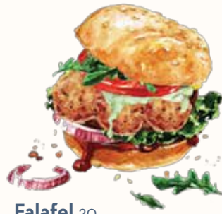
Falafel 20 cilantro mint, spanish onion, tomato, shredded cabbage,