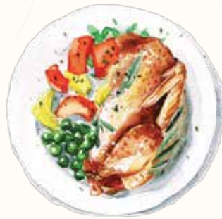
Smoked "Anxin" Chicken 21 butter sauce, seasonal salad & side

Swap mix mesclun or seasonal side with: • House-cut fries +2