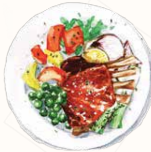
St. Louis Pork Ribs 24 MP chipotle sauce, seasonal salad & side