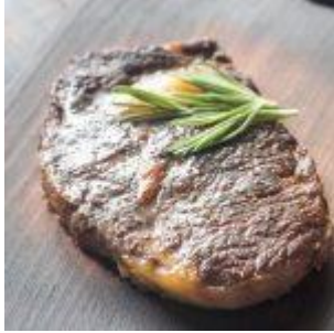
Ribeye Steak 200g/250g Pan Roasted Australian Ribeye Steak

Served with Choice of Sauce and Two Sides. Additional Sauce at $2.0/serving. Additional Sides at $3.0/side.