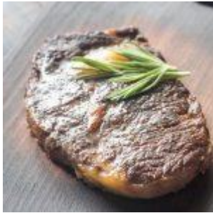
Angus Ribeye Steak Pan Roasted Grain Fed 150-Days Australian Angus Ribeye Steak