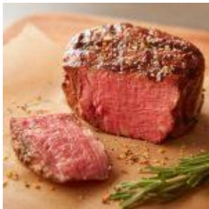
Tenderloin Steak 200g/250g Pan Roasted Australian Tenderloin Steak