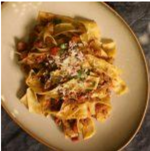
Beef Bolognese Pappardelle