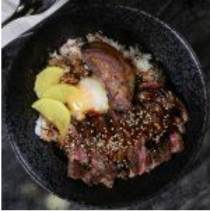
Steak & Foie Gras

Japanese rice . Sous vide egg . Pickles . Special sauce