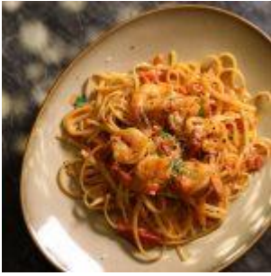
Pink Sauce Prawn Linguine