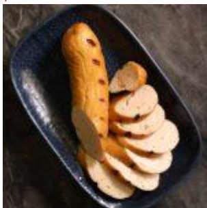
Chicken Cheese Sausage