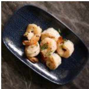
Grilled Prawn (6 pcs)