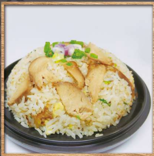
H1. Fried Rice