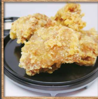
S3. Chicken Karaage $5.50 (4pcs)