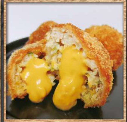
S5. Tori Nacho Bomb $6.80 (3pcs)