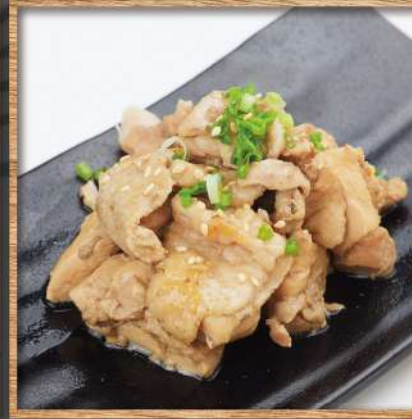
S4. Tori Sukiyaki $5.50