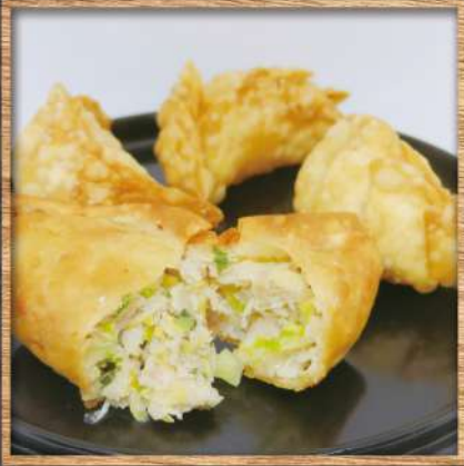
S1. Deep-Fried Gyoza $5.50 (4pcs)