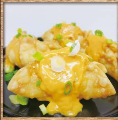
S2. Cheesy Fried Gyoza $6.80 (4pcs)