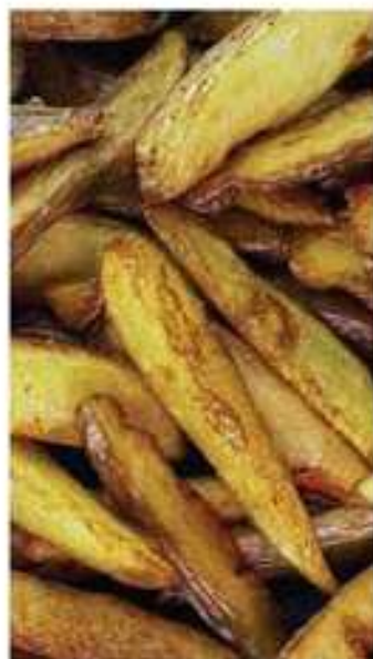
LEON'S ORIGINAL FRIES 100 B

AT LEON WE USE ORGANIC POTATOES FOR OUR FRIES. THEY'RE FLOURY AND HAVE HIGH STARCH LEVELS. WE USE A THREE-STAGE COOKING PROCESS IN BEEF FAT TO GUARANTEE THE CRISPIEST FRIES.