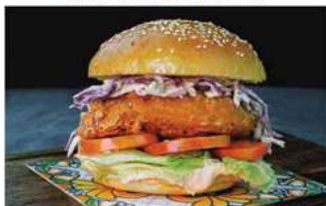
CRISPY SPICY CHICKEN - 320 B

CHOICE OF BEEF OR PORK PATTY, TOMATO CONFIT, NDUJA, BURRATA, CRISPY VENTRICINA & ROCKET SALAD