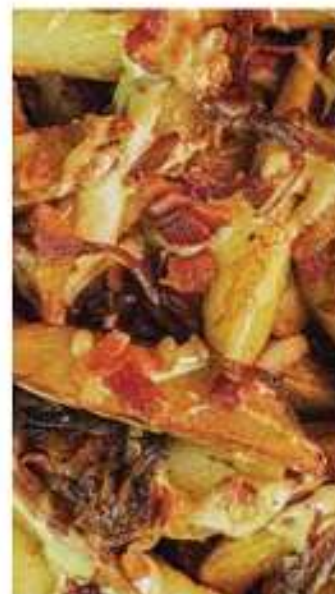
LEON'S SWEET MUSTARD FRIES 180 B