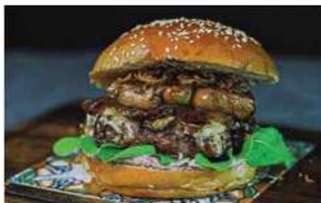
LEON'S FOIE GRAS - 690 B

CHOICE OF BEEF OR PORK PATTY, CHEESE, BACON JAM, ONIONS, TOMATOES, PICKLES, LETTUCE & HOMEMADE MUSTARD SAUCE