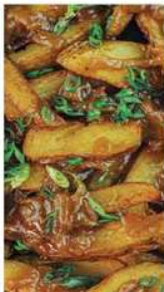
LEON'S SHALLOT GRAVY FRIES 180 B

TRUFFLE CHEESE SAUCE, BACON BITS, SPRING ONIONS