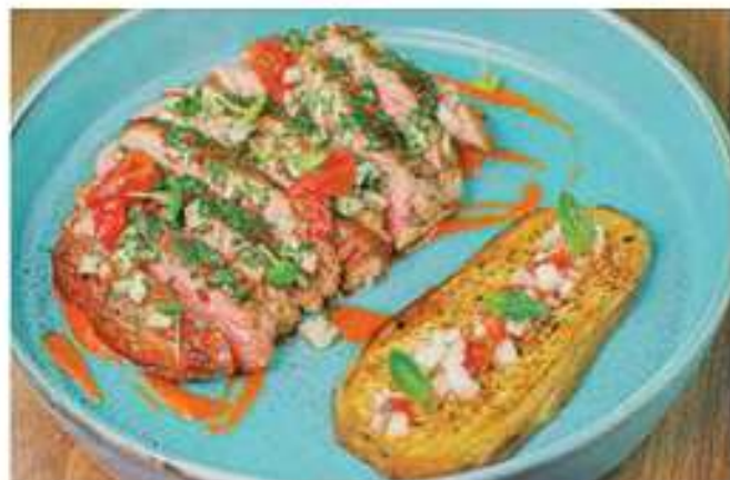
FARMER GRILLED PORK - 490 B

ORGANIC GRILLED PORK NECK, BELL PEPPERS, EGGPLANT & CHIMICHURRI