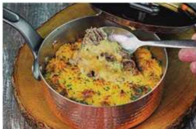
LAMB SHOULDER 'PARMENTIER' - 590 B

SEARED SALMON, GRILLED BROCCOLINI, BELL PEPPER CONFIT & CHORIZO SAUCE