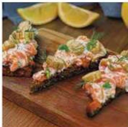
SALMON TOAST 280 B

MARINATED SALMON, YOGHURT, PICKLES & HOMEMADE RYE BREAD