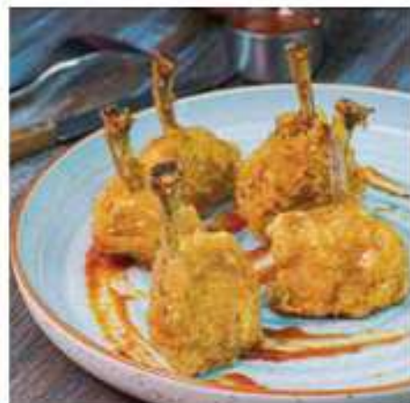
CHICKEN WINGS 260 B

MARINATED SALMON, YOGHURT, PICKLES & HOMEMADE RYE BREAD