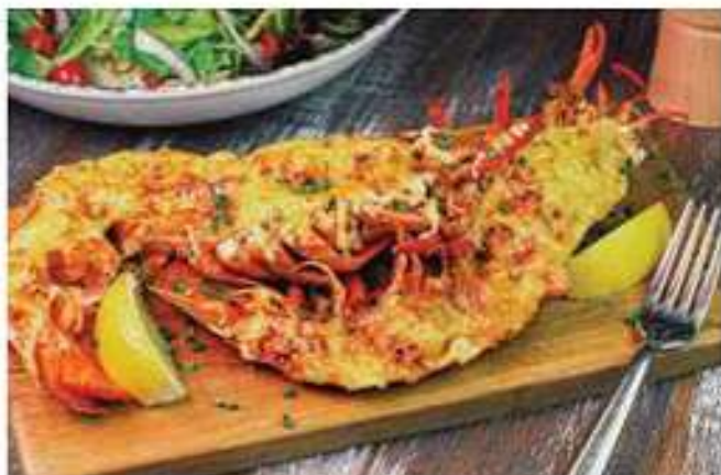
LOBSTER THERMIDOR - 990 B

ORGANIC GRILLED PORK NECK, BELL PEPPERS, EGGPLANT & CHIMICHURRI