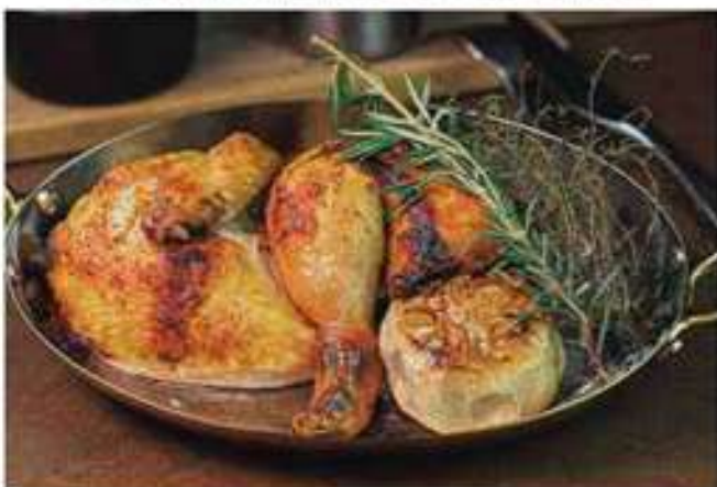
HALF FARMER CHICKEN (350GR) - 490 B

GRILLED BONE MARROW, BEEF CHEEKS, TOMATO RELISH, CRISPY SHALLOTS & JIM JAEW SAUCE