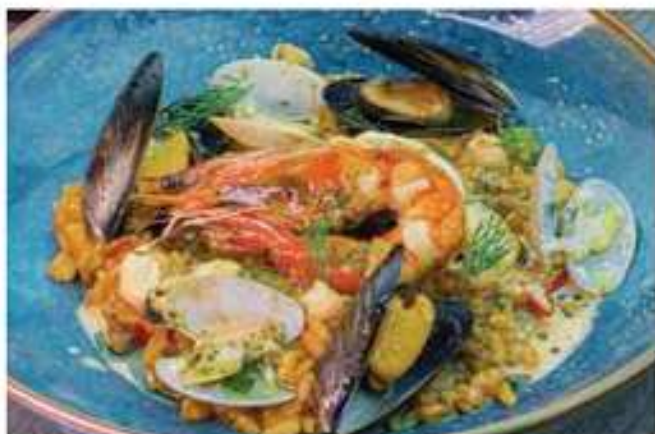
SEAFOOD RISOTTO - 690 B

24 HOURS SLOW-COOKED LAMB SHOULDER, MUSHROOMS, BEANS & MASHED POTATOES