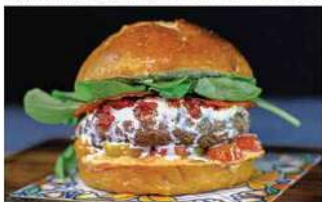
MEDITERRA - 490 B

CHOICE OF BEEF OR PORK PATTY, FOIE GRAS CREAM, CHEESE, ONION COMPOTE, PAN-SEARED FOIE GRAS, ROCKET & BALSAMIC CARAMEL