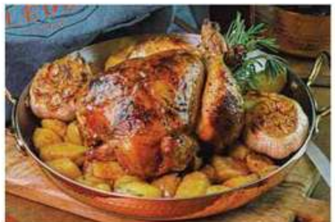
BABY CHICKEN "PERIGOURDIN" (1KG) - 1,690 B FOIE GRAS & TRUFFLE

OUR FAMOUS ROASTED ORGANIC CHICKEN SERVED WITH A SAUCE OF YOUR CHOICE