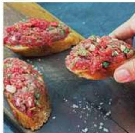
BRUSCHETTA BEEF TARTARE 320 B

CRISPY ORGANIC CHICKEN WINGS, HOMEMADE BBQ SAUCE