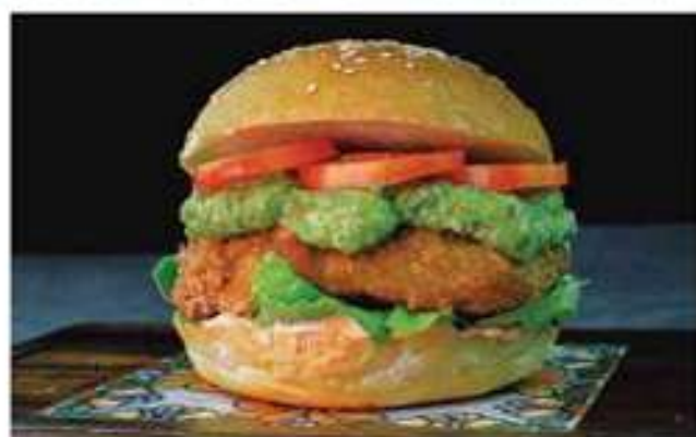
✓ PORTOBELLO VEGETARIAN - 370 B

ORGANIC CRISPY MARINATED CHICKEN, TOMATOES, COLESLAW, LETTUCE & SPECIAL SPICY SAUCE