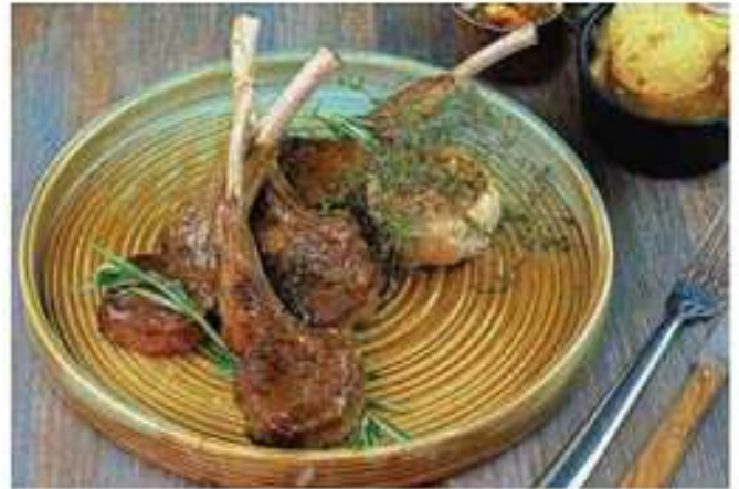
AUSTRALIAN LAMB RACK

PREPARED BY CHEF, SERVED WITH LEON'S FRIES OPTION: "ALLER RETOUR" SNACKED