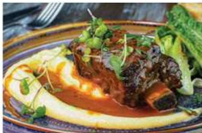
ANGUS SHORT RIBS - 890 B

WHOLE LOBSTER, LOBSTER BECHAMEL, CHEESE GRATIN & GARDEN SALAD