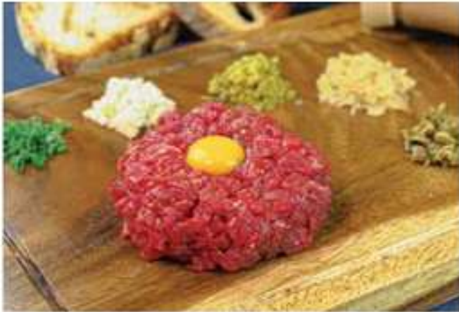
BEEF TARTARE "AU COUTEAU" - 590 B

PREPARED BY CHEF, SERVED WITH LEON'S FRIES OPTION: "ALLER RETOUR" SNACKED