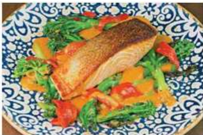
SALMON & CHORIZO - 540 B

48 HOURS SLOW-COOKED SHORT RIBS, MASHED POTATOES, GRILLED BABY COS & SPECIAL SAUCE