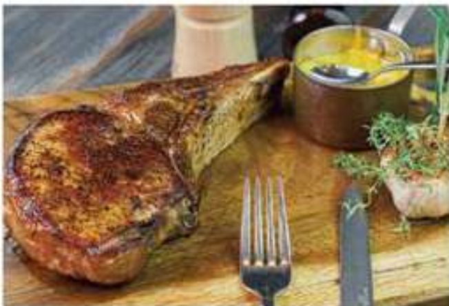
FARMER PORK CHOP

GRILLED LAMB RACK, SERVED WITH A SAUCE OF YOUR CHOICE