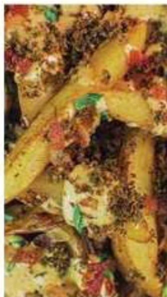
LEON'S TRUFFLE-CHEESE FRIES 240 B

THE UNFORGETTABLE. FRIED UNTIL GOLDEN CRISPY