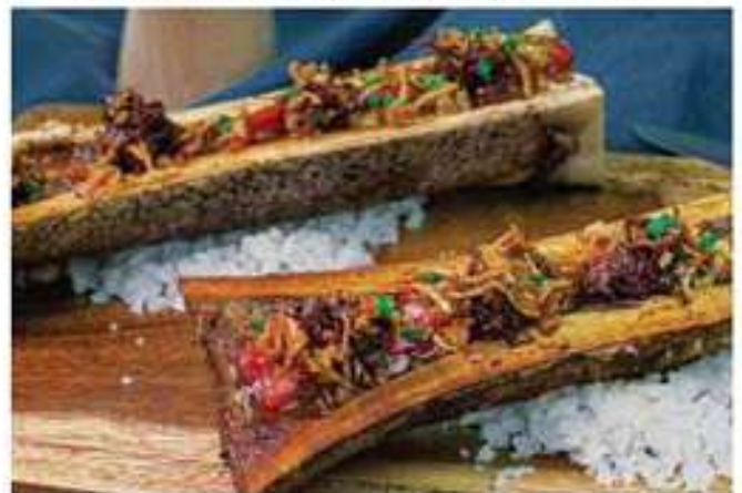
LEON'S BONE MARROW - 390 B

GRILLED PORK CHOP, SERVED WITH A SAUCE OF YOUR CHOICE