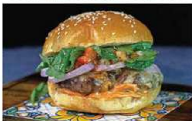
ORIENTAL LAMB - 520 B

CRISPY PORTOBELLO MUSHROOM PATTY, TOMATO AIOLI, ICEBERG LETTUCE, TOMATOES & SMASHED AVOCADO