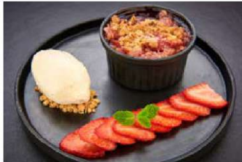
Strawberry Rhubarb Crumble 290 Baked strawberry and rhubarb compote, topped with oatmeal crumble. Served with a scoop of vanilla ice cream