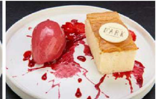
Japanese Cheesecake 290 Japanese soufflé cheesecake served with raspberry coulis and a scoop of raspberry sorbet