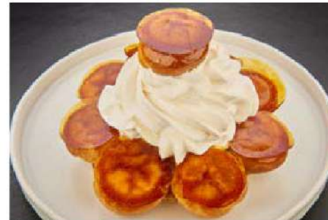
Saint-Honoré 290 Choux pastry filled with pastry cream on puff pastry dough, topped with nougatine caramel, chiboust cream and whipped cream