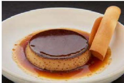
Coffee Flan 250 Topped with caramel sauce and served with crispy rolled butter biscuit