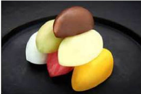
6-Scoop-Pyramid 300 Your selection of 6 scoops of ice cream or sorbet

D'ARK artisan ice creams and sorbets are elaborated in-house by our Pastry Chef, using exclusively natural ingredients: fresh fruits, frozen fruit purées, 70%-cocoa dark chocolate, matcha green tea and – for ice creams – eggs and fresh whole milk. We do not use any stabilizer, emulsifier or any other food additives.