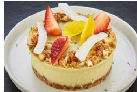
Avocado Cheesecake 290 Avocado New-York-style cheesecake, topped with strawberry, caramelized almonds, cashew nuts, coconut shavings and lime peel