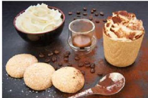
D'ARK Espresso Tiramisu 250 Ladyfinger biscuits topped with D'ARKer espresso shot, mascarpone cream and cocoa powder