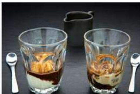
Affogato Vanilla 150 Affogato Salted Butter Caramel 150 A scoop of ice cream topped with a double shot espresso

All prices are in Thai Baht, exclusive of 7%-VAT and 10%-service charge