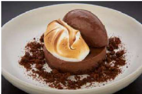
Chocolate Fondant 290 Topped with burnt marshmallow and artisan chocolate sorbet