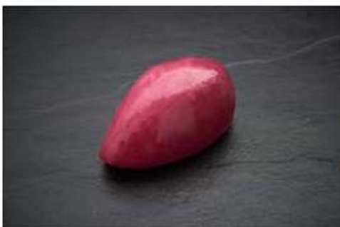
1 Scoop 60 A scoop of ice cream or sorbet of your choice