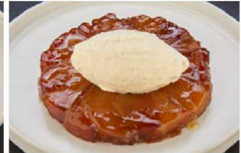
Apple Tart Tatin 290 Upside down caramelized apple tart, topped with a scoop of vanilla ice cream