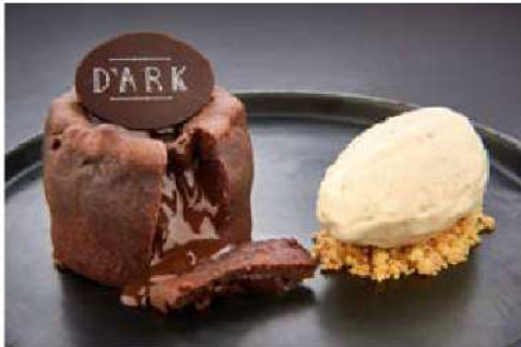
Chocolate Lava 350 70%-cocoa dark chocolate lava cake. Served with a scoop of vanilla ice cream