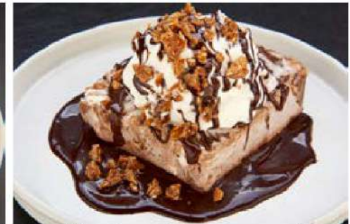
Amaretti Ice Cream Cake 350 Caramel-praline-amaretti-cookie ice cream cake topped with cracked nougatine, whipped cream and mocha sauce