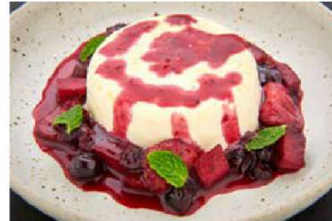
Panna Cotta 290 Soft cream vanilla pudding, topped with apple-blueberry-strawberry coulis