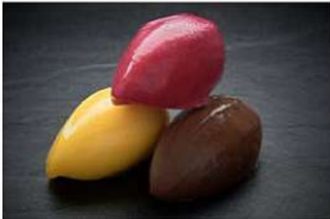
3-Scoop-Pyramid 160 Your selection of 3 scoops of ice cream or sorbet