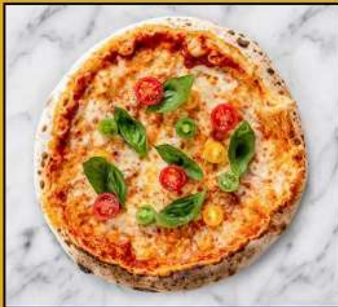
Margherita Tomato sauce, mozzarella, olive oil and basil