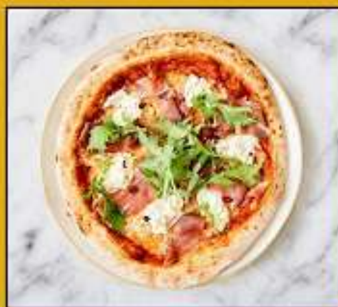
Rocket & Prosciutto 10": 270€ Sloane's prosciutto, wild rocket, 14": 360€ mozzarella, mascarpone and chili oil