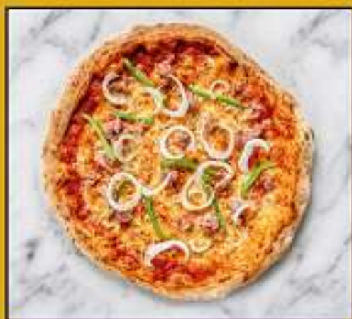
Sausage & Chili 10": 270€ Sloane's fennel sausage, roasted 14": 360€ green chili, mozzarella and fennel shavings