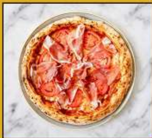
Jamon Iberico & Tomatoes 10": 270€ Iberico ham, olive oil and fresh 14": 360€ tomato slices