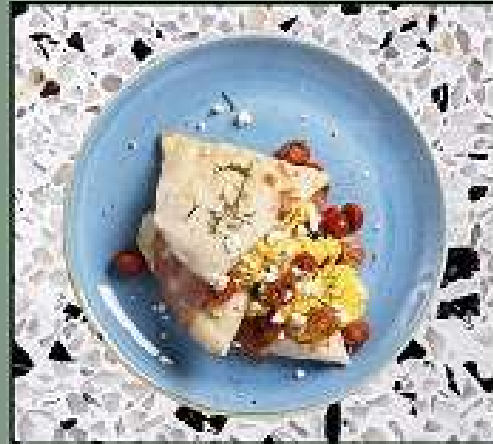
Breakfast Piada 290s Free-range eggs, mortadella, basil-tomato, feta cheese and harissa layered in freshly baked Italian flatbread