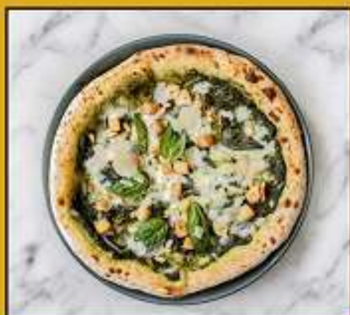
Potato, Pesto & Garlic [v] 10": 240€ 14": 340€ Fried potato, toasted garlic, mozzarella, grana padano and pesto