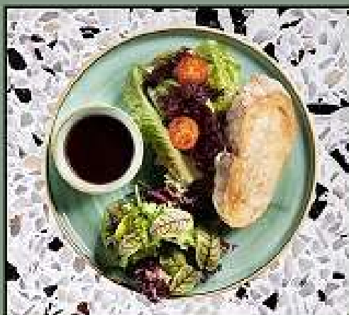
Chicken & Cranberry Sando 320s Chicken breast, sour cream dill mayo, onion and cranberry sauce between homemade sourdough