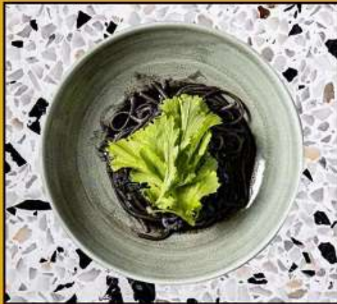
Cured Squid & Mustard Leaves 350฿ Linguine with cured squid, squid ink, chili flakes and mustard leaves