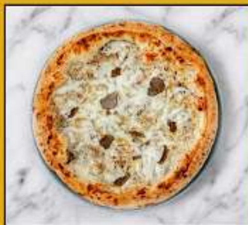
Mushroom Truffle 10": 499€ 14": 699€ Cream, truffle paste, summer truffle slices and mozzarella