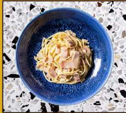
Carbonara Spaghetti with bacon, eggs and Chachoengsao guanciale