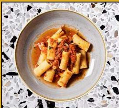
Octopus 400฿ Rigatoni pasta with octopus stewed in tomato