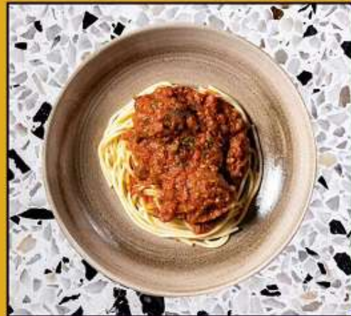
Spaghetti & Meatballs Spaghetti with wagyu meatballs in tomato sauce