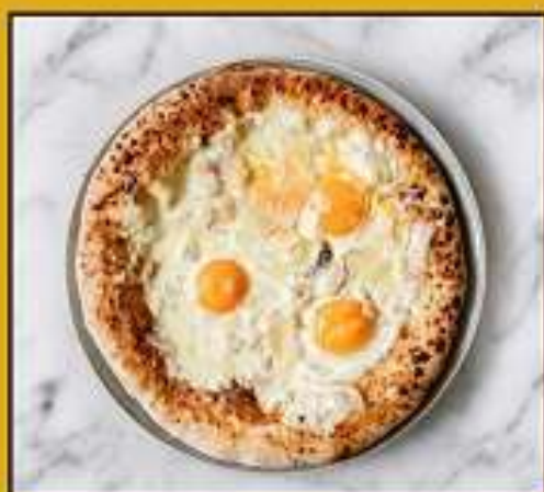
Carbonara 10": 270€ 14": 350€ Bacon, egg, cream cheese, mozzarella, grana padano and guanciale