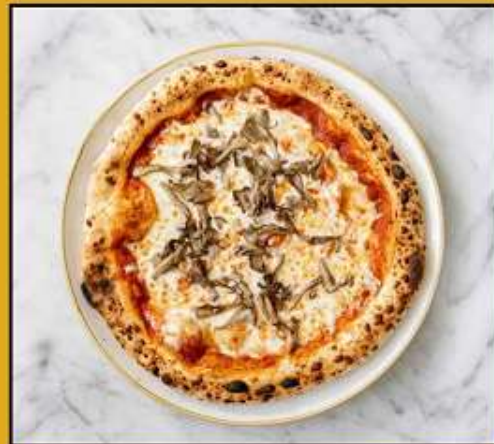
Mushroom Garlic Maitake mushrooms, garlic oil and mozzarella