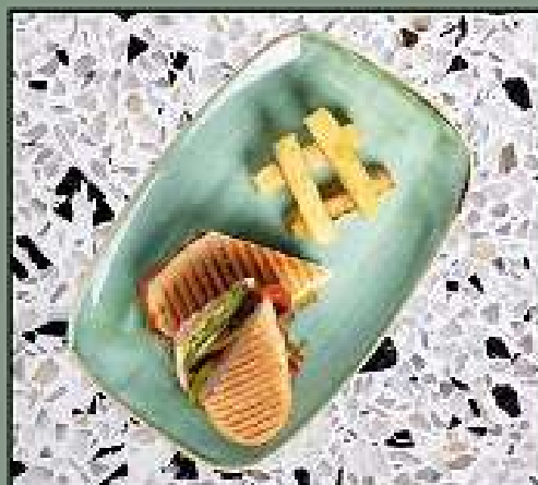
BBQ Ribeye Panino 370s Grilled ribeye beef, onion jam, house BBQ sauce and Asian mixed salad sandwiched in a soft panino