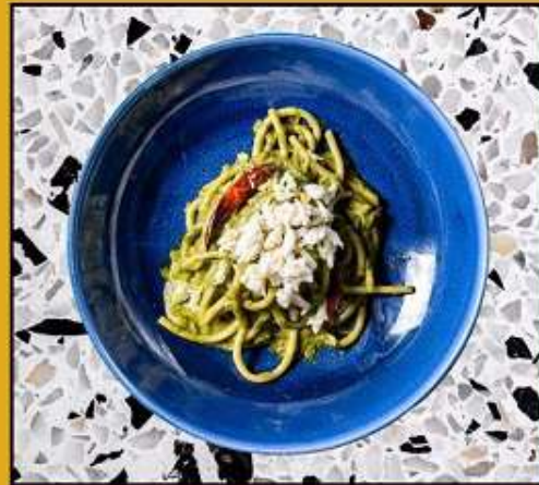
Crab & Pesto 460฿ Bucatini pasta tossed in blue swimmer crab meat with pesto and white wine sauce