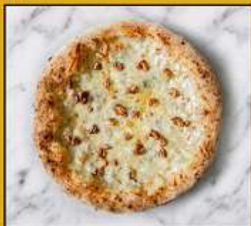
Five Cheese 10": 270€ 14": 360€ Imported seasonal cheese, walnut and honey