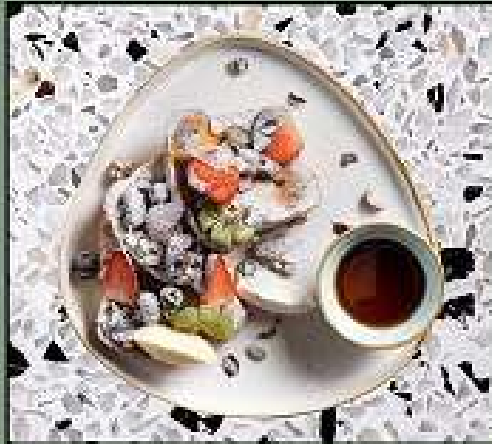
Fully Loaded French Toast 270s Shokupan milky French toast, cream, maple syrup and seasonal fruit