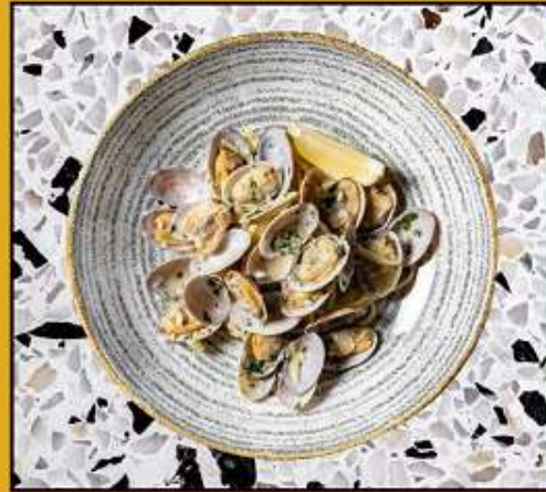
Vongole 430฿ Linguine with Asari clams, garlic and parsley