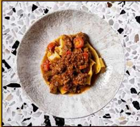
Beef Shank 400฿ Fresh reginette pasta with beef shank ragu and fresh grated parmesan