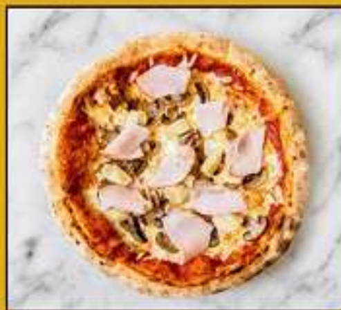
Artichoke, Mushroom & Ham 10": 240€ Pickled artichoke, champignons, 14": 320€ mozzarella and smoked ham