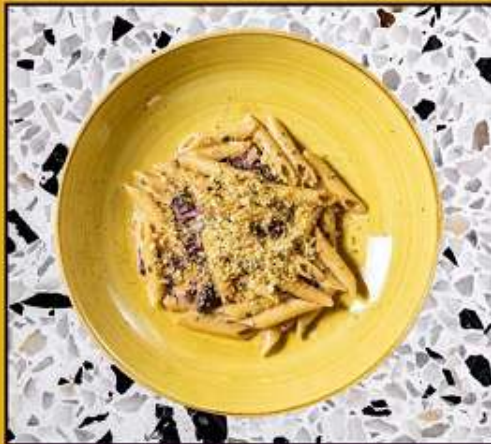
Anchovy Butter & Radicchio Penne sautéed in anchovies blended in butter with chopped radicchio and garlic bread crumbs