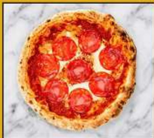
Chorizo 10": 280€ Spicy chorizo, scamorza and moz- 14": 370€ zarella