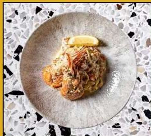
Tiger Prawn 550฿ Fettuccine with tiger prawns, tomato, brandy, cream and parsley