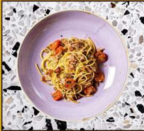
Aglia Olio Spaghetti with house-cured Sloane's pancetta, parsley and extra virgin olive oil