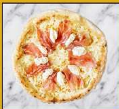
Mascarpone & Parma Ham 10": 280€ 14": 370€ Mascarpone, parma ham and mozzarella