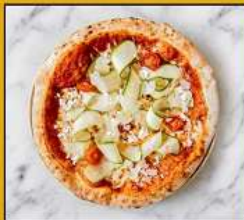
Zucchini & Feta [v] 10": 255€ Zucchini, Chiang Mai feta, pine 14": 345€ nuts, mozzarella and grana padano slices