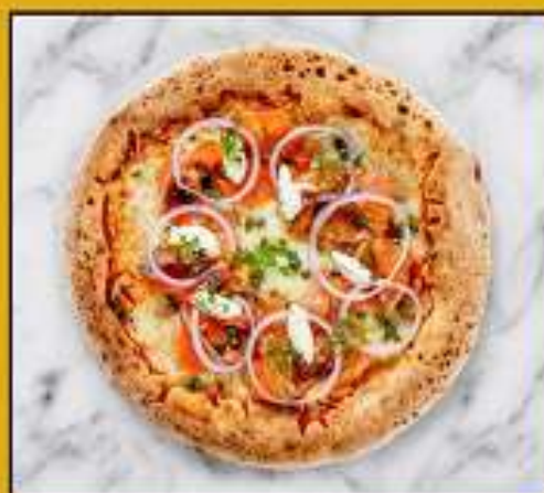
Gravlax & Cream 10": 260€ 14": 350€ Gravlax, dill, spring onion, mozzarella and sour cream