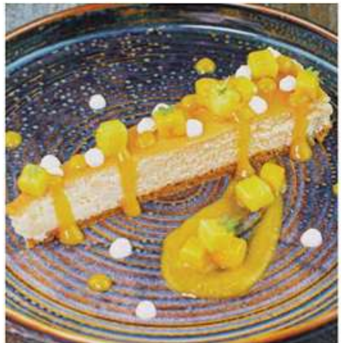
LEON'S CHEESECAKE - 290 B

HOMEMADE 70% VALRHONA CHOCOLATE BROWNIE, CHOCOLATE GANACHE, CRUMBLE & VANILLA ICE CREAM