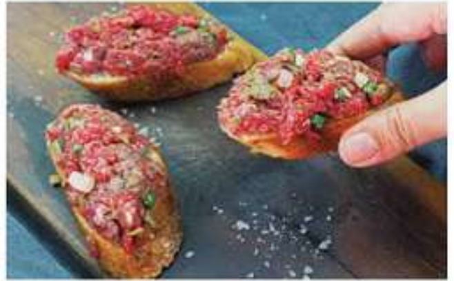
BRUSCHETTA BEEF TARTARE - 320 B

DELICATE HOMEMADE FOIE GRAS MOUSSE, HAZELNUT, APRICOT JAM, TRUFFLE HONEY & BRIOCHE TOAST