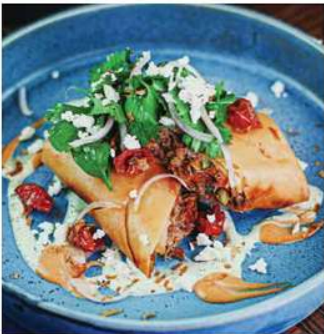
LAMB PASTILLA - 360 B CRISPY LAMB COOKED WITH SPICES, YOGHURT SAUCE, FRESH CORIANDER & ROASTED TOMATOES