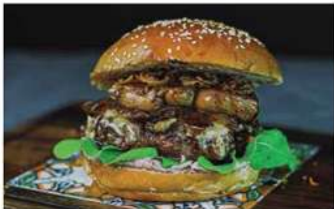
LEON'S FOIE GRAS - 690 B

CHOICE OF BEEF OR PORK PATTY, CHEESE, CRISPY BACON, ONIONS, TOMATOES, PICKLES, LETTUCE & HOMEMADE LEON'S SAUCE