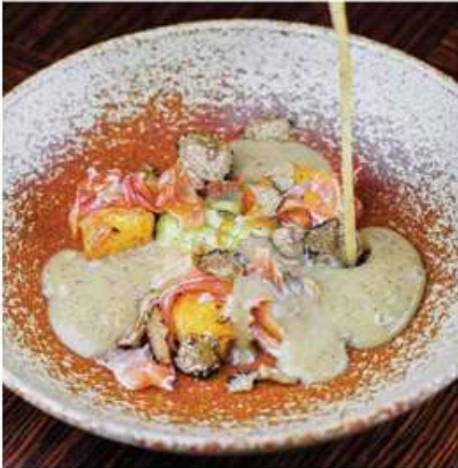
🍴 CHEF'S TRUFFLE SOUP - 420 B POTATO & LEEKS VELOUTE INFUSED WITH TRUFFLE, CROUTONS & CRISPY BACON