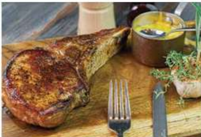
FARMER PORK CHOP (350GR) - 560 B

GRILLED LAMB RACK, SERVED WITH A SAUCE OF YOUR CHOICE