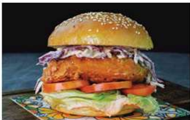
CRISPY SPICY CHICKEN - 320 B

CHOICE OF BEEF OR PORK PATTY, TOMATO CONFIT, NDUJA, BURRATA, CRISPY VENTRICINA & ROCKET SALAD