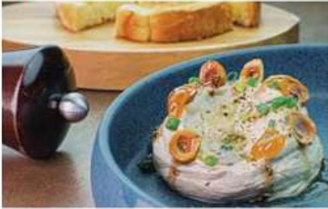
FOIE GRAS & HONEY TRUFFLE - 490 B

DELICATE HOMEMADE FOIE GRAS MOUSSE, HAZELNUT, APRICOT JAM, TRUFFLE HONEY & BRIOCHE TOAST