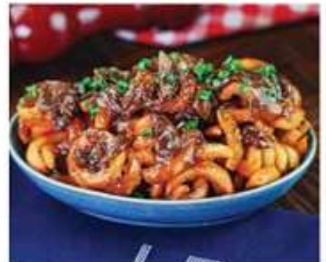
LEON'S SHALLOT FRIES 180 B

TAMARIND CHILI SAUCE, CORIANDER, RED ONIONS, ROASTED RICE