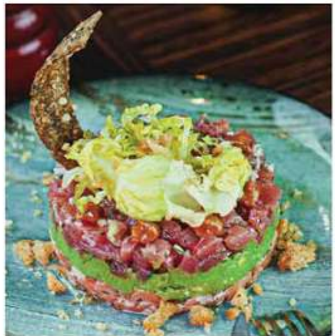
TUNA & SALMON TARTARE - 390 B TUNA & SALMON TARTARE MARINATED WITH LEMON, AVOCADO & GREEN APPLES