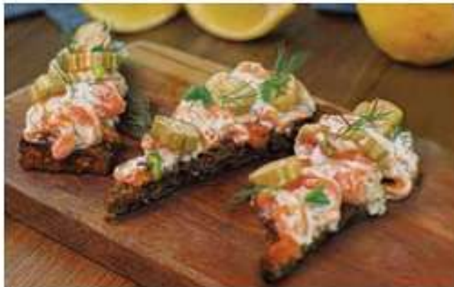
SALMON TOAST - 280 B

FLAVOURFUL BEEF TARTARE ON CRISPY BAGUETTE