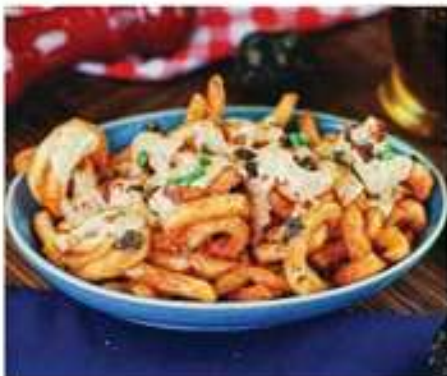
LEON'S TRUFFLE-CHEESE FRIES 240 B

TRUFFLE CHEESE SAUCE, BACON BITS, SPRING ONIONS