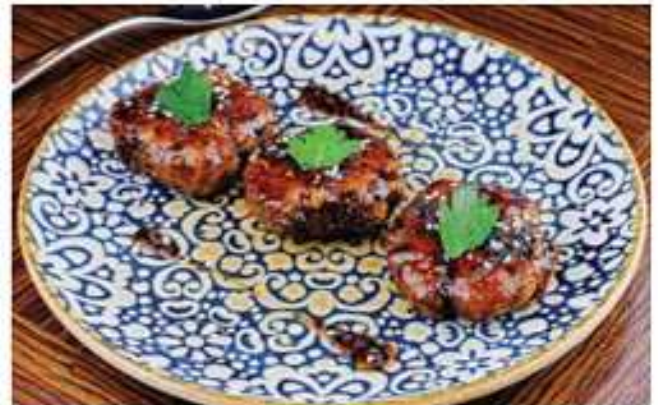
CRISPY DUCK - 260 B

MARINATED SALMON, YOGHURT, PICKLES & HOMEMADE RYE BREAD