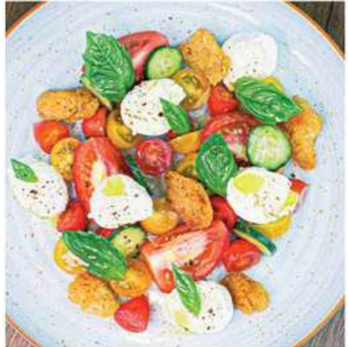
🍴 ORGANIC TOMATO & MOZZARELLA - 440 B HEIRLOOM TOMATOES, CUCUMBER, GAZPACHO DRESSING, BELL PEPPERS, MOZZA DI BUFALA & CROUTONS