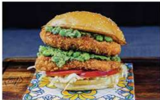
CRISPY FISH - 370 B

ORGANIC CRISPY MARINATED CHICKEN, TOMATOES, COLESLAW, LETTUCE & SPECIAL SPICY SAUCE