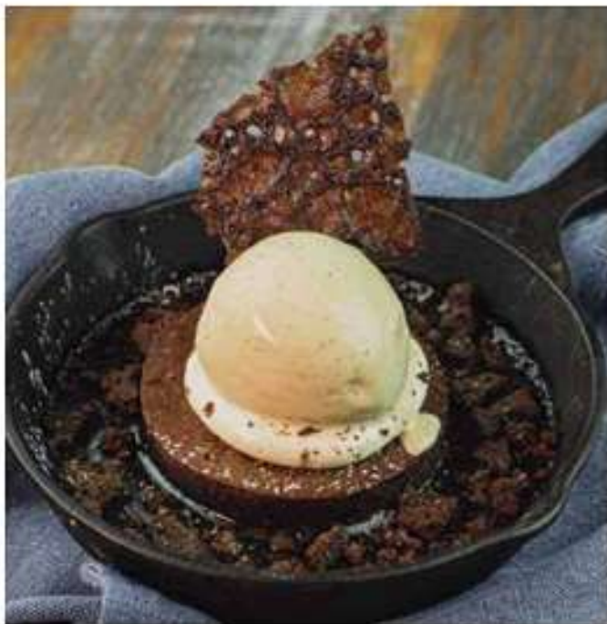
VERY CHOCOLATE BROWNIE - 320 B

STRAWBERRY SEMI-FREDO, BERRY CRUMBLE & CRISPY MERINGUE