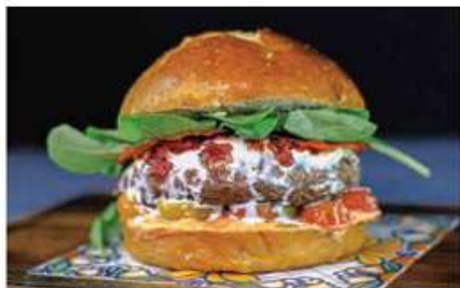
ITALIAN STYLE - 490 B

CHOICE OF BEEF OR PORK PATTY, FOIE GRAS CREAM, CHEESE, ONION COMPOTE, PAN-SEARED FOIE GRAS, ROCKET & BALSAMIC CARAMEL