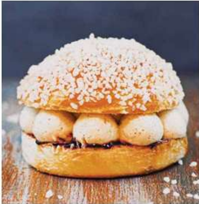
THE FAMOUS 'TARTE TROPEZIENNE' - 290 B

HOMEMADE BRIOCHE, VANILLA CREAM, BLACKCURRANT CONFIT & CRUNCHY SUGAR