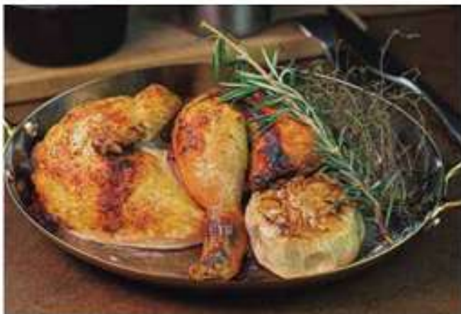
HALF FARMER CHICKEN (350GR) - 490 B

GRILLED BONE MARROW, BEEF CHEEKS, TOMATO RELISH, CRISPY SHALLOTS & JIM JAEW SAUCE