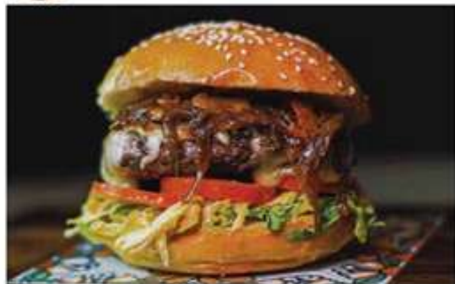
B-C-B (BEEF CHEESE BACON) - 360 B

CHOICE OF BEEF OR PORK PATTY, CHEESE, CRISPY BACON, ONIONS, TOMATOES, PICKLES, LETTUCE & HOMEMADE LEON'S SAUCE