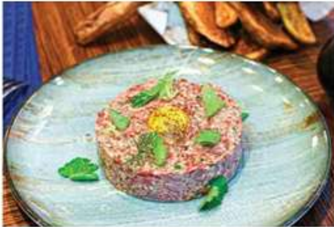
BEEF TARTARE "AU COUTEAU" - 590 B

PREPARED BY THE CHEF. SERVED WITH LEON'S FRIES. OPTION: "ALLER RETOUR" SNACKED