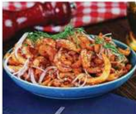
LEON'S LARB FRIES 180 B

TRUFFLE CHEESE SAUCE, BACON BITS, SPRING ONIONS