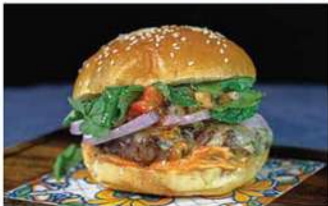
ORIENTAL LAMB - 520 B

CRISPY FISH PATTY, TOMATOES, LETTUCE, TOMATO BÉARNAISE & SMASHED GREEN PEAS