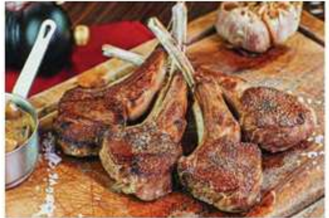
AUSTRALIAN LAMB RACK (350GR / 700GR) - 1,190 B / 2,380 B

PREPARED BY THE CHEF. SERVED WITH LEON'S FRIES. OPTION: "ALLER RETOUR" SNACKED