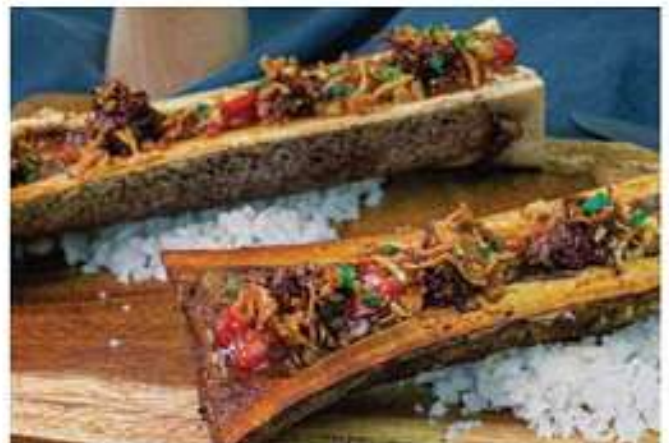
LEON'S BONE MARROW - 490 B

GRILLED PORK CHOP, SERVED WITH A SAUCE OF YOUR CHOICE