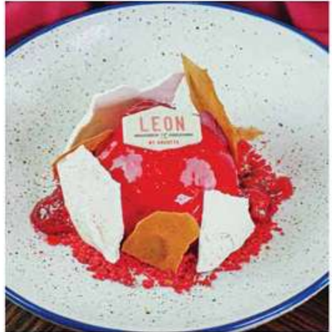
LEON'S SEMI-FREDO - 290 B

HOMEMADE BRIOCHE, VANILLA CREAM, BLACKCURRANT CONFIT & CRUNCHY SUGAR