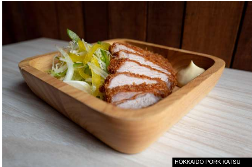
HOKKAIDO PORK KATSU