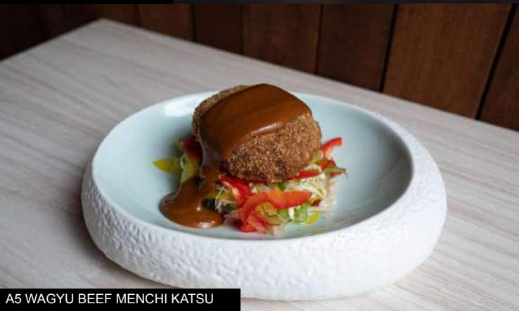
A5 WAGYU BEEF MENCHI KATSU