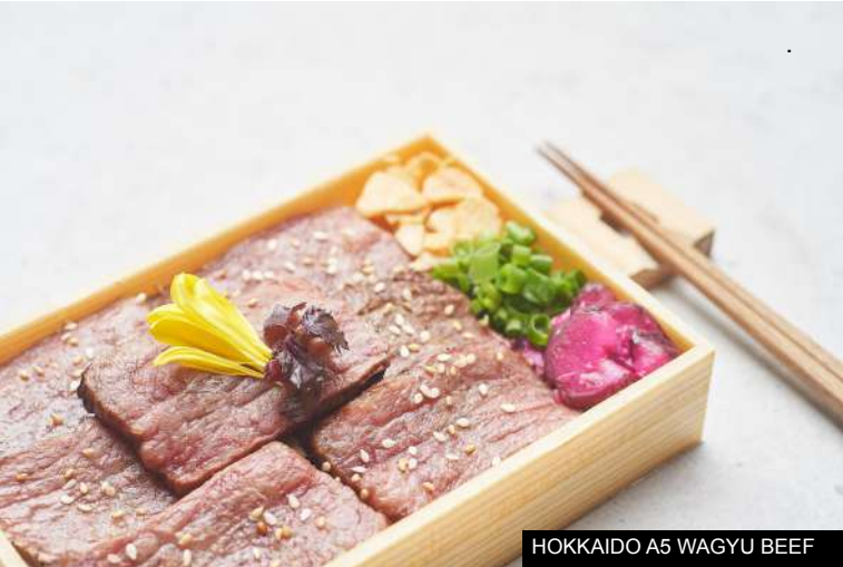
HOKKAIDO A5 WAGYU BEEF