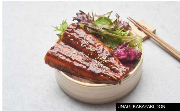
UNAGI KABAYAKI DON