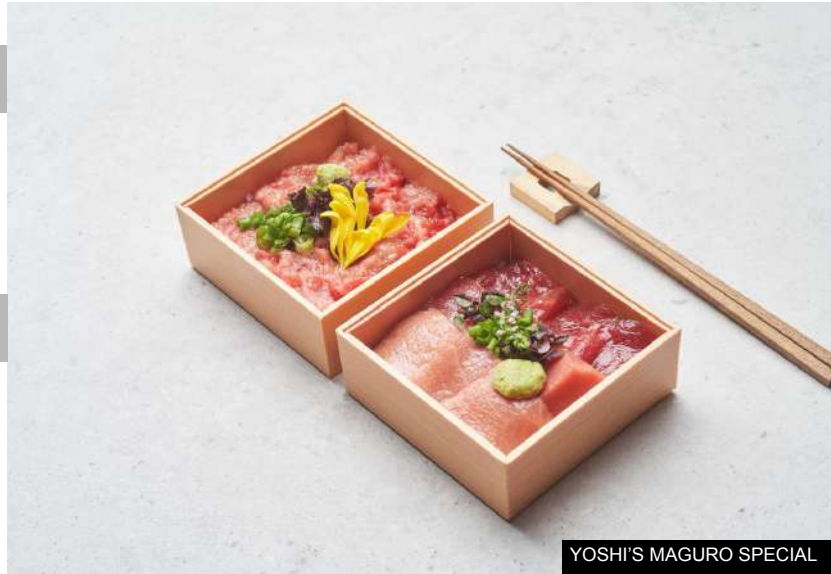
YOSHI'S MAGURO SPECIAL