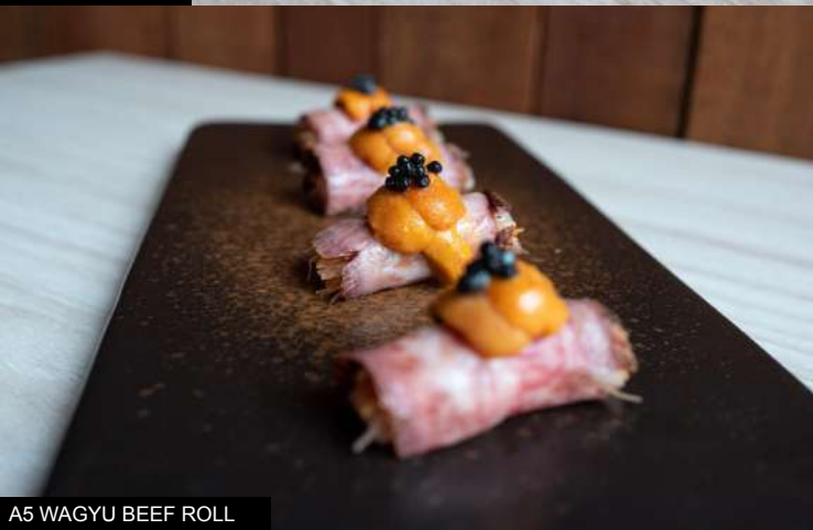
A5 WAGYU BEEF ROLL