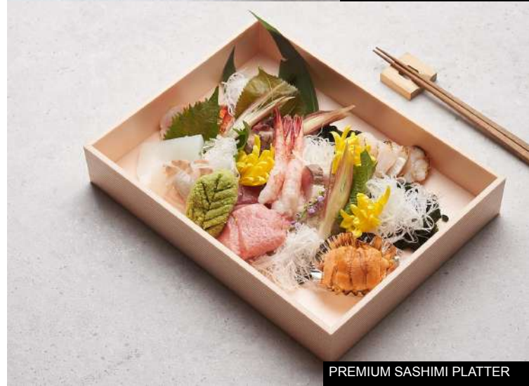
PREMIUM SASHIMI PLATTER