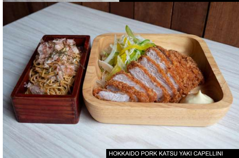
HOKKAIDO PORK KATSU YAKI CAPELLINI