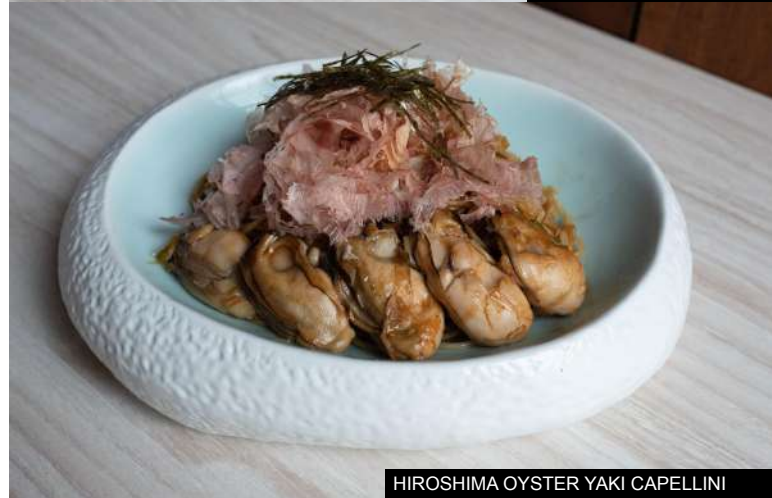
HIROSHIMA OYSTER YAKI CAPELLINI