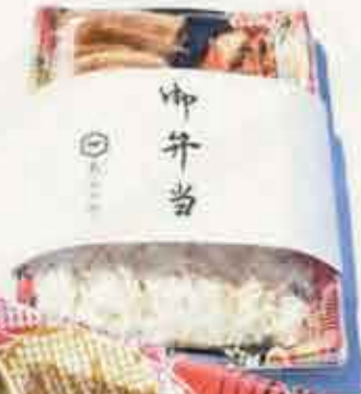
豚サーロイン弁当 BUTA SIRLOIN BENTO PORK SIRLOIN WITH RICE, SIDE DISHES & SOUP $12