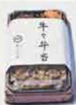
和牛 牛々弁当 (150g)