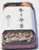
和牛 牛々弁当 (150g) WAGYU GYUGYU BENTO

BRAISED WAGYU BEEF (150g) WITH RICE, SIDE DISH & SOUP