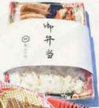
豚サーロイン弁当 BUTA SIRLOIN BENTO PORK SIRLOIN WITH RICE, SIDE DISHES & SOUP $12