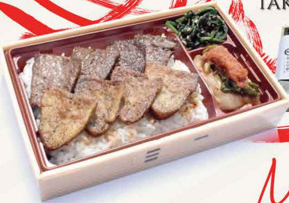
和牛赤身フォアグラ弁当 WAGYU AKAMI + FOIE GRAS BENTO

WAGYU LEAN MEAT + FOIE GRAS WITH RICE, SIDE DISHES & SOUP