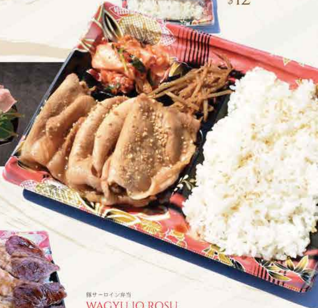
豚サーロイン弁当 WAGYU JO ROSU + BUTA SIRLOIN BENTO WAGYU JO ROSU + PORK SIRLOIN WITH RICE, SIDE DISHES & SOUP $21