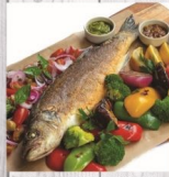
GRILLED SEABASS (WHOLE) $78