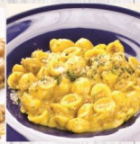
ORECCHIETTE PORK SAUSAGE $19