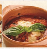
BAKED EGGPLANT PARMIGIANA $14