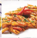
PASTA ALLA ARRABIATA $18