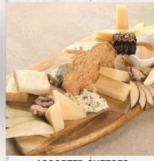
ASSORTED CHEESES $12 (S) / $28 (L)