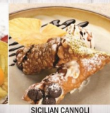
SICILIAN CANNOLI $12