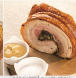
PORCHETTA BAKED PORK BELLY WILD FENNEL $9 (S) / $18 (L)