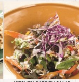
KITCHEN GARDEN SALAD $14