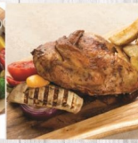
SPICY ROASTED FARM CHICKEN "ALLA" DIAVOLA - $22