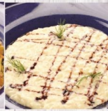
RISOTTO CASTELMAGNO CHEESE - $22