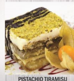
PISTACHIO TIRAMISU $14