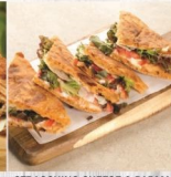
STRACCHINO CHEESE & PARMA HAM $10 (S) / $18 (L)