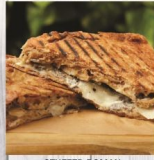
STUFFED ROMAN SCHIACCIATA WITH TRUFFLE $10 (S) / $18 (L)