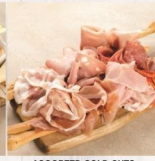
ASSORTED COLD CUTS SELECTION $14 (S) / $30 (L)