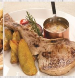
GRILLED PORK CHOPS, BEANS & PARMESAN - $22