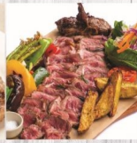
FLORENTINE T-BONE STEAK - $15 / 100G