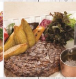
GRILLED US RIBEYE POTATOES $42