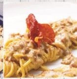
PASTA ALLA CARBONARA $24