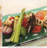
GRILLED FARMERS SALAD $16