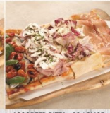
ASSORTED PIZZA - $9 / SLICE 4 FLAVOURS (M) @ $24 5 FLAVOURS (L) @ $29