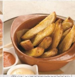
HAND CUT POTATOES ROCK SALT & ROSEMARY $9