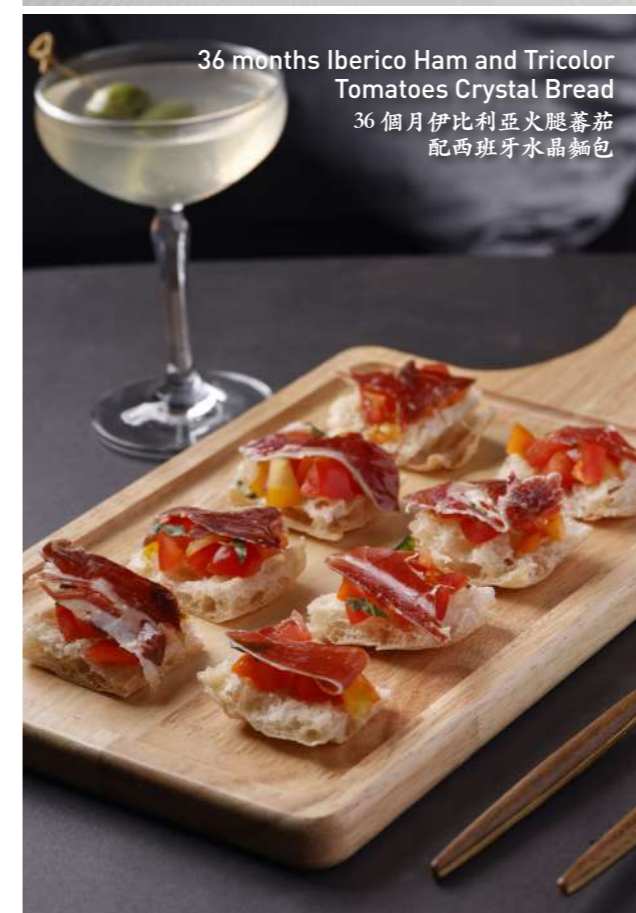
36 months Iberico Ham and Tricolor Tomatoes Crystal Bread 36 個月伊比利亞火腿蕃茄配西班牙水晶麵包