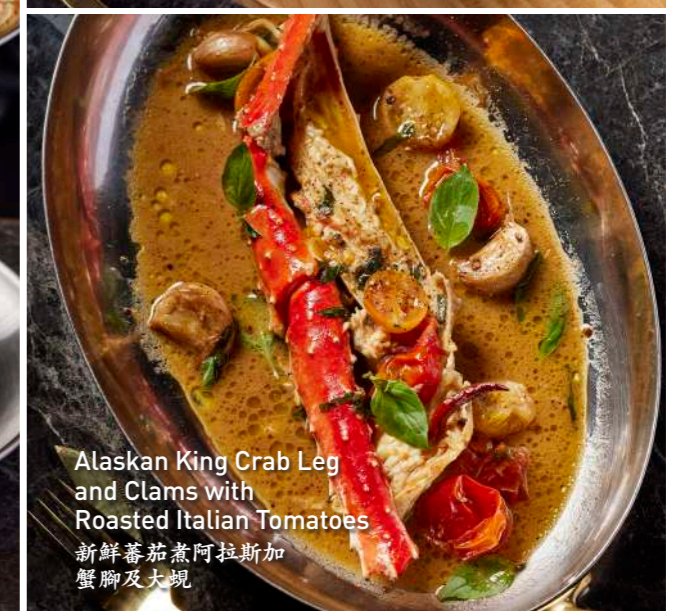
Alaskan King Crab Leg and Clams with Roasted Italian Tomatoes 新鮮蕃茄煮阿拉斯加蟹腳及大蜆