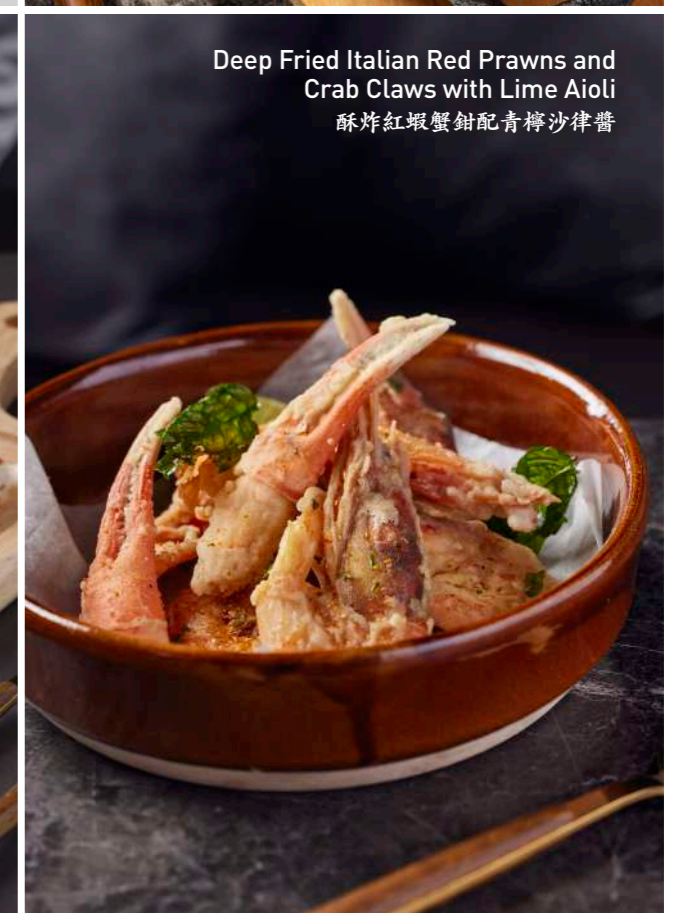
Deep Fried Italian Red Prawns and Crab Claws with Lime Aioli 酥炸紅蝦蟹鉗配青檸沙律醬