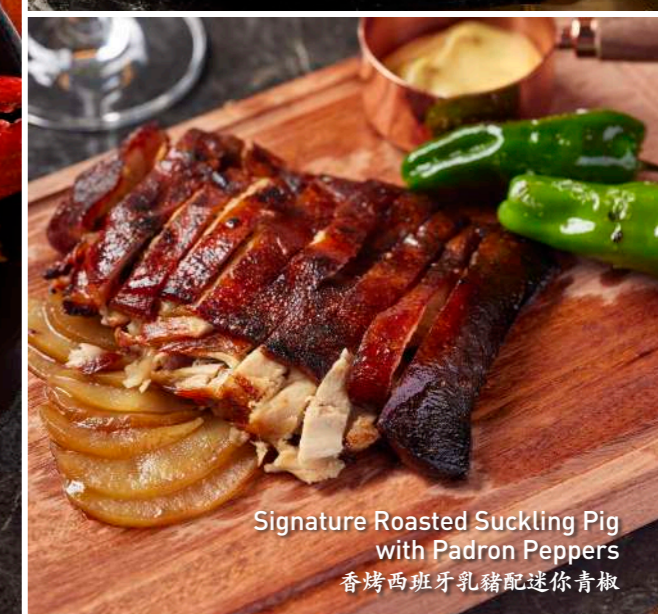
Signature Roasted Suckling Pig with Padron Peppers 香烤西班牙乳豬配迷你青椒