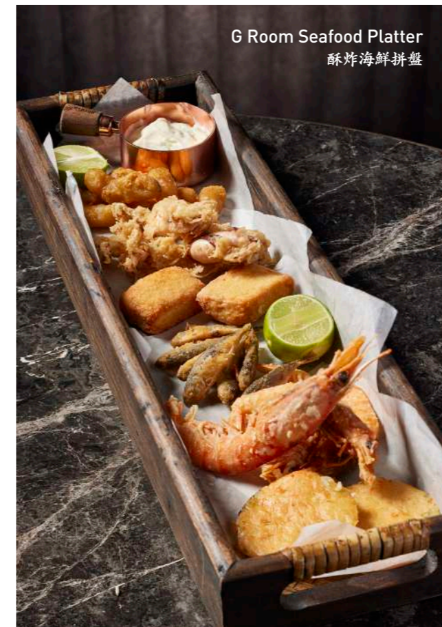
G Room Seafood Platter 酥炸海鮮拼盤