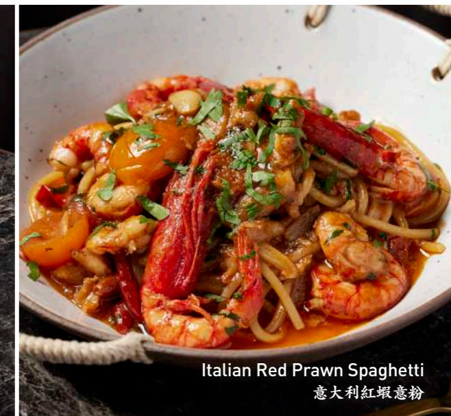
Italian Red Prawn Spaghetti 意大利紅蝦意粉