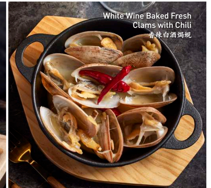
White Wine Baked Fresh Clams with Chili 香辣白酒焗蜆