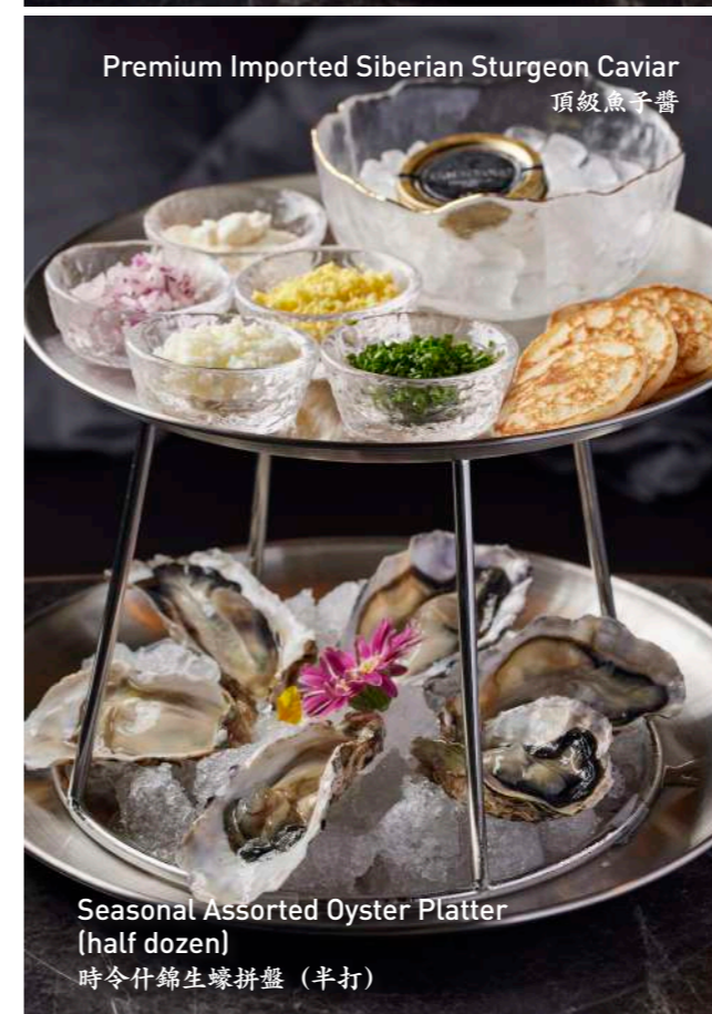
Premium Imported Siberian Sturgeon Caviar 頂級魚子醬