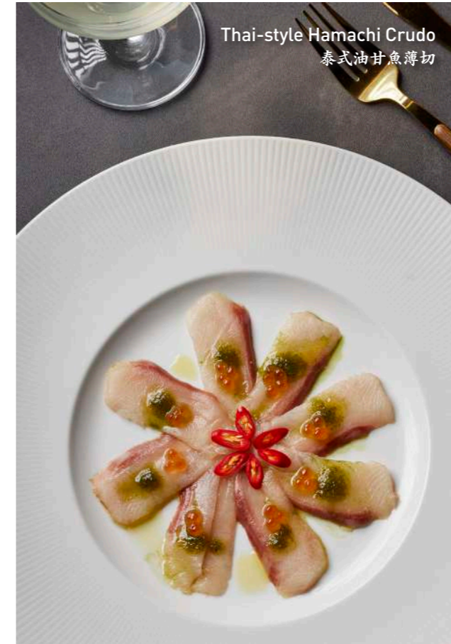
Thai-style Hamachi Crudo 泰式油甘魚薄切