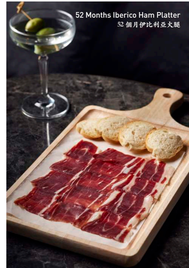
52 Months Iberico Ham Platter 52個月伊比利亞火腿