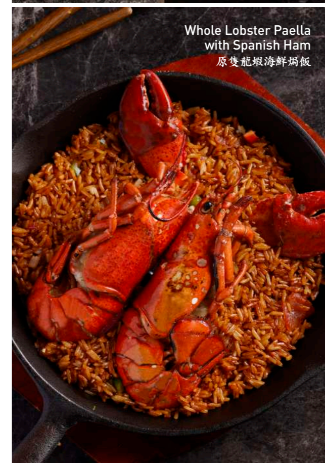
Whole Lobster Paella with Spanish Ham 原隻龍蝦海鮮焗飯