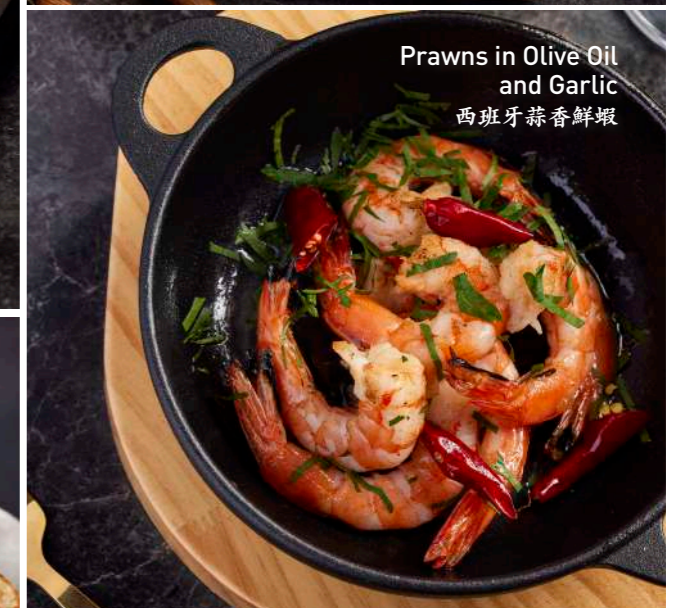
Prawns in Olive Oil and Garlic 西班牙蒜香鮮蝦