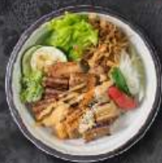
BUTA MISOZUKE YAKI DON (Grilled Marinated Pork Belly on the Rice Bowl) 98K*

ADDITIONAL MENU : Onsen Tamago 10K* | Natto 15K*