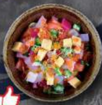
KAISEN BARACHIRASHI DON (Scattered Seafood Chirashi Sushi on the Rice Bowl) 158K*