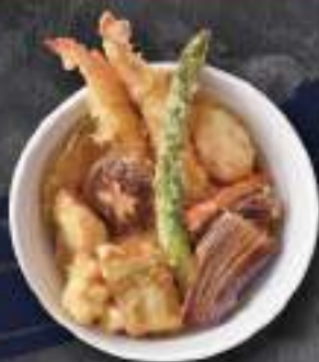
TENDON (Assorted Tempura on the Rice Bowl) 98K*