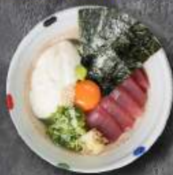
MAGURO TORORO DON (Tuna with Grated Yam on the Rice Bowl) 128K*