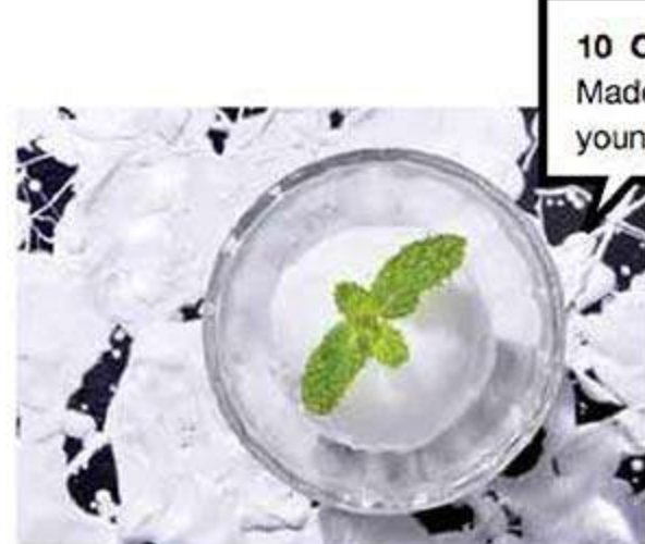
10 Coconut Ice Sherbet 42.000 Made from real coconut juice and young coconut meat.