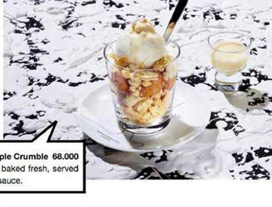
02 Fresh Made Apple Crumble 68.000 All made fresh and baked fresh, served with warm custard sauce.