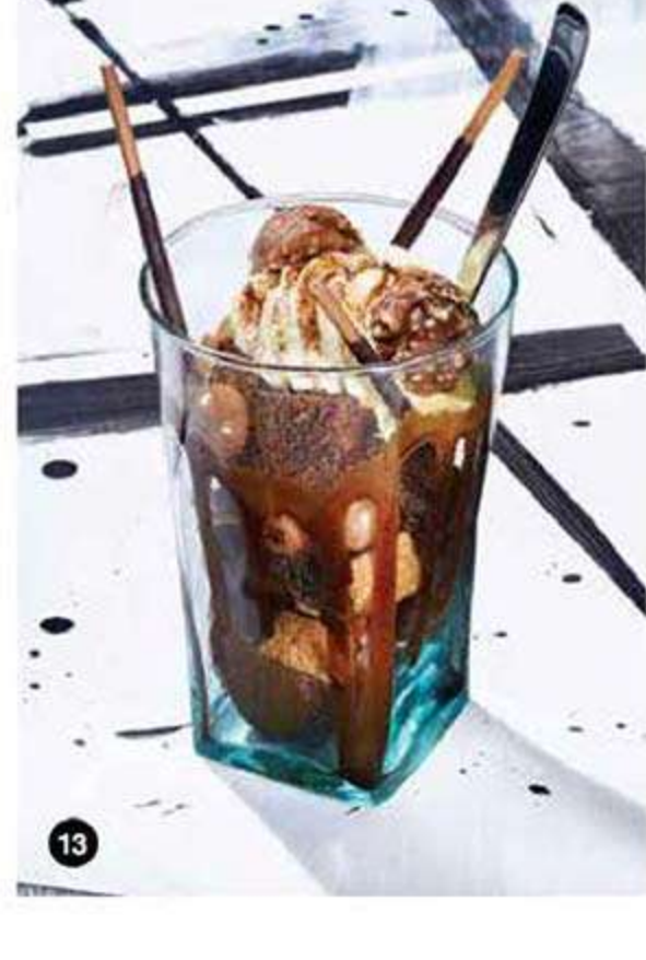
13 Chocolate Lover 62.000 Chocolate ice cream, chocolate sauce, cornflake, Malteser, brownies, Ferrero Rocher, Picco, whipped cream, cocoa dust.