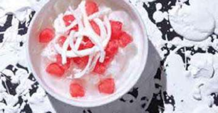
08 Tub Tim Krob Greyhound Style 48.000 Water chestnut - mini dumplings served with coconut sherbet and coconut meat topped with coconut cream. Very refreshing, very out of this world!