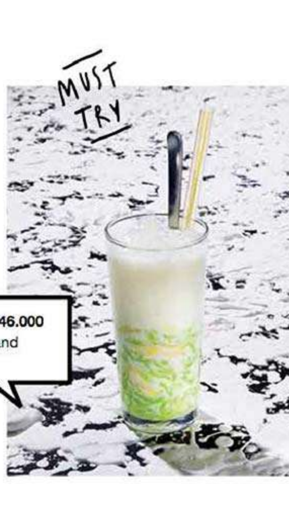
11 Lod Chong Singapore 46.000 Thai dessert with jackfruit and coconut milk.