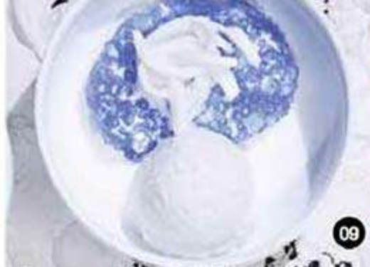
09 Sakoo Piek 48.000 Coconut sago with water chestnut, served with coconut sherbet.