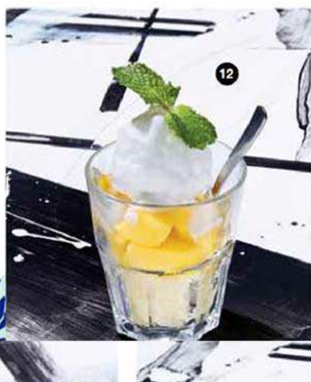
12 Sticky Rice + Mango 58.000 Coconut sherbet, coconut milk, sticky rice, and mango.