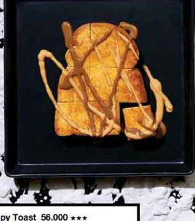
01 Happy Toast 56.000 *** Heavily buttered thick and chunky white or wheat toast, served with 5 very tasty toppings.