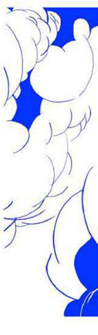
03 Chocolate Banana Crepe Cake 62.000 Light and thin crepes, layered with banana, custard and fresh cream, topped with chocolate sauce.