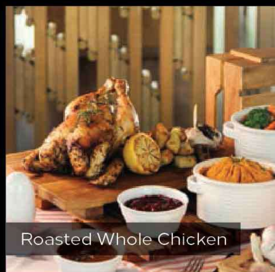
Roasted Whole Chicken

*Prices are in thousand Indonesian Rupiah