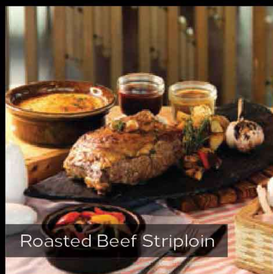
Roasted Beef Striploin