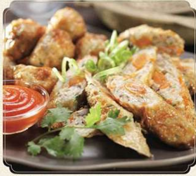
Lumpia crab mabuhay - 60.000 Deep fried crispy roll with vegetables, shredded crab meat and seafood fillings served with special dipping sauce