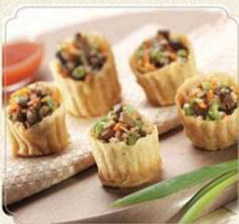
selat popia (kueh pie tee) - 62.000 Traditional crispy flour cup filled with mix of sautéed vegetables, seafood, chicken and mushroom