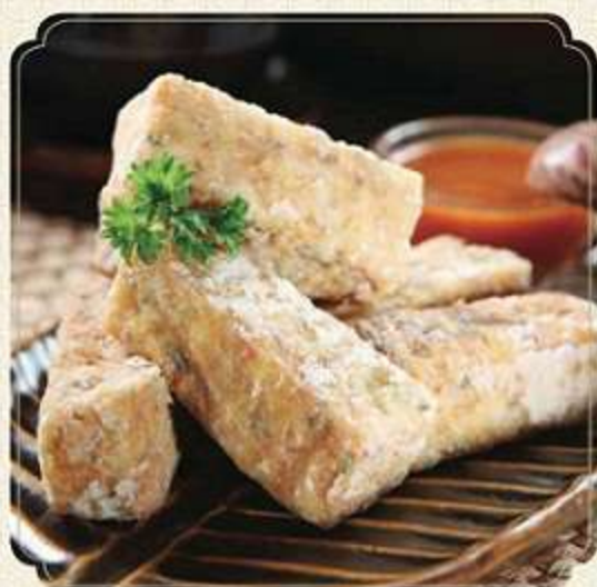
Deep fried tofu kinabalu - 63.000 Deep fried blend of homemade tofu, vegetables and salted fish served with chili dipping sauce