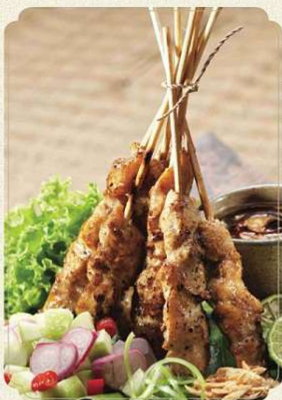
chicken satay nusantara - 72.000 BBQ skewered marinated chicken served with homemade peanut sauce and traditional chili soy sauce