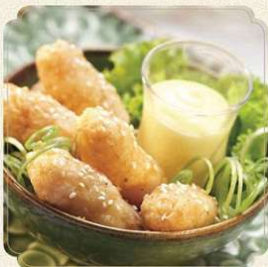
udang gulung tempoe docloe - 69.000 Fried oriental style prawn cake served with chef's special mayonnaise dressing