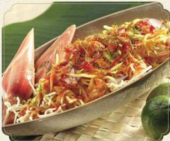
malay kesabi mangga - 59.000 Young mango salad dressed with traditional plum dressing, topped with crispy ebi