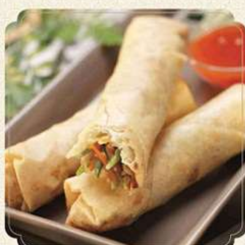
Hokkien spring roll - 62.000 Deep fried crispy roll made of rice flour wrapper filled with sautéed vegetables and diced chicken