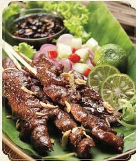
beef satay kotagede - 85.000 BBQ skewered marinated beef served with homemade peanut sauce and traditional chili soy sauce