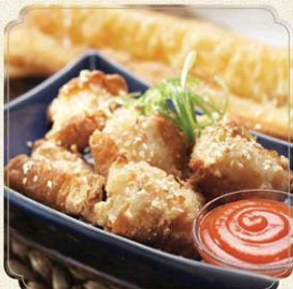
oriental seafood cakwee - 67.000 Fried traditional Chinese dough filled with ground squid and prawn, glazed with sweet and sour sauce