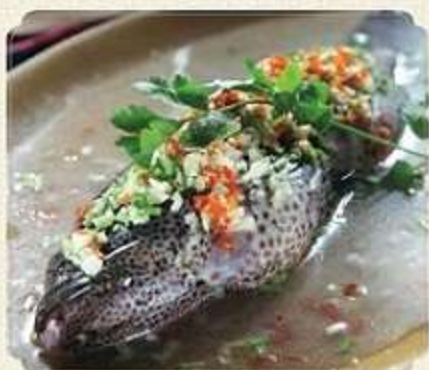
steamed fish sukhothai - market price Steamed tiger grouper or soon hock fish served with Thai lime sauce