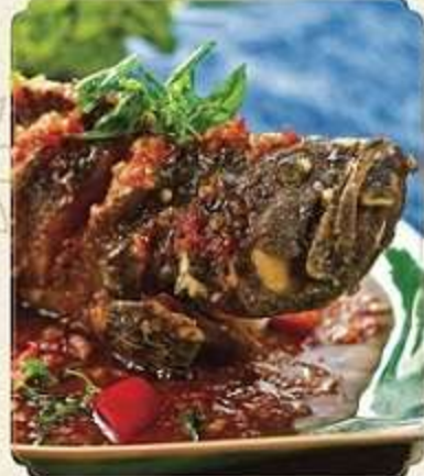
Jimbaran fried fish - market price Deep fried tiger grouper or soon hock fish dressed in Bali style sweet and spicy sauce