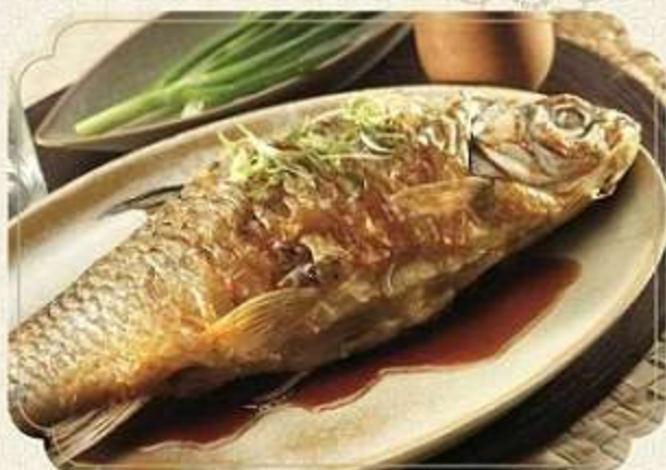
ried jurong tomiong - 55,000/100gr Deep fried rare jurong fish dressed with our chef's special mushroom soy sauce