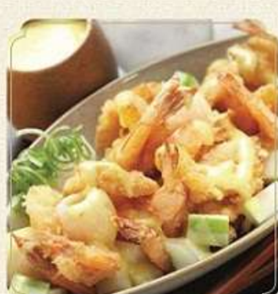
shrimp fruit salad - 97,000 Fried battered shrimp served with fresh fruit salad and mayonnaise dressing