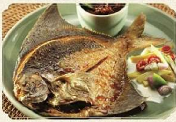
ried pomfret makassar - 61,000/100gr Deep fried pomfret dressed with tinge of Chef's special soy sauce and served with South Sulawesi style chili