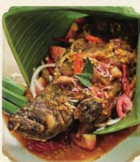
sambal fish ranjong kenoa - market price Banana leaf wrapped fried tiger grouper or soon hock fish covered in traditional chili sauce