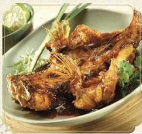
ried fish chef's special soya sauce - market price Deep fried choice of tiger grouper or soon hock fish served with Chef's special soy sauce