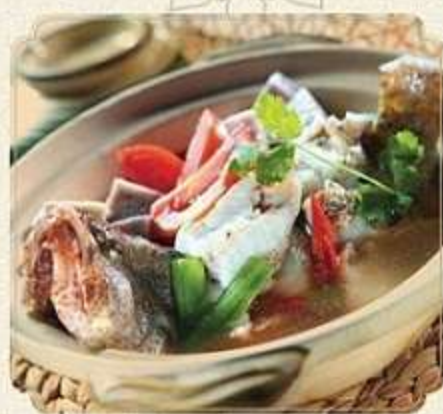
yam fish soup malacca - market price Choice of tiger grouper or soon hock fish cooked with yam in Malacca style clear soup