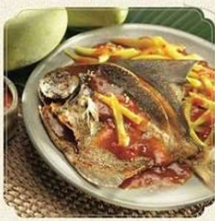
ried pomfret with mango sauce - 61,000/100gr Golden deep fried pomfret with our Chef's special sweet and sour mango sauce