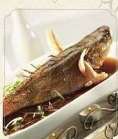
steamed fish chef's special soya sauce - market price Steamed tiger grouper or soon hock fish with chef's special homemade soy sauce