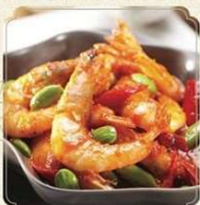
sambal udang bukit ringgi - 107,000 West Sumatra style chili prawn sautéed with petai (bitter bean)