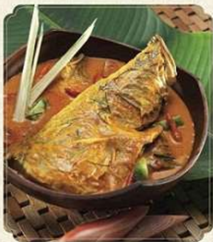
gulai fish-head rosik - 190,000 Head of snapper fish stewed in flavourful thick spicy and sour coconut milk gravy