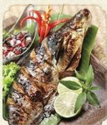
grilled "Bangkok" fish - 38,000/100gr BBQ Seasoned silver catfish served with traditional chili soy sauce