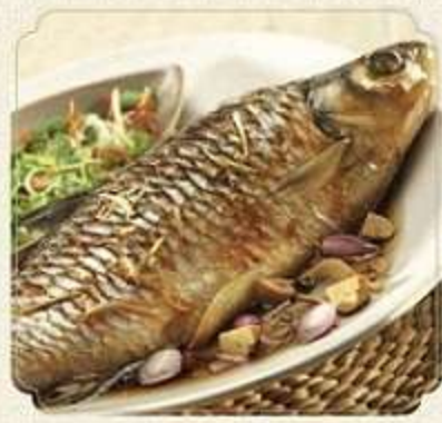
steamed jurong tomiong - 55,000/100gr Steamed rare jurong fish dressed with Chef's special flavourful mushroom soy sauce