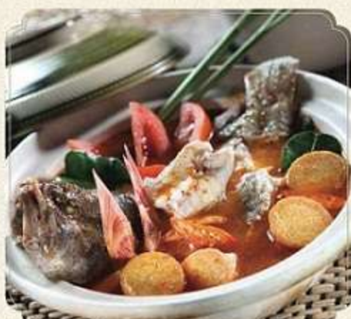
tom yam fish pattroya - market price Choice of tiger grouper or soon hock fish cooked in Thai style spicy and sour soup