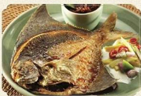
ried pomfret makassar - 61,000/100gr Deep fried pomfret dressed with tinge of Chef's special soy sauce and served with South Sulawesi style chili