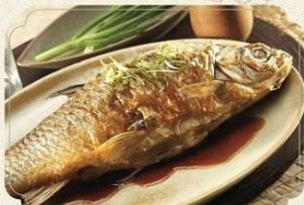
ried jurong tomiong - 55,000/100gr Deep fried rare jurong fish dressed with our chef's special mushroom soy sauce