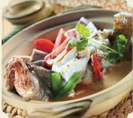
yam fish soup malacca - market price Choice of tiger grouper or soon hock fish cooked with yam in Malacca style clear soup