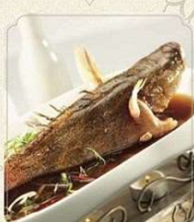
steamed fish chef's special soya sauce - market price Steamed tiger grouper or soon hock fish with chef's special homemade soy sauce