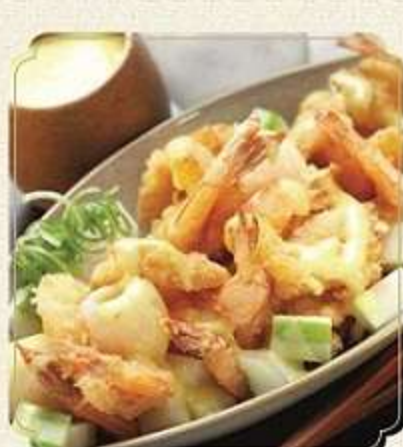
shrimp fruit salad - 97,000 Fried battered shrimp served with fresh fruit salad and mayonnaise dressing