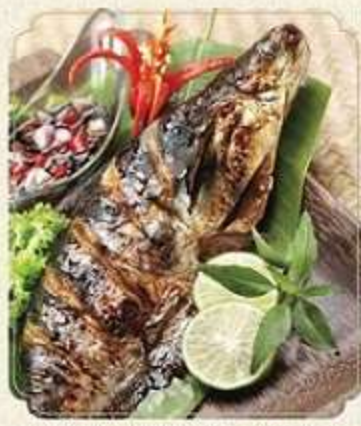
grilled "Bangkok" fish - 38,000/100gr BBQ Seasoned silver catfish served with traditional chili soy sauce