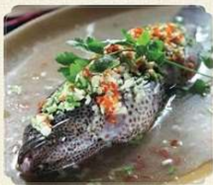
steamed fish sukhothai - market price Steamed tiger grouper or soon hock fish served with Thai lime sauce