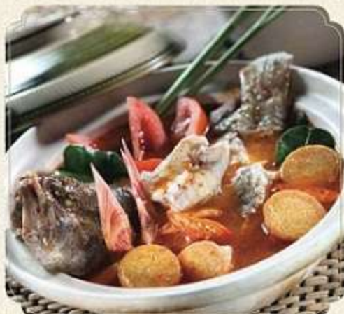
tom yam fish pattoya - market price Choice of tiger grouper or soon hock fish cooked in Thai style spicy and sour soup