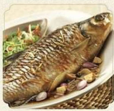
steamed jurong tomiong - 55,000/100gr Steamed rare jurong fish dressed with Chef's special flavourful mushroom soy sauce