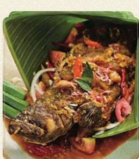
sambal fish ranjong kenoa - market price Banana leaf wrapped fried tiger grouper or soon hock fish covered in traditional chili sauce