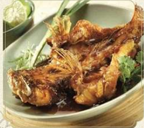
ried fish chef's special soya sauce - market price Deep fried choice of tiger grouper or soon hock fish served with Chef's special soy sauce