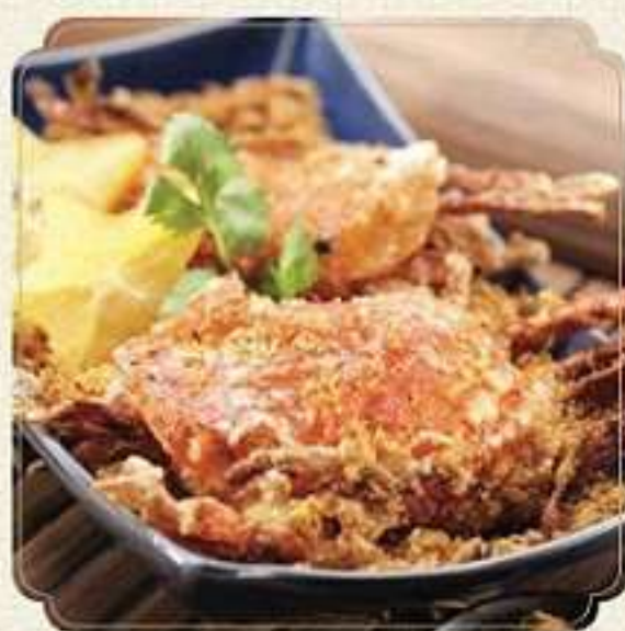
softshell crab with ebi floss - 110.000 Golden fried softshell crab sautéed in traditional ebi floss