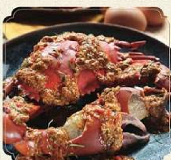
royal Thai chili crab - 48.000/100gr Crab prepared with royal Thai chili sauce recipe