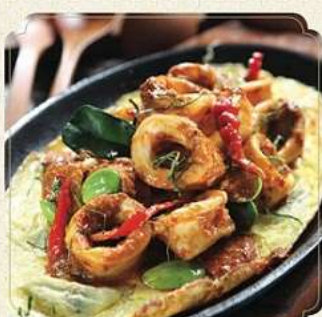
squid omelette pulau scribu - 91.000 Egg omelette topped with squid stir fried in traditional sweet and spicy sauce