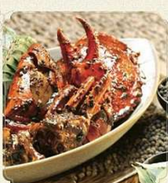
black pepper crab - 48.000/100gr Fried crab sautéed in our Chef's special black pepper sauce