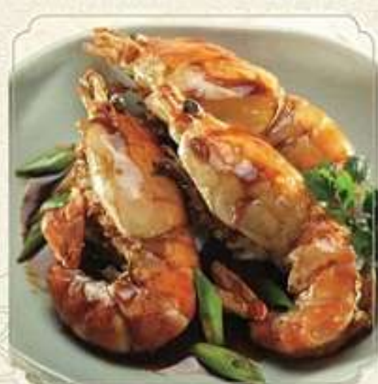
butter jumbo prawn pelabuhan - 115.000/piece (min 2 pcs) Fried jumbo prawn sautéed in Chef's special butter sauce