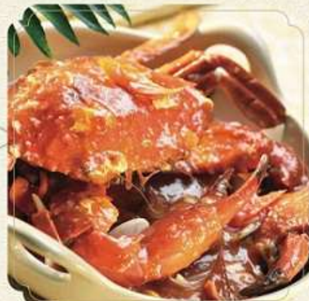
chili crab - 48.000/100gr Crab sautéed in popular chili sauce