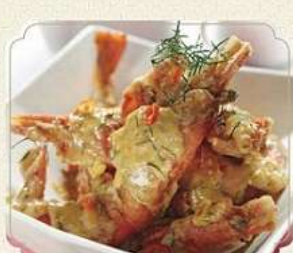
jumbo prawn golden egg yolk - 115.000 / pcs (min 2 pcs) Fried jumbo prawn with buttery egg yolk sauce