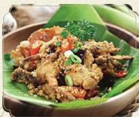
softshell crab na long bay - 110.000 Deep fried crispy soft-shell crab mixed with dry chili, garlic and spring onion, dressed with homemade sauce