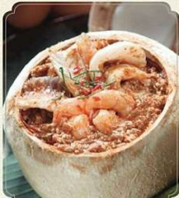
coconut seafood Andaman - 115.000 Mixed seafood cooked traditional Thai otak-otak style served in coconut