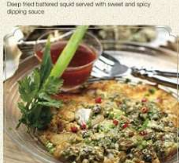
oyster omelette - 79.000 Egg omelette with oyster filling served with special dressing