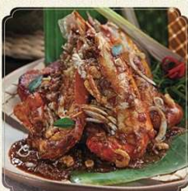
spicy curry jumbo prawn - 115.000/pcs (min 2 pcs) Jumbo prawn sautéed in our Chef's special curry sauce, sprinkled with crispy ebi