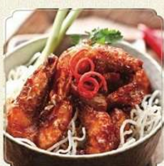
dark soy prawn langkawi - 110.000 Fried prawn sautéed in Chef's special Malay dark soy sauce