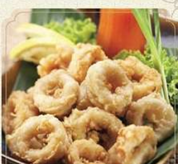
crispy fried squid - 83.000 Deep fried battered squid served with sweet and spicy dipping sauce