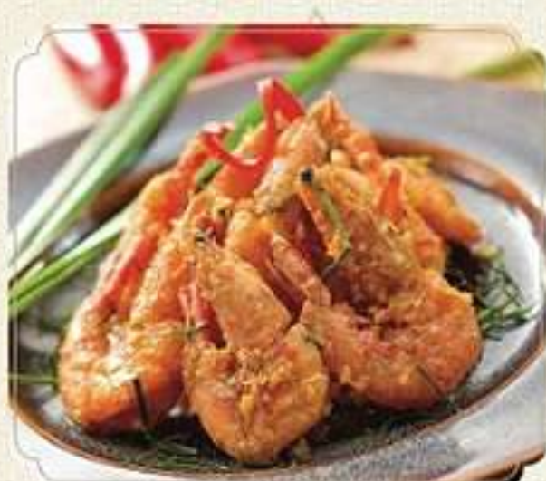
golden prawn siam style - 118.000 Fried prawn with Indochina style golden sautéed egg yolk sauce