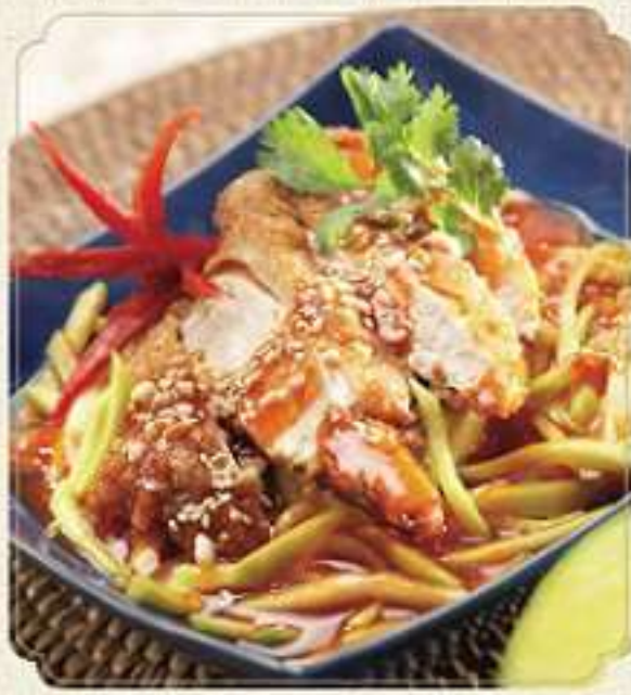
Fried chicken with mango sauce - 105,000 Crispy fried chicken dressed with our Chef's special mango sauce