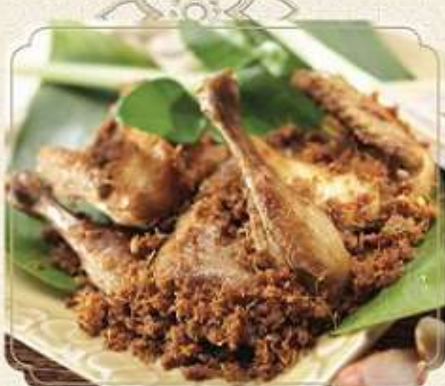
Ayam Goreng Lengkuas - 118,000 Fried chicken marinated in traditional galingal spices West Sumatra style