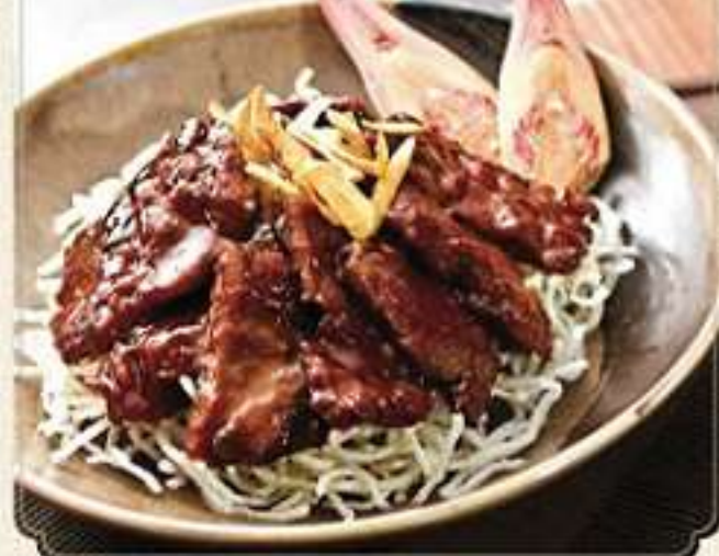
Nanking beef peranakan - 130,000 Australian beef stir-fried in old time favourite Nanking sauce