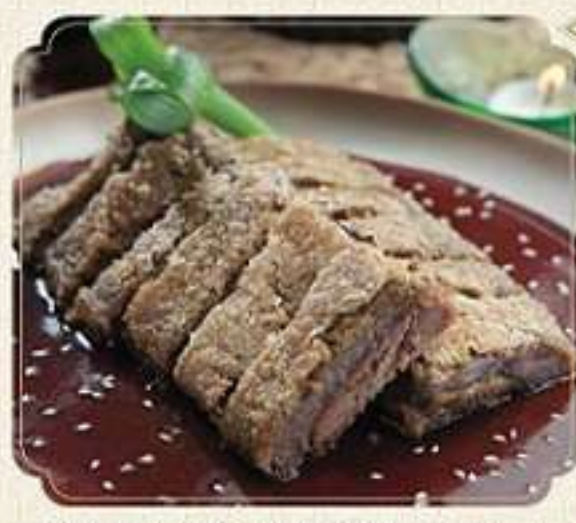
Vietnamese crispy yam duck - 130,000 Boneless duck covered with a crunchy yam crust, served over our special hoisin sauce