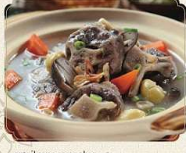
Oxtail soup peranakan - 160,000 Popular peranakan style oxtail soup served with belinjo nut crackers and chili sauce