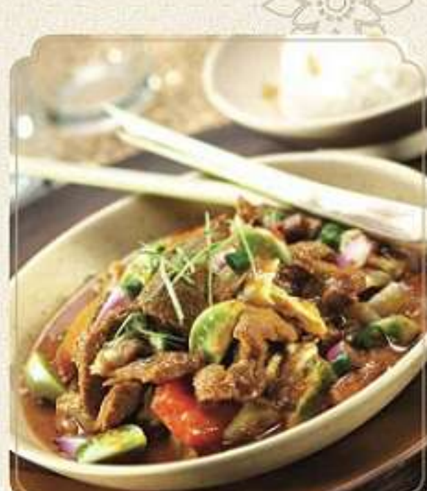
Rongseng tambing nrebes - 130,000 Lamb stewed with traditional spices and hint of twist soy sauce