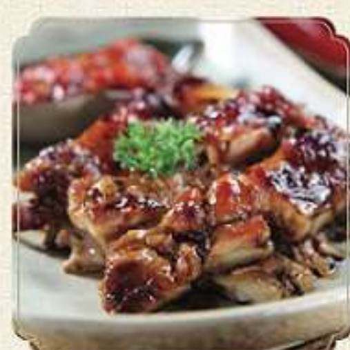
Thai Grilled chicken - 105,000 Grilled and marinated boneless chicken thigh in traditional Thai style