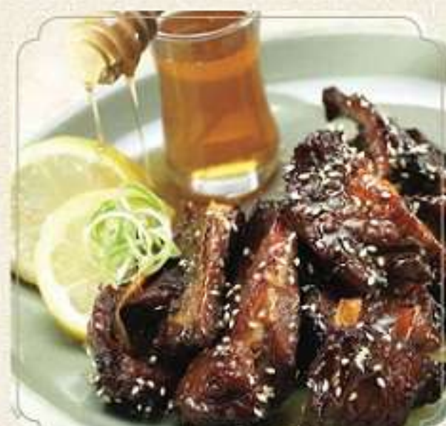
Lamb honey sauce - 135,000 Fried baby lamb ribs sauteed in Chef's special sauce