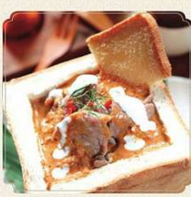
Kao samui red beef curry - 135,000 Beef stewed in traditional eastern Thai curry served in thick fried bread