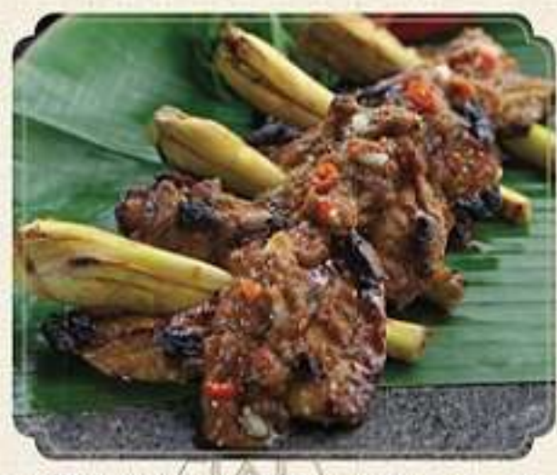
Grilled lemon grass chicken - 105,000 Grilled chicken, marinated in aromatic herbs served with satay sambal