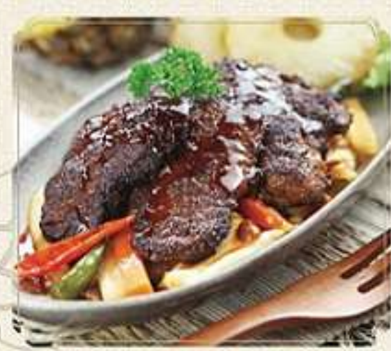
Grilled beef bojololi - 135,000 Grilled sirloin beef served with sauteed vegetables dressed with sweet and tangy sauce