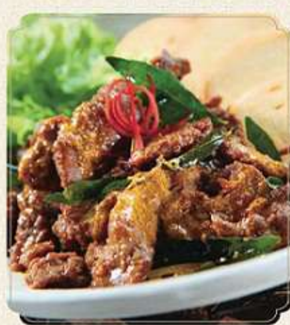
Standaling beef curry - 130,000 Traditional dried beef curry served with fried oriental bread (mantao)