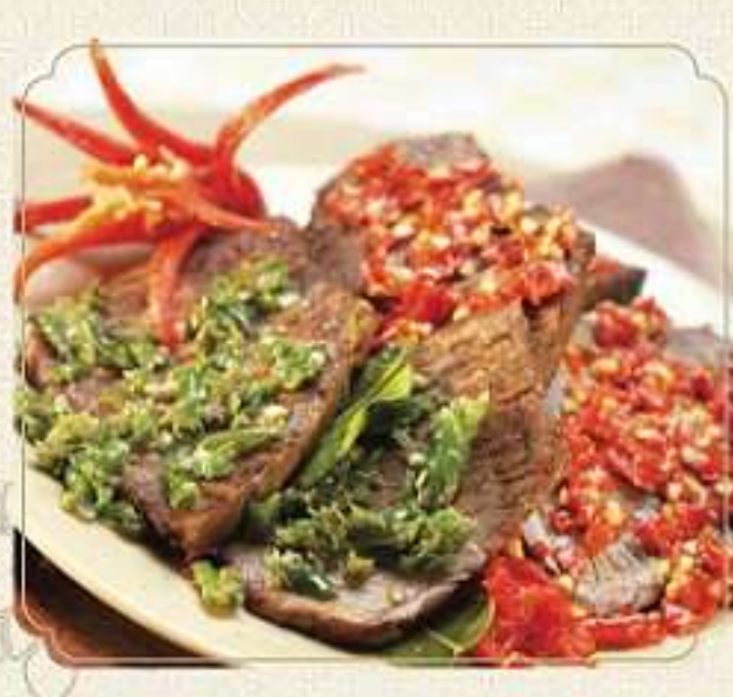
Bendeng balado dua rasa - 135,000 Seared marinated beef dressed with traditional green and red mild chili