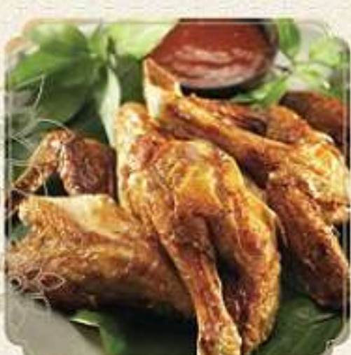
Binjai fried chicken - 118,000 Fried chicken marinated in traditional spices in Binjai style, served with special dipping sauce