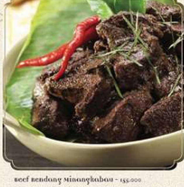
Beef rendang minangkabau - 155,000 Popular North Sumatra slow cooked beef with blend of spices paste and coconut milk