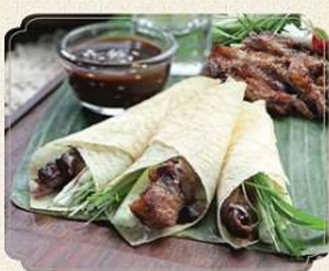
Yangoon crispy duck - 130,000 Duck conit & spring onion, wrapped in a thin omlette with chinese barbecue dipping sauce