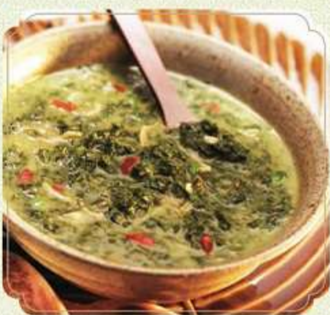
daun singkong tumbuk - 62.000 Minced cassava leaf braised in traditional thick coconut milk