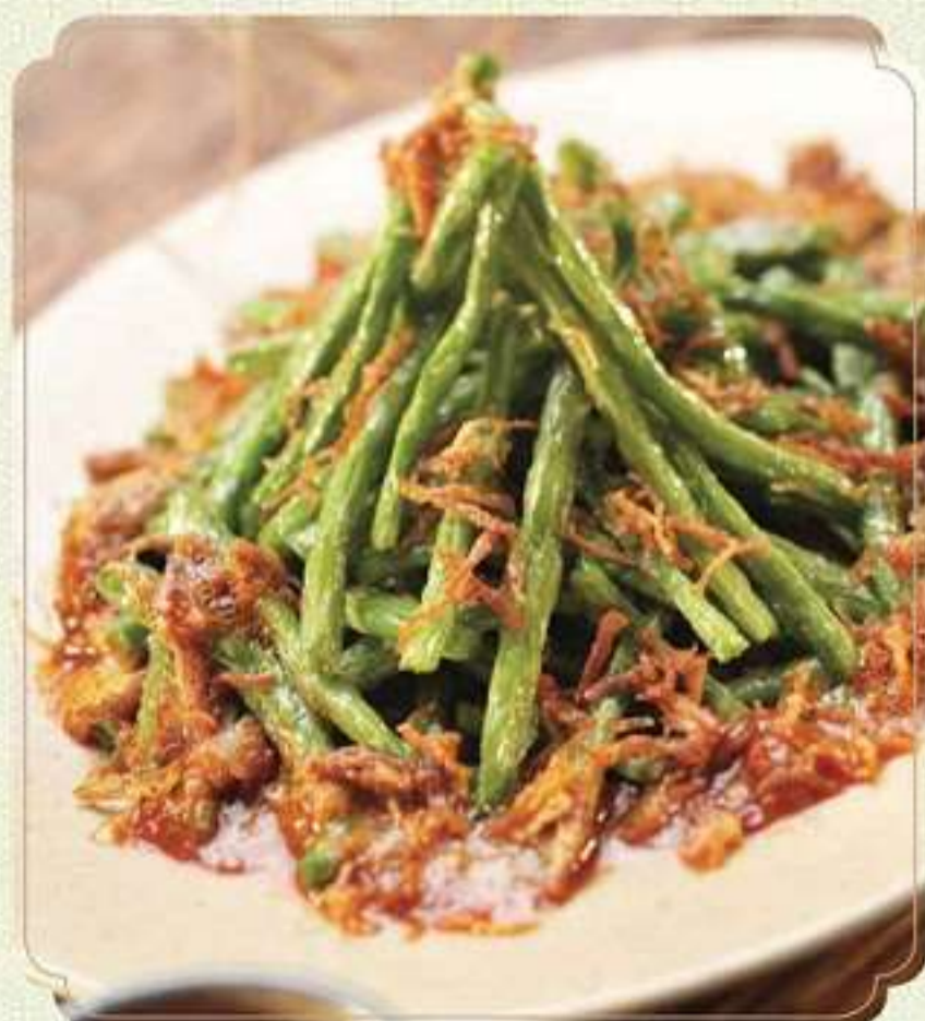
dried scallop string bean - 70.000 String bean sautéed with dried scallop chili sauce