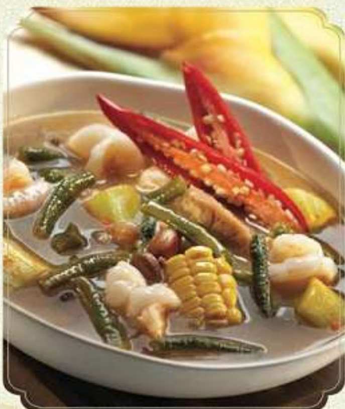
sayur asam batavia - 62.000 Spicy and sour clear vegetable soup with mix shrimp, sweet corn, long bean and melinjo nut