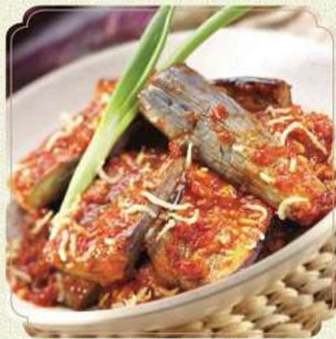
terong balado - 67.000 Fresh Indonesian eggplant with Chef's special balado sauce