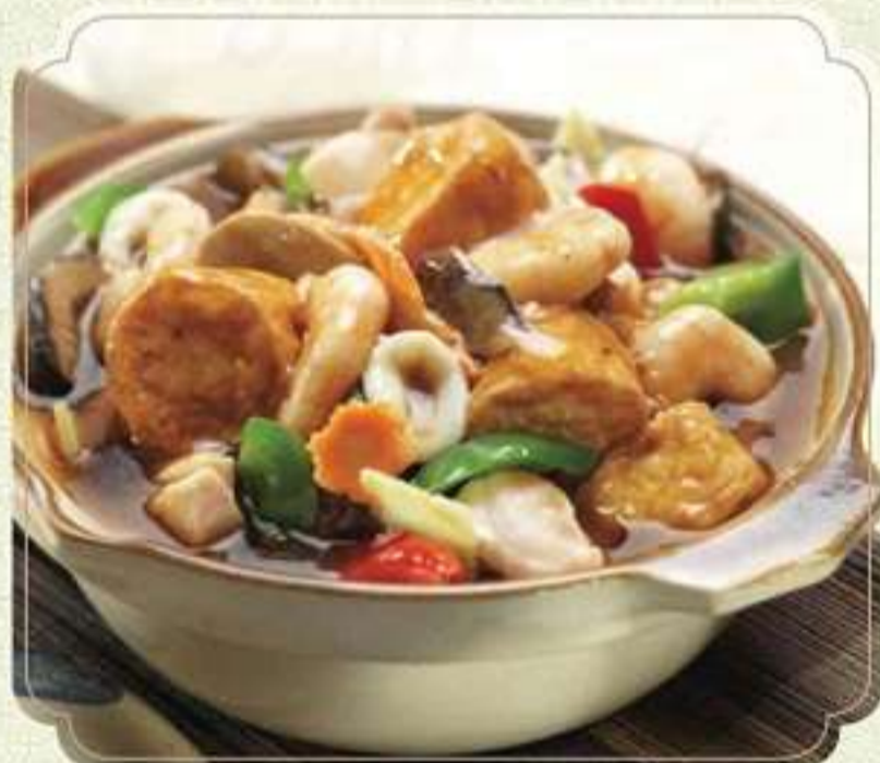
claypot tofu seribu rasa - 79.000 Braised tofu, seafood, vegetable and mushroom with oyster sauce