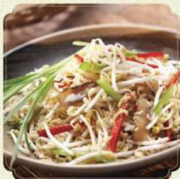
salted fish bean sprout - 62.000 Bean sprout stir fried with traditional dried salted fish