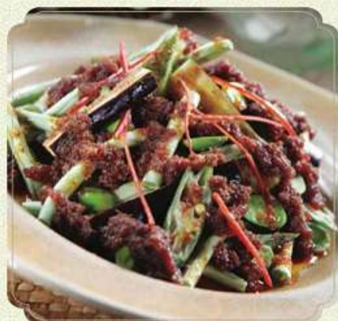
tumis sayuran sambal ebi - 69.000 Sautéed mix of string bean, lady fingers, eggplant and bitter bean in dried shrimp chili sauce