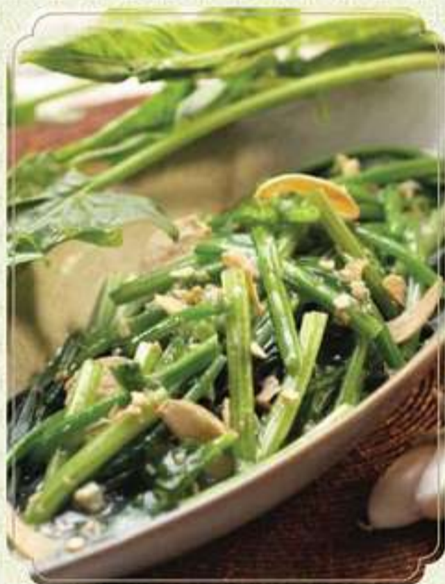
garlic poiling - 62.000 Chinese spinach sautéed with garlic