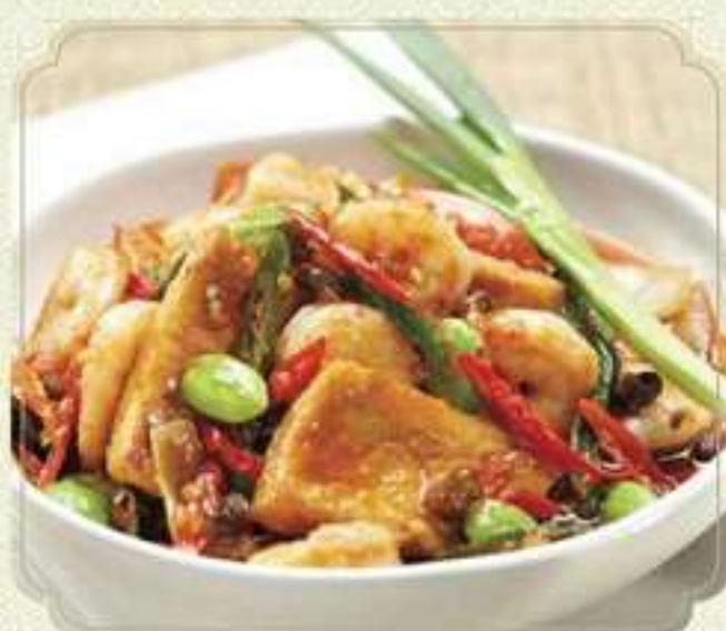
tauco tahu udang - 73.000 Beancurd, prawn and bitter melon sautéed with fermented bean chili sauce