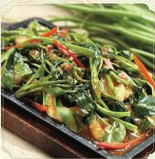
kangkung balachan hotplate - 67.000 Sautéed morning glory with prawn and quail egg in traditional shrimp paste