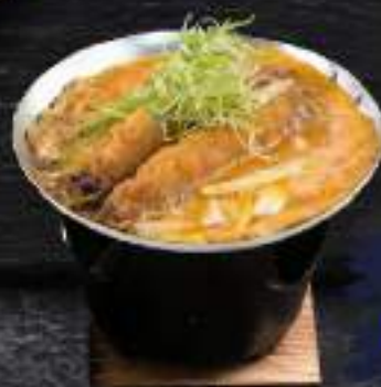
EBI KATSU DON (Prawn Cutlet with Egg & Vegetables on the Rice Bowl) 128K*