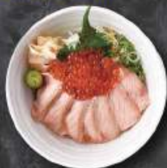
SALMON IKURA OYAKO DON (Salmon & Salmon Roe on the Rice Bowl) 178K*