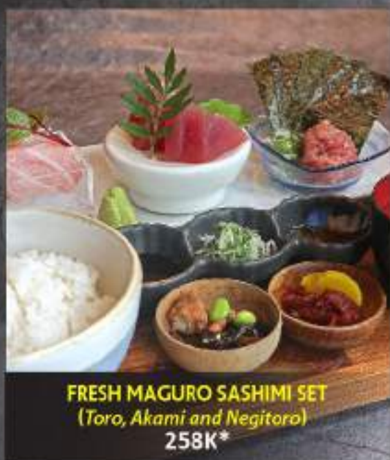
FRESH MAGURO SASHIMI SET (Toro, Akami and Negitoro) 258K*