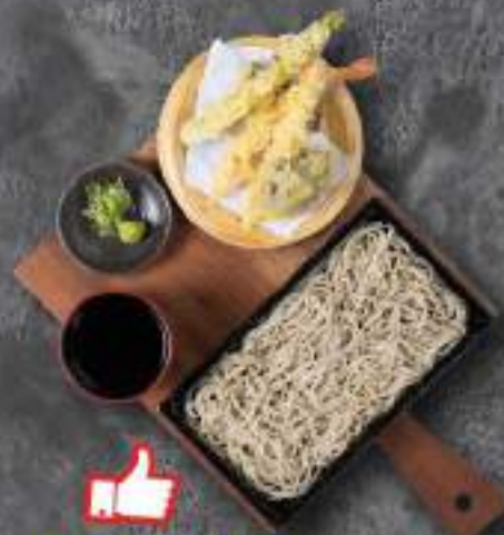
TEMPURA SOBA (COLD / HOT) (Traditional Japanese Soba with Assorted Tempura) 158K*