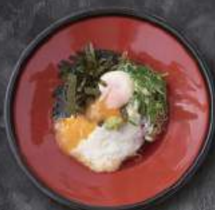
BUKKAKE TORORO SOBA (COLD) (Cold Soba with Grated Mountain Yam & Half Boiled Egg) 148K*