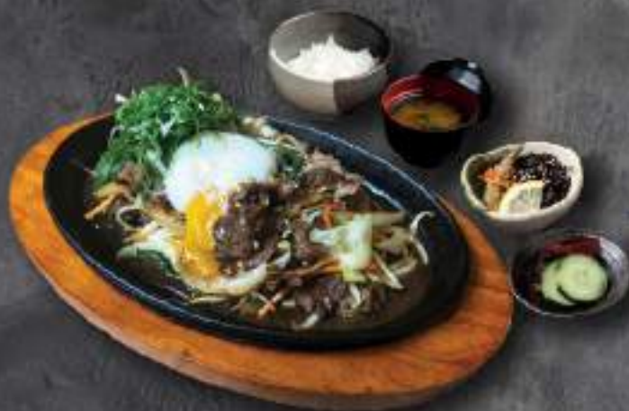
BEEF KARUBI YAKINIKU SET (Stir Fried Beef Short Ribs & Veggie with Special Sauce) 108K*