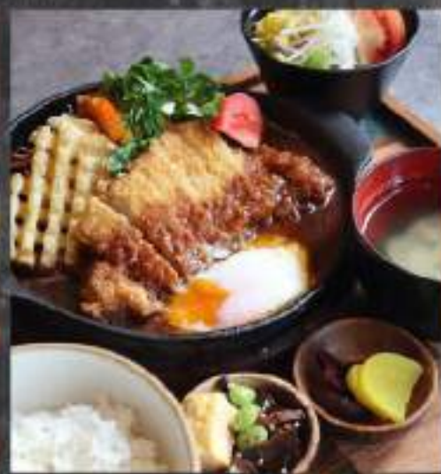
DEMI KATSU SET (Pork Cutlet with Demi-glaze sauce) 168K*