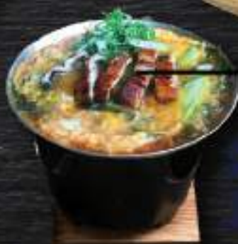
UNAGI & EGG DON (Grilled Marinated Eel with Egg & Vegetables on the Rice Bowl) 158K*