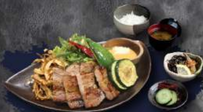
BUTA YAKUMO MISOZUKE YAKI SET (Charcol Grilled Pork Miso Marinated Set Meal) 108K*