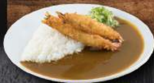
EBI KATSU CURRY (Prawn Cutlet on the Beef Curry Rice) 118K*