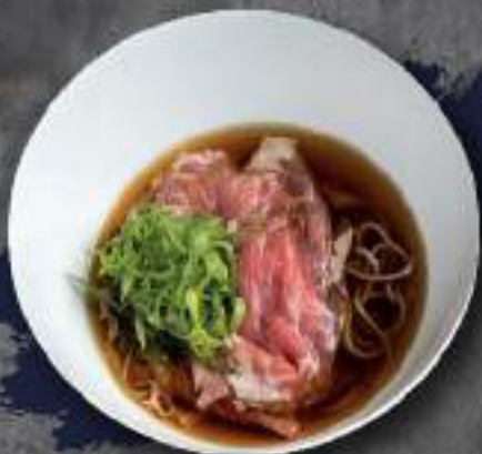
SHABU SHABU SOBA (HOT) (Hot Soba with Beef Shabu Shabu) 158K*