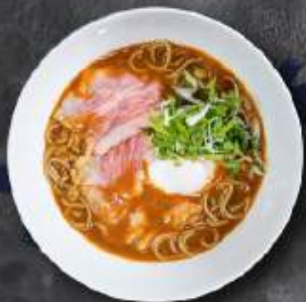
SHABU SHABU CURRY SOBA (HOT) (Hot Curry Soba with Beef Shabu Shabu) 158K*