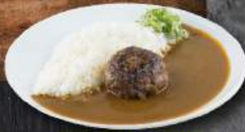
BEEF HAMBURG CURRY (Beef Hamburg on the Beef Curry Rice) 148K*