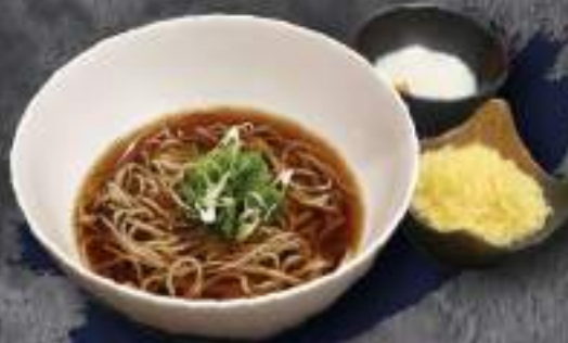
KAKE SOBA / CURRY SOBA (HOT) (Traditional Japanese Hot Soba) 88K*