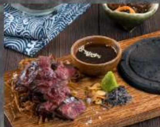
BEEF HARAMI STEAK SET (Charcoal Grilled US Outside Skirt Steak Set Meal) 178K*