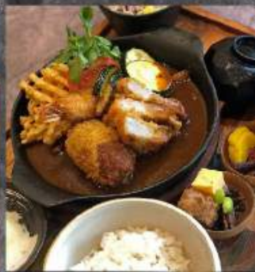
MIX DEMI KATSU SET (Mix Cutlet with Demi-glaze sauce) 188K*