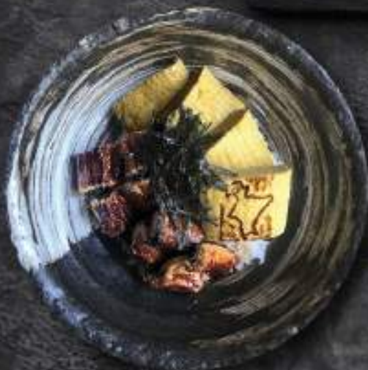
UNAGI DON (Grilled Marinated Eel with Omelette on the Rice Bowl) 198K*