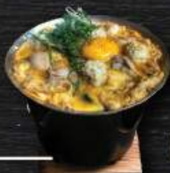
OYAKO DON (Chicken with Egg & Vegetables on the Rice) 98K*