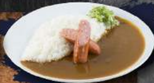
PORK SAUSAGE CURRY (Pork Sausage on the Beef Curry Rice) 108K*