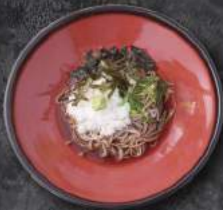
BUKKAKE OROSHI SOBA (COLD) (Cold Soba with Grated Raddish) 98K*