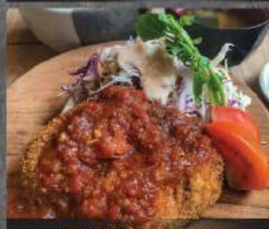
BEEF MINCED KATSU SET (Minced Beef & Cheese Cutlet Set Meal) 98K*

* All prices are in Thousand Rupiah excluding Service Charge 8% and Government Tax 10%