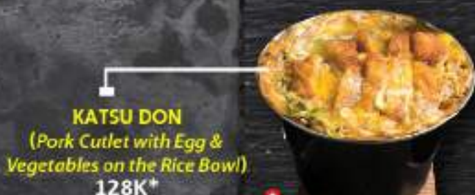
KATSU DON (Pork Cutlet with Egg & Vegetables on the Rice Bowl) 128K*