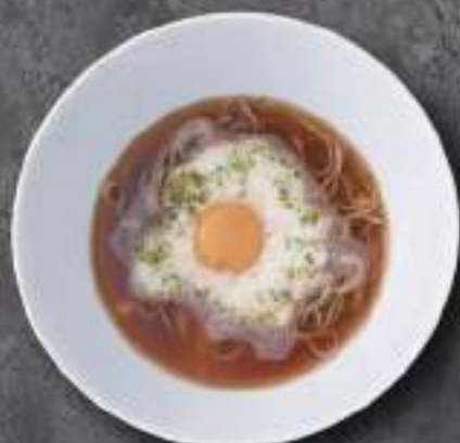
TSUKIMI TORORO SOBA (HOT) (Hot Soba with Grated Mountain Yam & Egg Yolk) 148K*