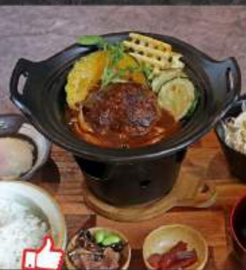
NIKOMI HAMBURG STEAK SET (Stewed Hamburg with Demi-glaze sauce) 168K*