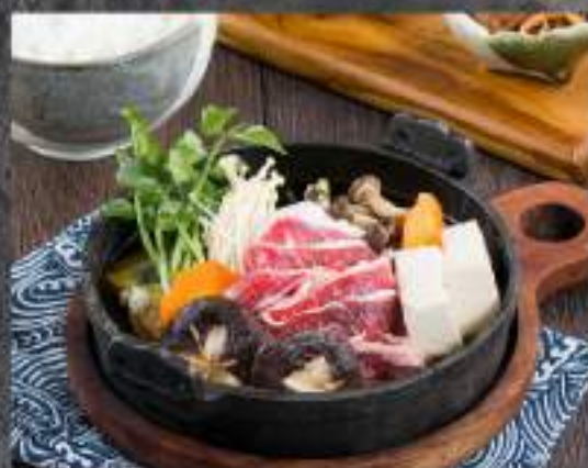
GYU SUKIYAKI SET (Australia Beef Wagyu Sukiyaki Set Meal) 188K*

ADDITIONAL MENU : - Yamatoimo Tororo 40K* - Onsen Tamago 10K* - Sashimi Small Plate 58K* - Natto 15K*