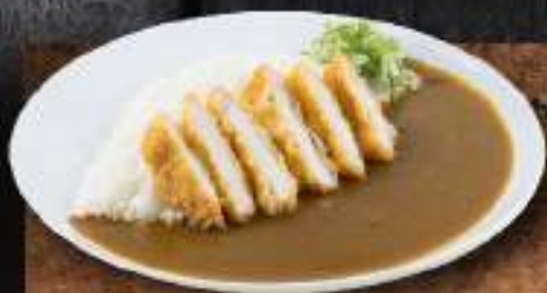
PORK KATSU CURRY (Pork Cutlet on the Beef Curry Rice) 128K*