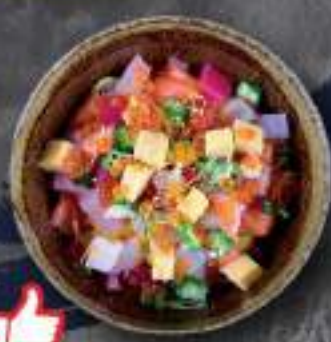
KAISEN BARACHIRASHI DON (Scattered Seafood Chirashi Sushi on the Rice Bowl) 158K*