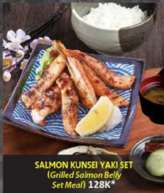
SALMON KUNSEI YAKI SET (Grilled Salmon Belly Set Meal) 128K*