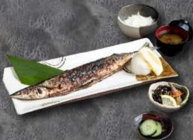
SANMA SHIOYAKI SET (Grilled Pacific Saury Set Meal) 98K*