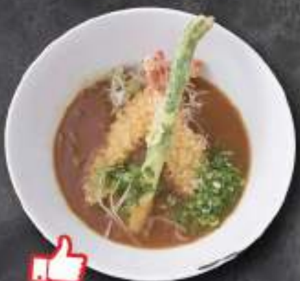
EBI TEMPURA CURRY SOBA (HOT) (Hot Curry Soba with Prawns & Veggie Tempura) 158K*