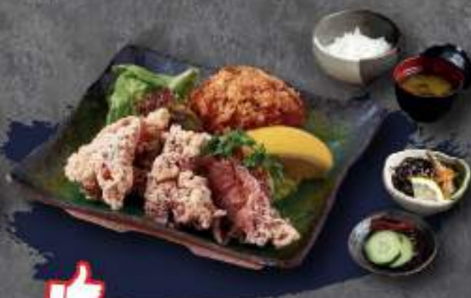
TORI ZANGI & HOMEMADE POTATO CROQUETTE (Fried Chicken & Hokkaido Potato Croquette Set Meal) 88 K*