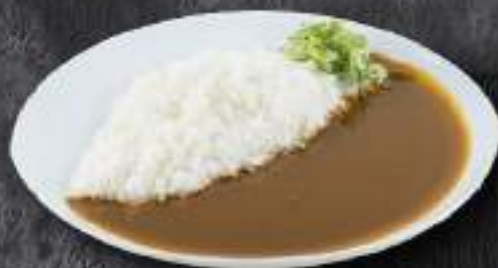
HOMEMADE BEEF CURRY 78K*