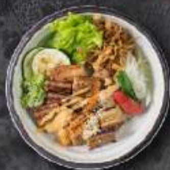
BUTA MISOZUKE YAKI DON (Grilled Marinated Pork Belly on the Rice Bowl) 98K*

ADDITIONAL MENU : Onsen Tamago 10K* | Natto 15K*