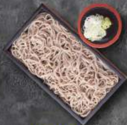
ZARU SOBA (COLD) (Traditional Japanese Cold Soba Dipped in Soba Sauce) 88K*