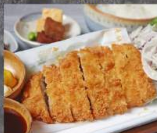
TONKATSU SET (Pork Cutlet Set Meal) 128K*