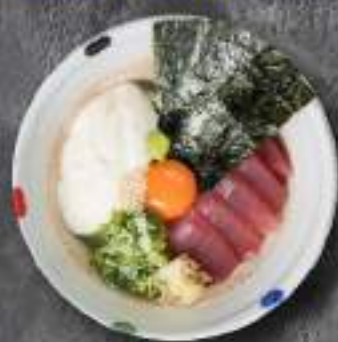
MAGURO TORORO DON (Tuna with Grated Yam on the Rice Bowl) 128K*