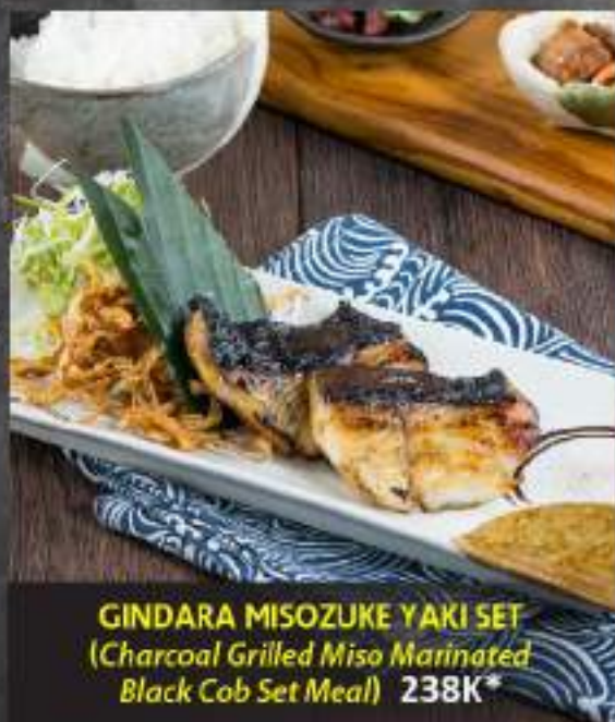
GINDARA MISOZUKE YAKI SET (Charcoal Grilled Miso Marinated Black Cob Set Meal) 238K*