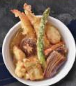
TENDON (Assorted Tempura on the Rice Bowl) 98K*