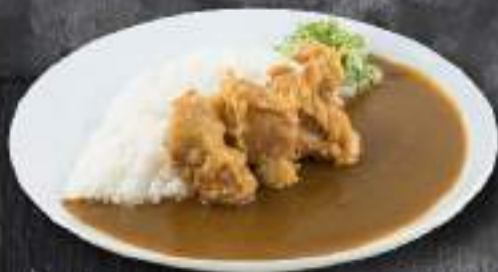
TORI ZANGI CURRY (Hokkaido Style Fried Chicken on the Beef Curry Rice) 98K*