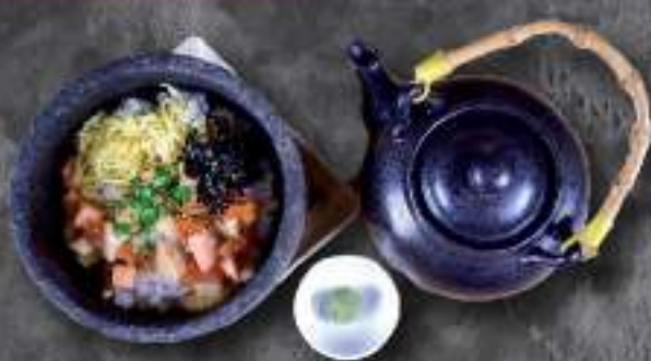
ISHIYAKI HOKKAIDO HITSUMABUSHI (Stone Roasted Cooked Mix Rice with Hokkaido Seafood) 128K*