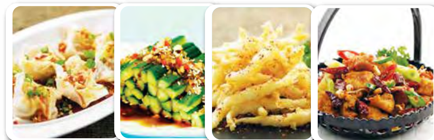
B12 Pork Dumplings w Chilli Sauce 红油抄手 $7.80