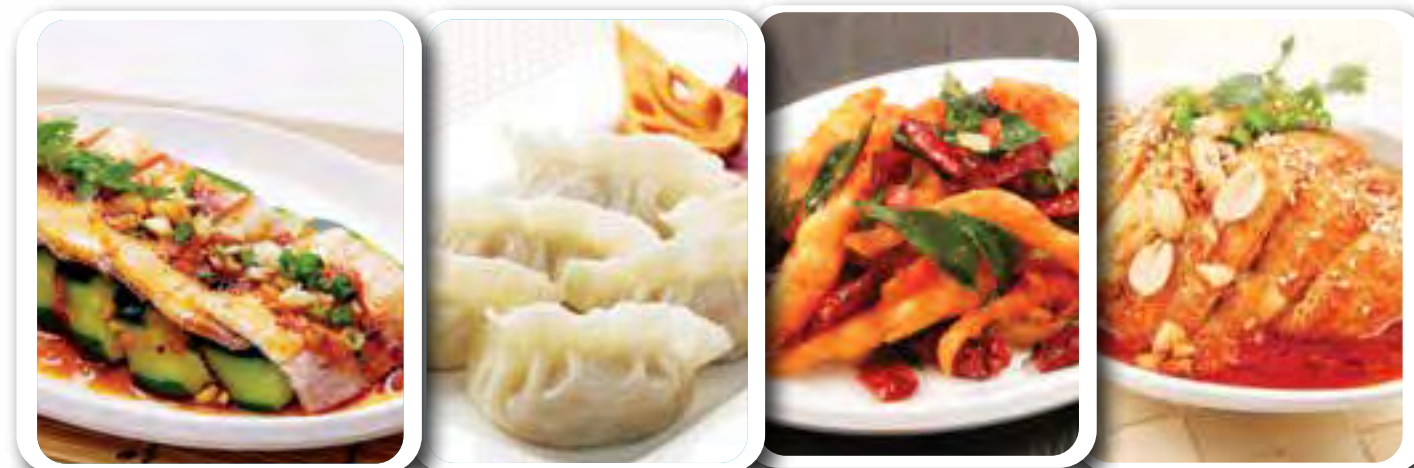
B5 Spicy Sliced Pork Belly Salad 蒜茸白肉 $8.50