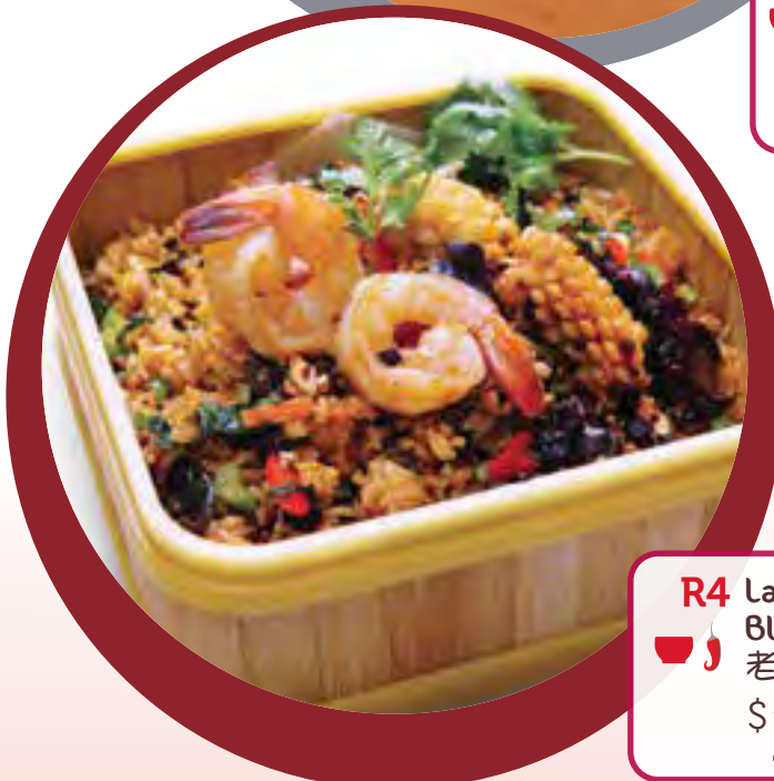
R4 Lao Gan Ma Spicy Black Bean Fried Rice 老干妈海鲜炒饭 $10 80