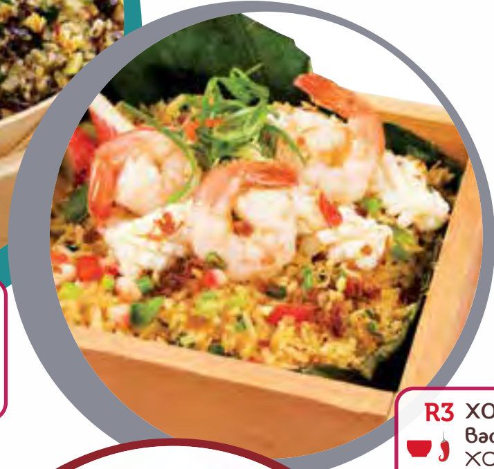
R3 XO Seafood Bacon Fried Rice XO酱海鲜炒饭 $10 80