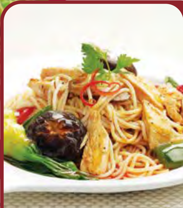
$9 80 | N5 3 Cups Chicken with Fried Yunnan Noodles 三杯鸡炒米线