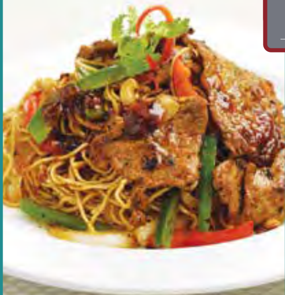
$10 80 | N6 Black Pepper Beef Fried Noodles 黑胡椒牛肉面