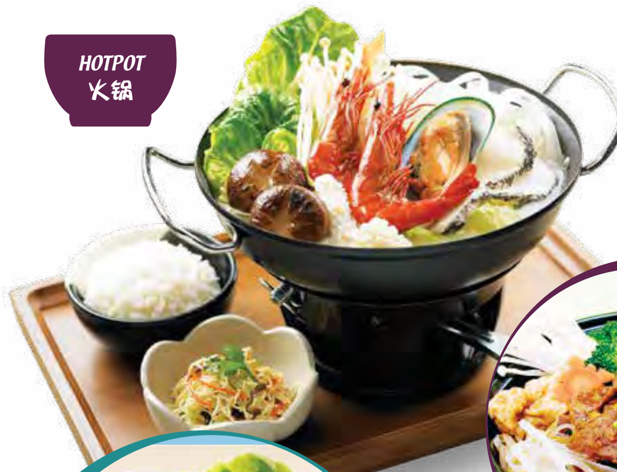
H1 Hotpot Seafood Set 海鲜火锅套餐 $15 80