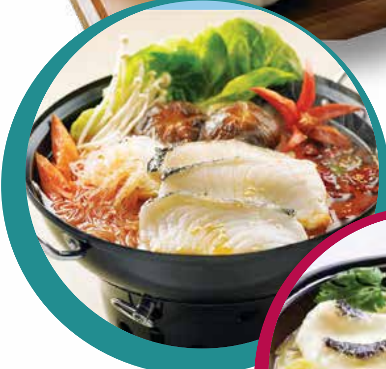
H3 Hotpot Ma La Sliced Fish Set 水煮鱼片火锅套餐 $15 80