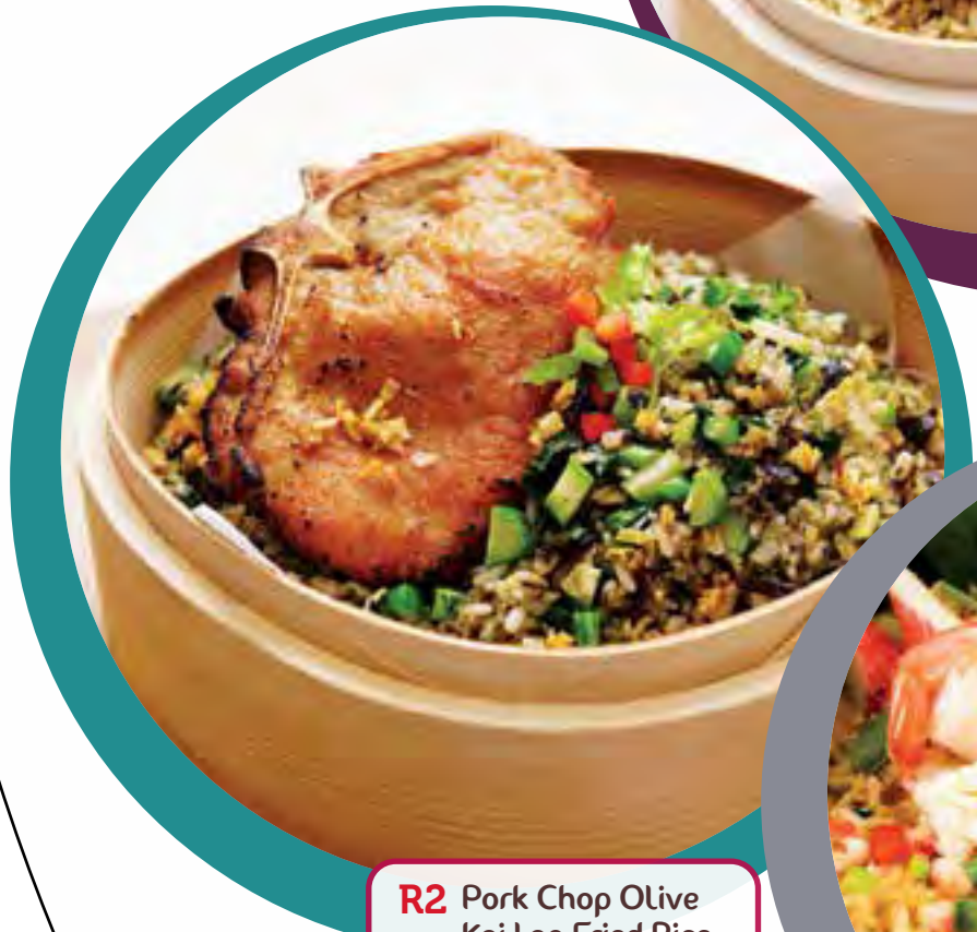
R2 Pork Chop Olive Kai Lan Fried Rice 猪扒橄榄炒饭 $11 80