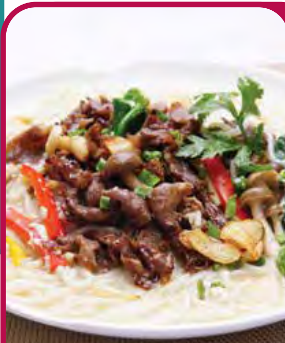
$10 80 | N7 Beef Mushroom Gravy Noodle 肥牛焖米线