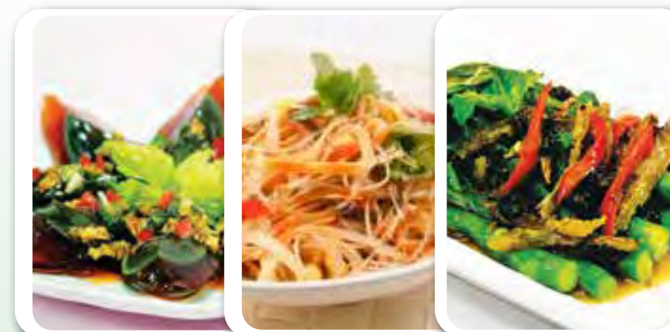
B20 Century Egg 善州松花蛋 $4.20