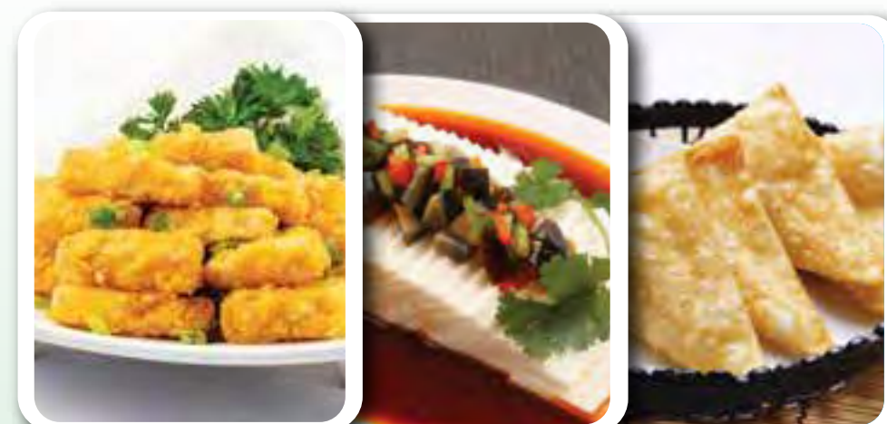
B9 Pumpkin Fries w Salted Egg Yolk 黄金万两 $8.50