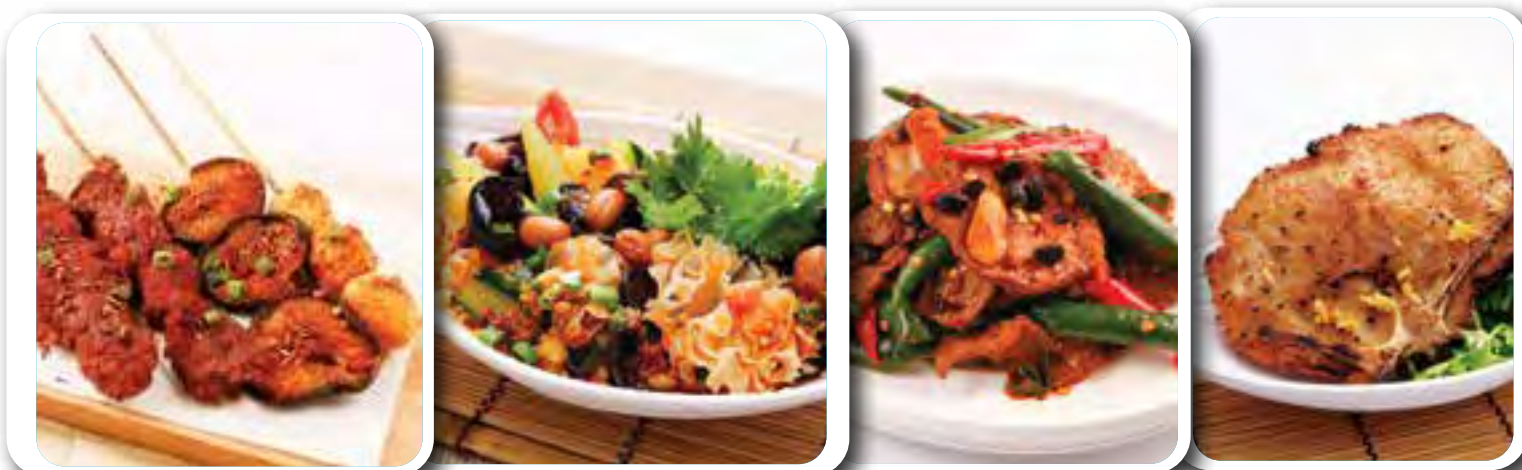
B1 Mix Pork Skewer w Fragrant Spice 特色串烧 $8.50