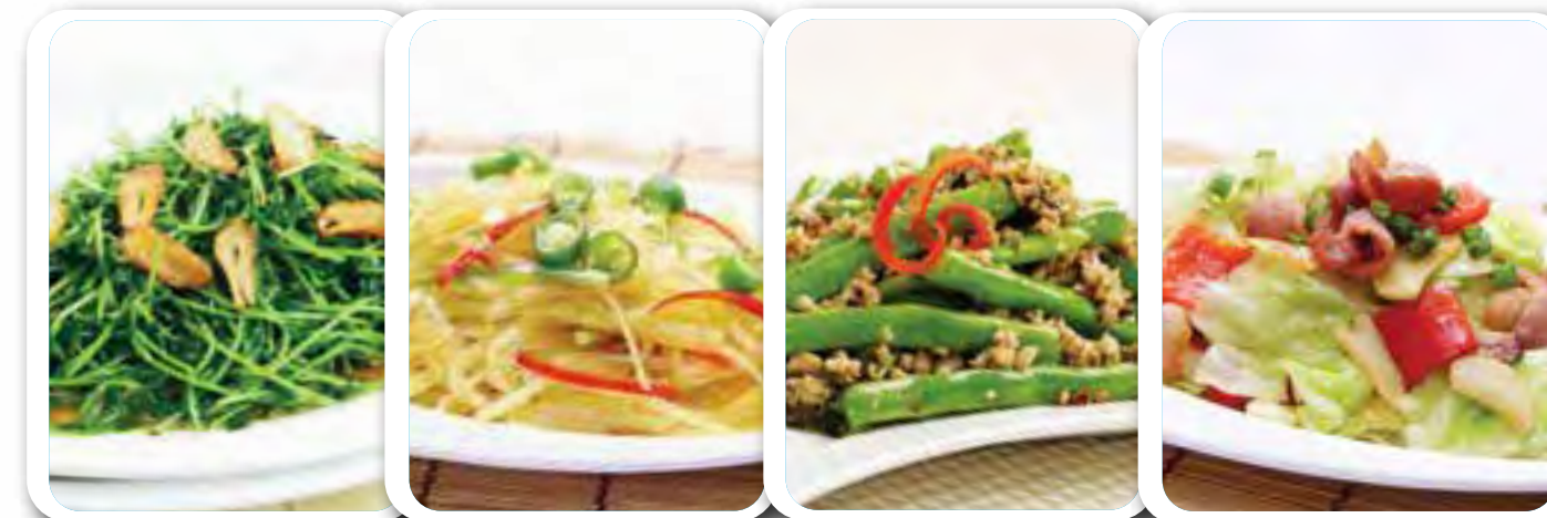
B16 Stir-fried Dou Miao w Garlic 蒜香豆苗 $8.50