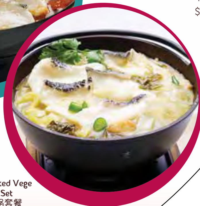
H4 Hotpot Salted Vege Sliced Fish Set 酸菜鱼火锅套餐 $15 80

All hotpot served with rice, Sze Chuan vegetable and bean thread. 火锅都有配上饭、榨菜和凉拌豆丝。