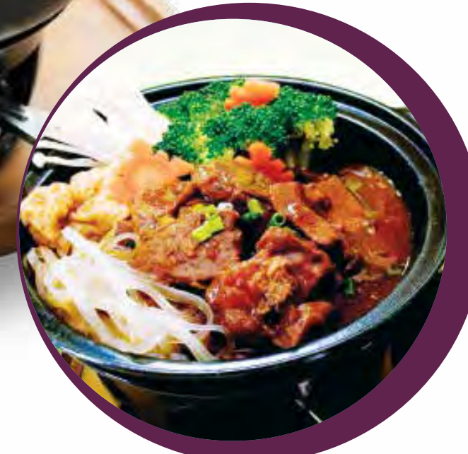
H2 Hotpot Pork Ribs Set/ Beef Set 排骨/牛腩火锅套餐 $15 80